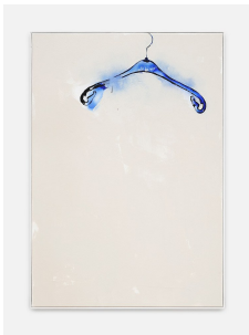
David Ostrowski Hanger , 2022 Acrylic and lacquer on canvas, wood 101 x 71 cm