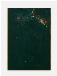
David Ostrowski Hanger , 2022 Acrylic on canvas, wood 101 x 71 cm