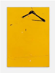
David Ostrowski Hanger, 2022 Acrylic and cotton on canvas, wood 101 x 71 cm