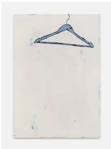
David Ostrowski Hanger, 2022 Acrylic on canvas 100 x 70 cm