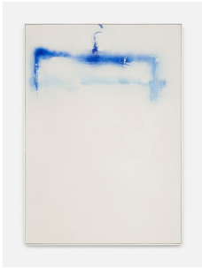
David Ostrowski Hanger , 2022 Acrylic and lacquer on canvas, wood 101 x 71 cm