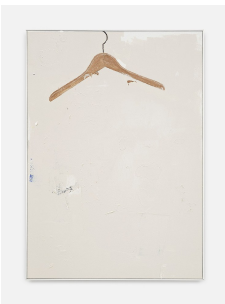
David Ostrowski Hanger, 2022 Acrylic and paper on canvas, wood 101 x 71 cm