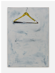
David Ostrowski Hanger , 2022 Acrylic on canvas, wood 101 x 71 cm