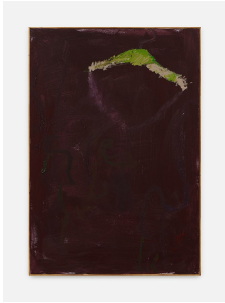
David Ostrowski Hanger, 2022 Acrylic and lacquer on canvas, wood 101 x 71 cm