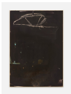
David Ostrowski Hanger , 2022 Acrylic and paper on canvas, wood 101 x 71 cm