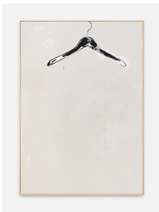
David Ostrowski Hanger , 2022 Acrylic on canvas, wood 101 x 71 cm