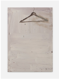
David Ostrowski Hanger, 2022 Acrylic on canvas 100 x 70 cm