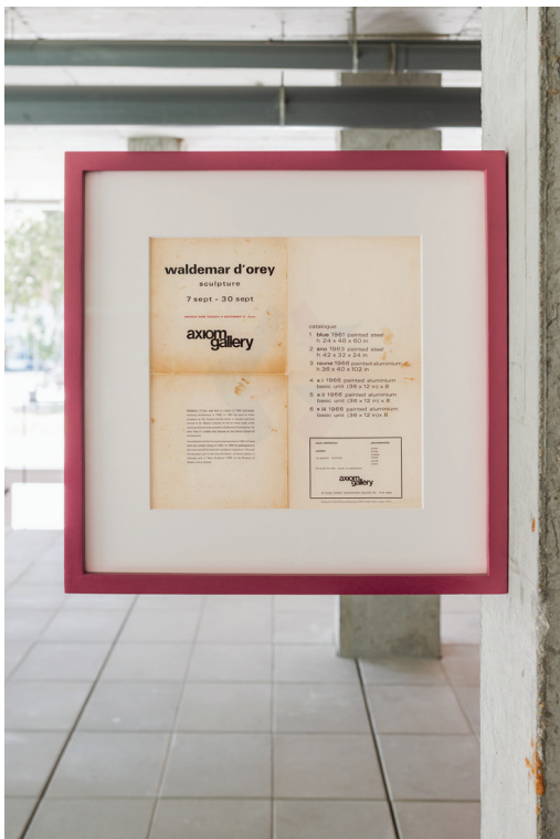
Waldemar d'Orey, Something is missing , 2022 Waldemar d'Orey-10.tiff