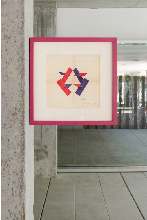
Waldemar d'Orey, Something is missing , 2022 Waldemar d'Orey-9.tiff