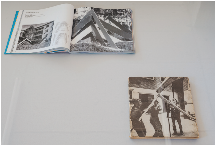
Waldemar d'Orey, Something is missing , 2022 Waldemar d'Orey-6.tiff