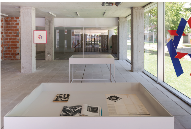
Waldemar d'Orey, Something is missing , 2022 Waldemar d'Orey-5.tiff