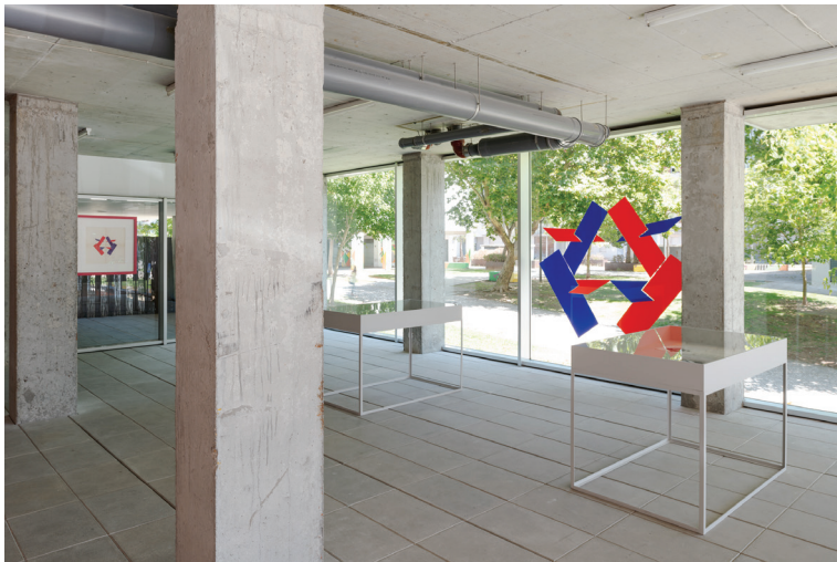
Waldemar d'Orey, Something is missing , 2022 Waldemar d'Orey-4.tiff