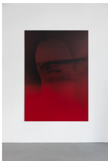
Jenna Sutela The dark boiling , 2020 Unique c-print photogram mounted on dibond 170 x 120 cm

Courtesy of max goelitz and Embajada Copyright of the artist Photo: Dirk Tacke