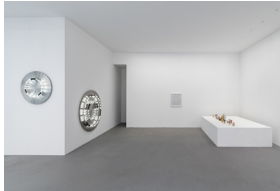
Installation view | forking paths

Please note the following photo credits and courtesies: