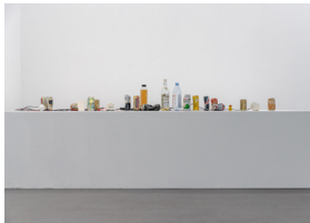
Gabriella Torres-Ferrer Mine Your Own Business (8) , 2022 Microcomputers, live data, found objects, electroluminescent LED panels, batteries and wires Dimensions variable, ca. 235 x 45 cm

Courtesy of max goelitz and Lisson Gallery Copyright of the Estate Channa Horwitz Photo: Dirk Tacke