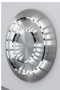
Brigitte Kowanz 456789, 2011 Neon and stainless steel 150 x 150 x 20 cm

Courtesy of max goelitz Copyright of the artists Photo: Dirk Tacke