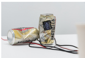
Gabriella Torres-Ferrer Mine Your Own Business (8) , 2022 Microcomputers, live data, found objects, electroluminescent LED panels, batteries and wires Dimensions variable, ca. 235 x 45 cm

Courtesy of max goelitz and Embajada Copyright of the artist Photo: Dirk Tacke