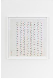
Channa Horwitz Sonakinatography Movement I Sheet C 2nd Variation , 1969 Casein on graph paper 54.6 x 53.3 cm

Courtesy of max goelitz and Lisson Gallery Copyright of the Estate Channa Horwitz Photo: Dirk Tacke