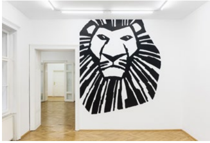
fig. 1023 Haim Steinbach the lion king , 2018 Vinyl decal Dimensions variable Ed. of 2