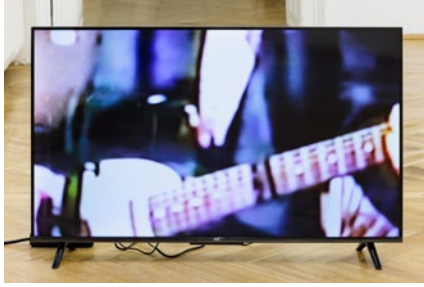
fig. 1022 Nicole-Antonia Spagnola Untitled (interlude 2) , 2023 MP4 (color, sound) 4:00 mins loop Ed. 2 + 1 AP