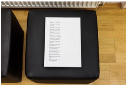
fig. 1004 Tanja Widmann Untitled (Industry 2) , 2023 Script for a TV series, 565 pages, Inkjet print on paper (Canon Black Label Zero) 21.0×29.7×3.0 cm (8.267×11.692×1.181 in) Ed. 1+ 1 AP

Andrea Fourchy, Nicole-Antonia Spagnola, Haim Steinbach, Tanja Widmann Produced in conversation with Tanja Widmann 2.2.–11.3.2023