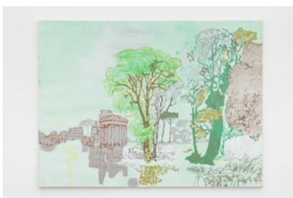
fig. 1017 Andrea Fourchy Alcove , 2023 Acrylic on canvas Ca. 129.5 × 175.25 × 2.5 cm (51 × 69 × 1 in) Unique