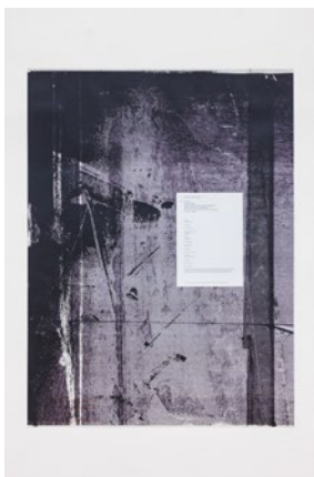
fig. 1030 Tanja Widmann Untitled (Industry Against Nature) , 2023 Inkjet print on digital print 20201007_1 (Vanessa) Ca. 112.5 × 84.1 cm (44.291 × 33.110 in) Unique