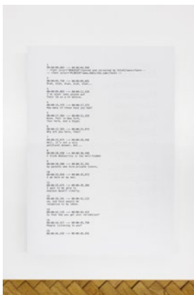
fig. 1012 Tanja Widmann Untitled (Industry 1) , 2023 Script for a TV series, 540 pages, Inkjet print on paper (mondi Nautilus® Classic), Inkjet print on paper (Canon Black Label Zero) 21.0×29.7×2.8 cm (8.267×11.692×1.102 in) Ed. 1+ 1 AP