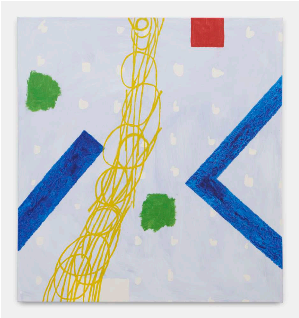
WOLFGANG VOEGELE Untitled, 2023 Oil, acrylic on canvas 150 x 140 cm Unique, signed