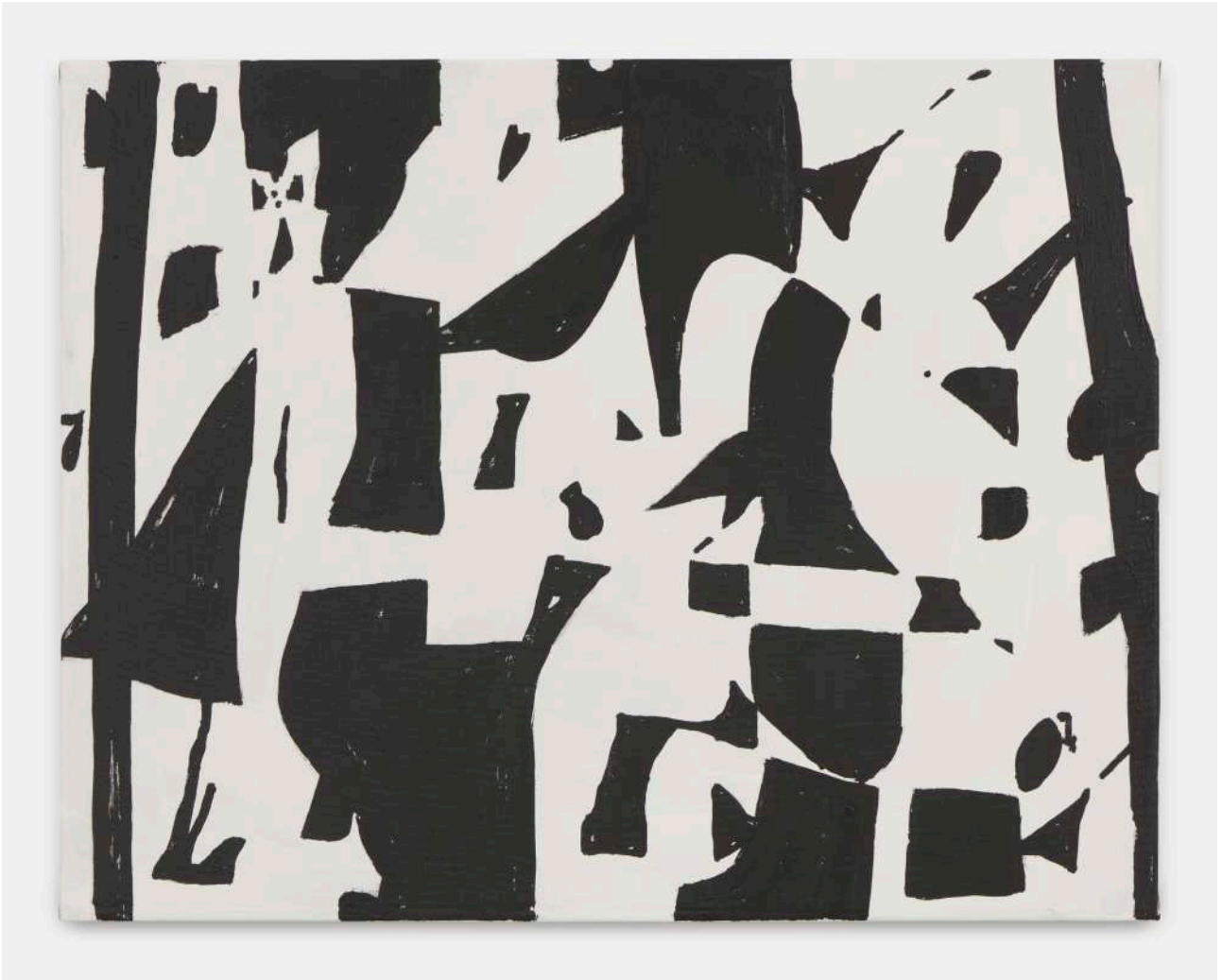
WOLFGANG VOEGELE Bar Mouse , 2023 Oil, acrylic on canvas 70 x 90 cm Unique, signed