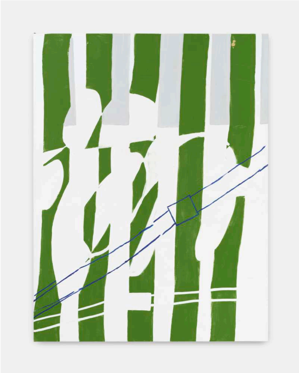
WOLFGANG VOEGELE Untitled, 2023 Oil, acrylic on canvas 170 x 130 cm Unique, signed