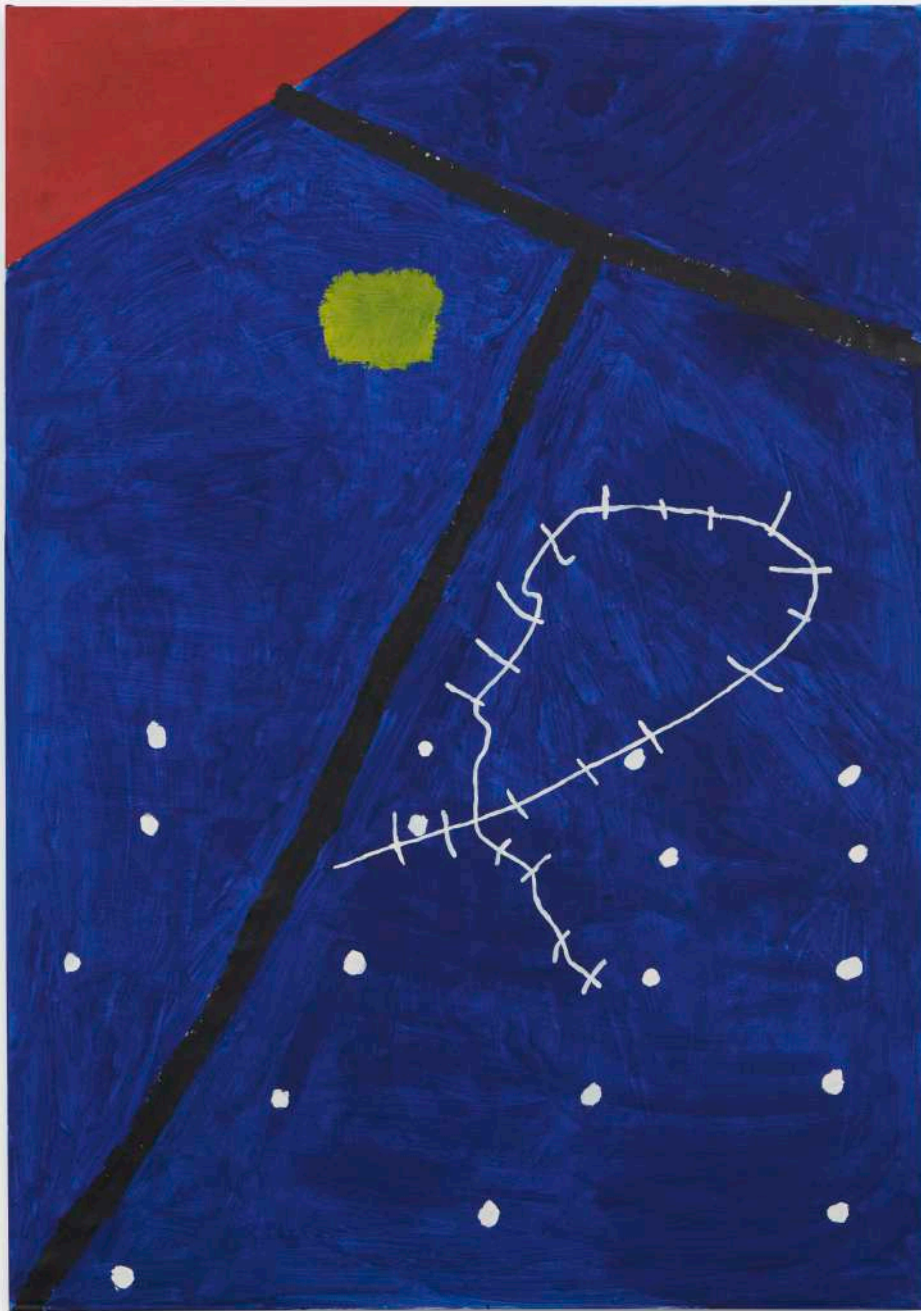
WOLFGANG VOEGELE Untitled, 2023 Oil, acrylic on canvas 170 x 120 cm Unique, signed