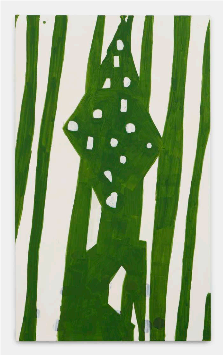
WOLFGANG VOEGELE Untitled, 2023 Oil, acrylic on canvas 150 x 90 cm Unique, signed