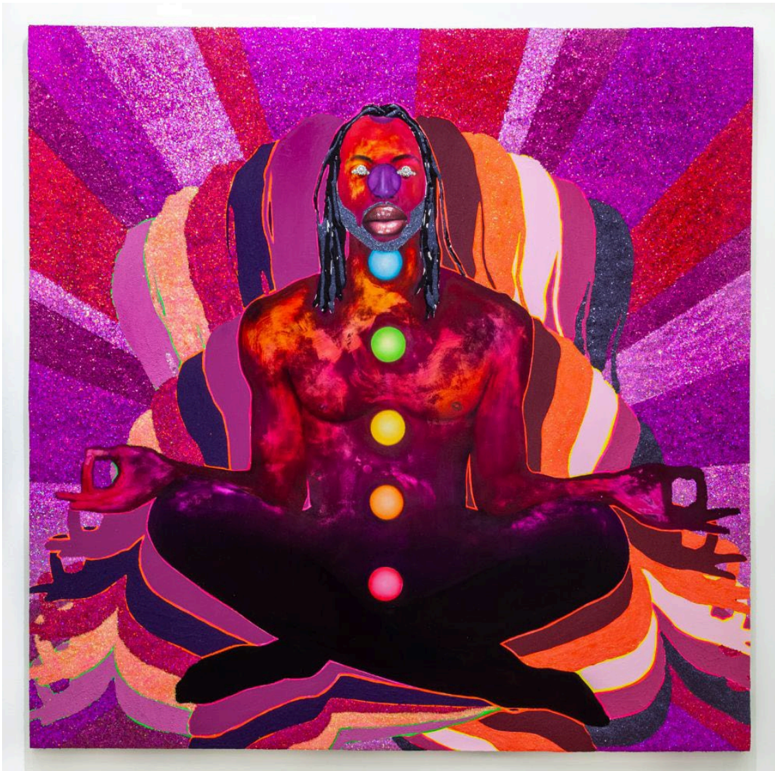
Devan Shimoyama, CHAKRA CHART II, 2021 Oil, Colored pencil, glitter, acrylic, rhinestones, and collage on canvas stretched over panel, 72 x 72 x 1 1/4 in.