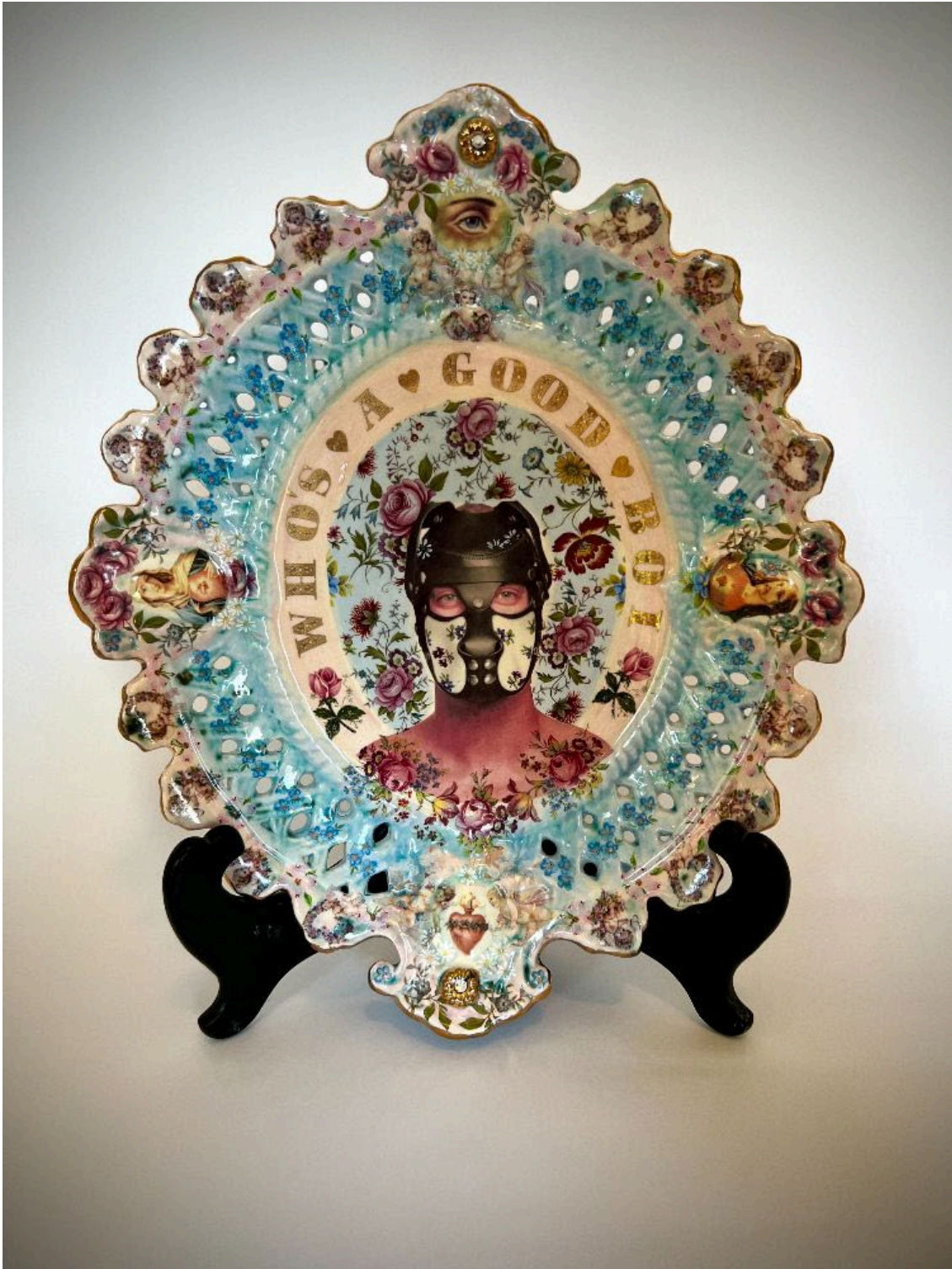
Larry Buller, Who's a Good Boi, 2022, Low-fire clay, decals, gold luster. 15" x 13".