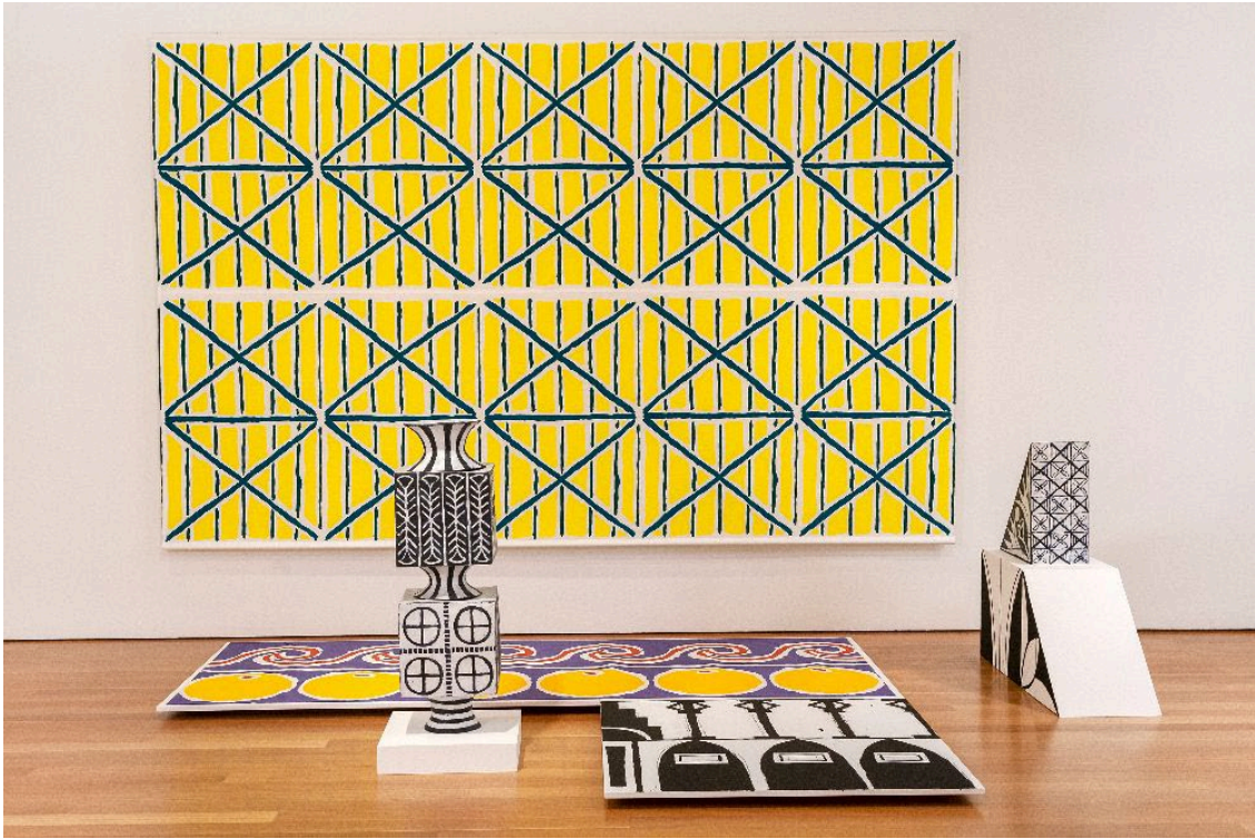
Installation view of Elisabeth Kley: Minutes of Sand , installed at The Fabric Workshop and Museum.