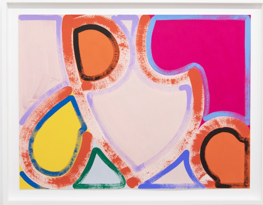
Holly Coulis Shapes and Peach Vase, 2022 Gouache on paper 18 x 24 in (45.7 x 61 cm) H.Coulis0020