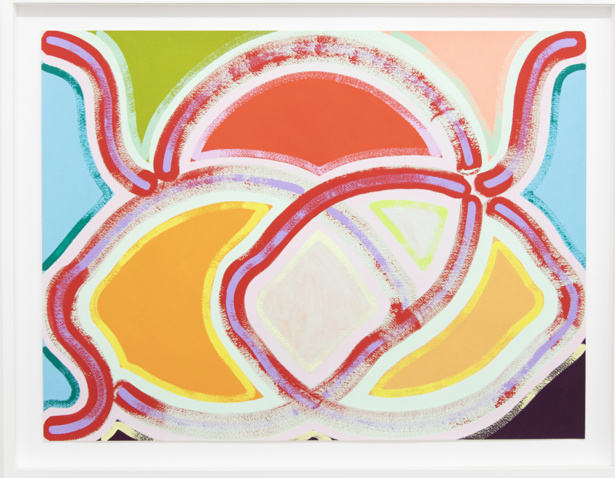
Holly Coulis Orange Sunrise, 2022 Gouache on paper 18 x 24 in (45.7 x 61 cm) H.Coulis0019