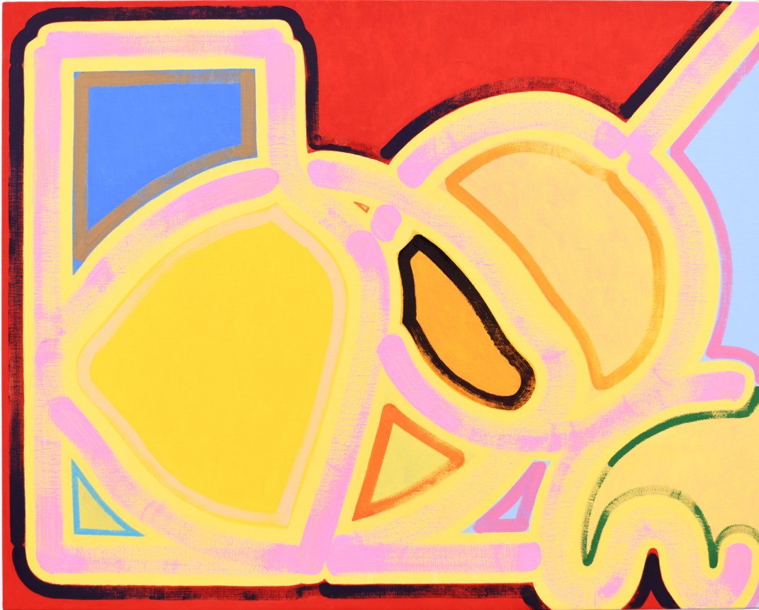
Holly Coulis Lemon Still Life with Vase, 2022 Oil on Linen 24 x 30 in (61 x 76.2 cm) H.Coulis0017