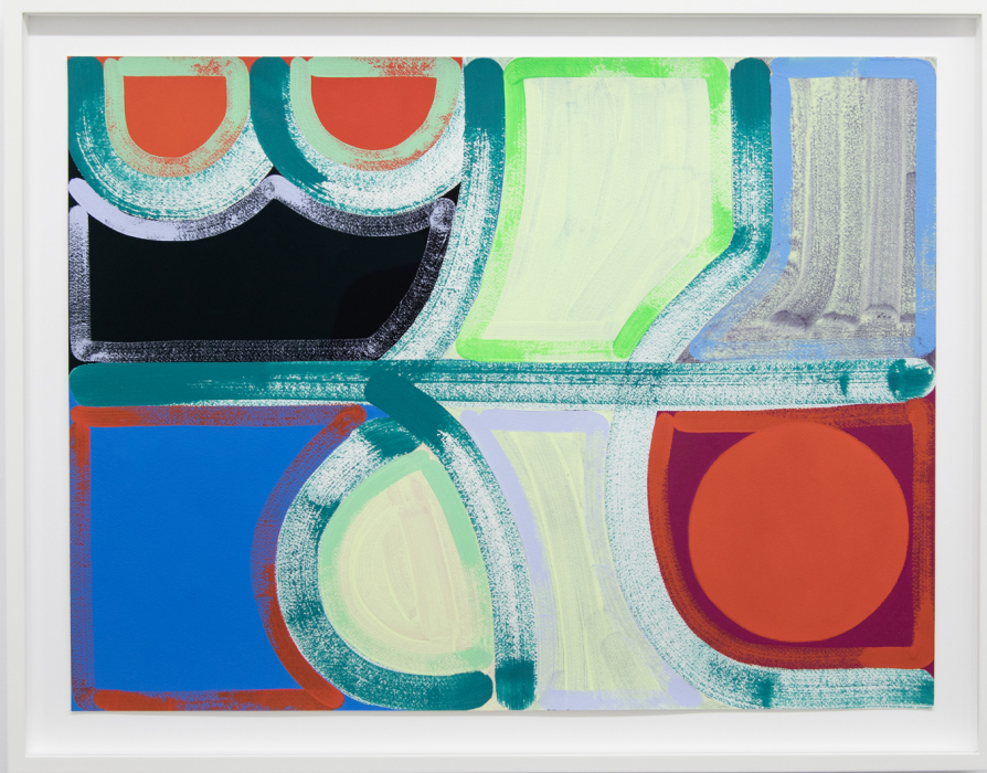
Holly Coulis Vase with Four Oranges , 2022 Gouache on paper 18 x 24 in (45.7 x 61 cm) H.Coulis0022