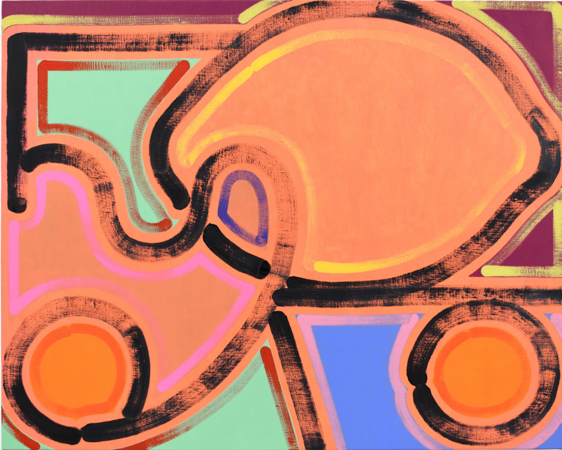
Holly Coulis Grapefruit Still Life with Squiggle Vase, 2022 Oil on linen 24 x 30 in (61 x 76.2 cm) H.Coulis0016