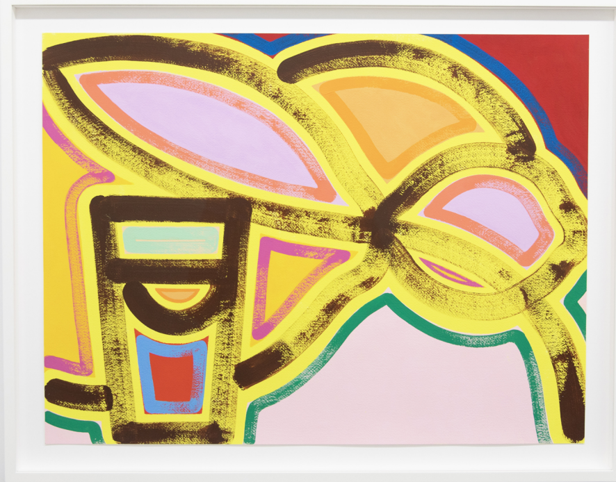
Holly Coulis Red Drink, Lemon Kiss, 2022 Gouache on paper 18 x 24 in (45.7 x 61 cm) H.Coulis0023