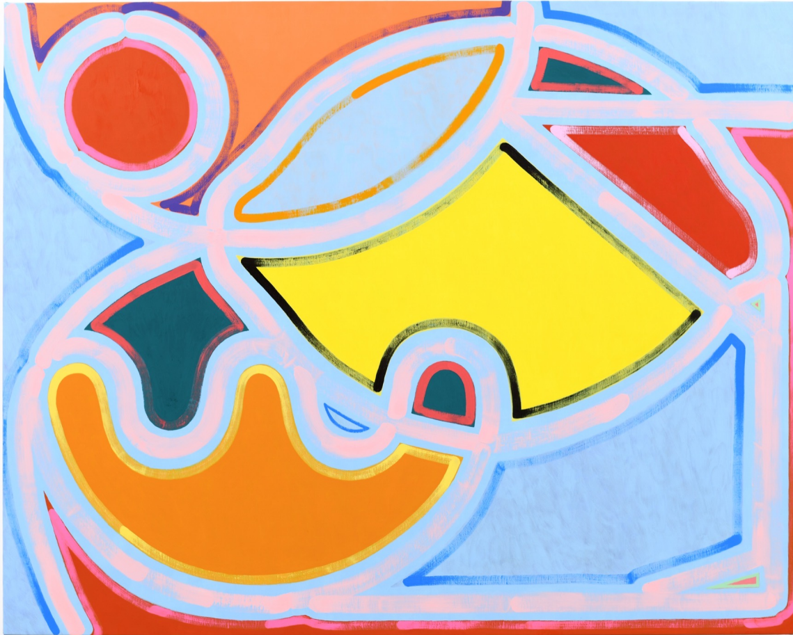
Holly Coulis Martini Squiggle in Blue , 2022 Oil on Linen 40 x 50 in (101.6 x 127 cm) H.Coulis0014