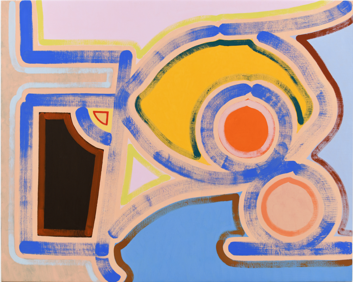
Holly Coulis Petal Still Life with Cola, 2022 Oil on linen 24 x 30 in (61 x 76.2 cm) H.Coulis0018