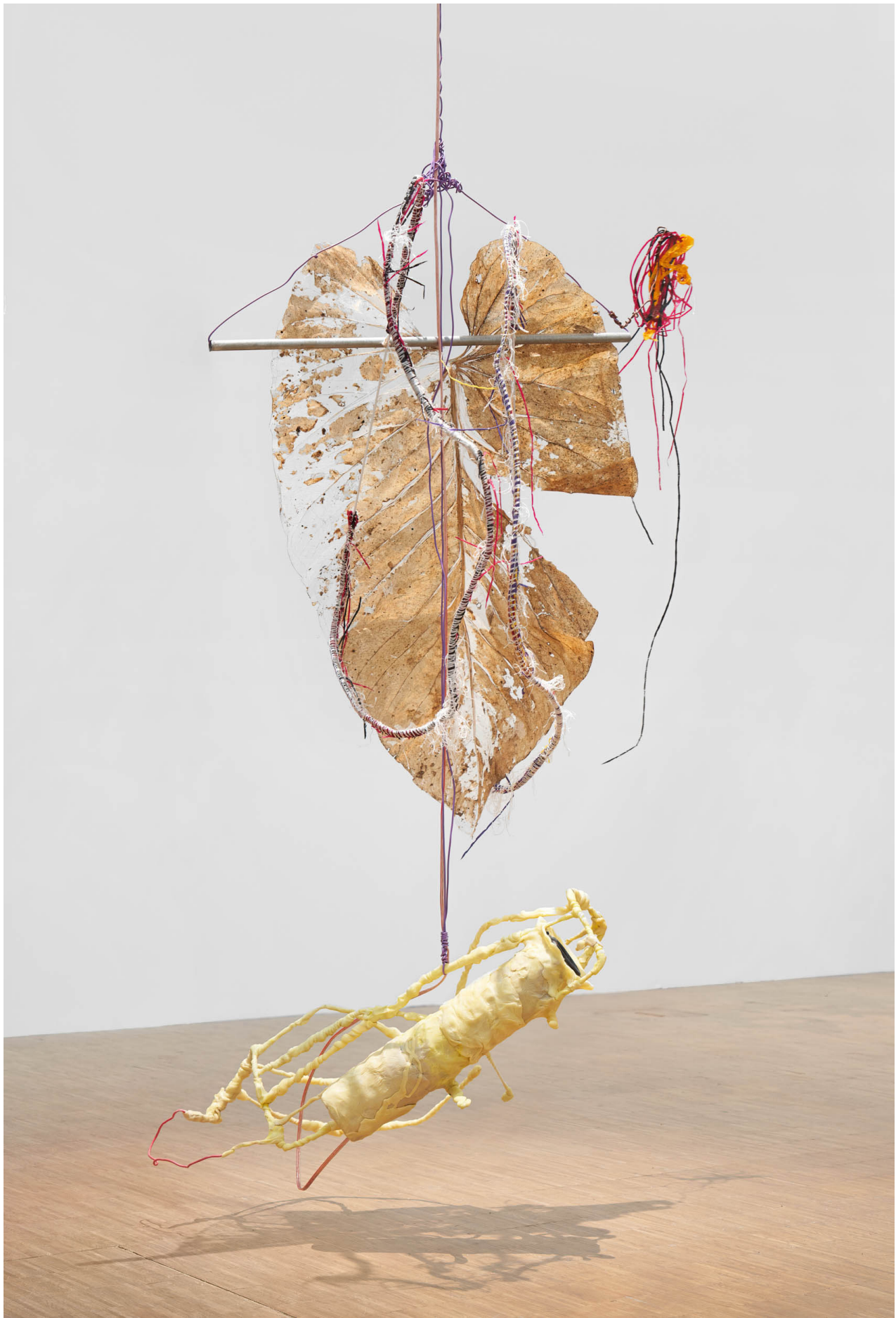
Cassia Alata, rhum, bicarbonate ou Négritude s'écroule en part des anges, je suis fatigué (...), 2021 Plastic, metal, leaf from the forest of the Alma River, speaker, electrical wiring Approx. 200 × 200 × 20 cm / 78 3/4 × 78 3/4 × 7 7/8 in