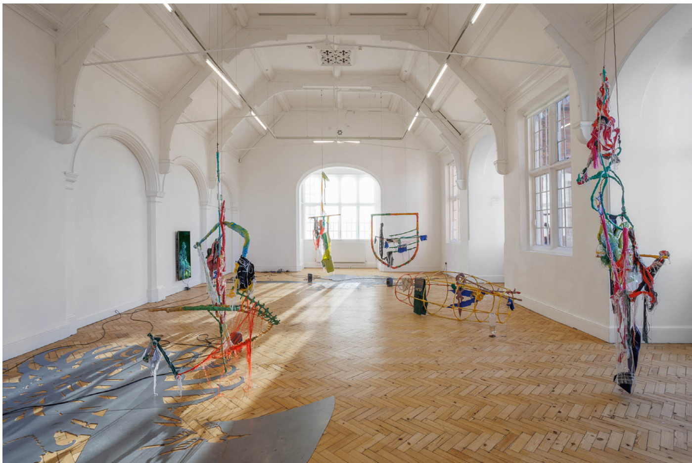
Too blue, too deep, too dark we sank, meandering every moving limb (...) , 2022, Camden Arts Centre, London, England, installation view