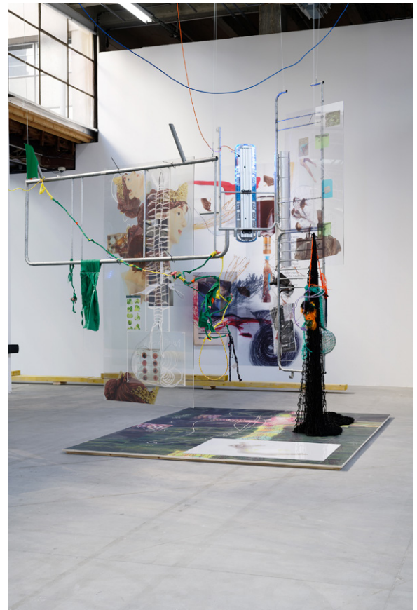
affectionate name, heart, premonition before Josephine was a bunch of stones, 2019 UV print on wood, paper, plastic, hand etched acrylic, fabric, metal, police siren, paint, electrical wiring Approx. 600 × 300 × 350 cm / 236 1/4 × 118 1/8 × 137 3/4 in