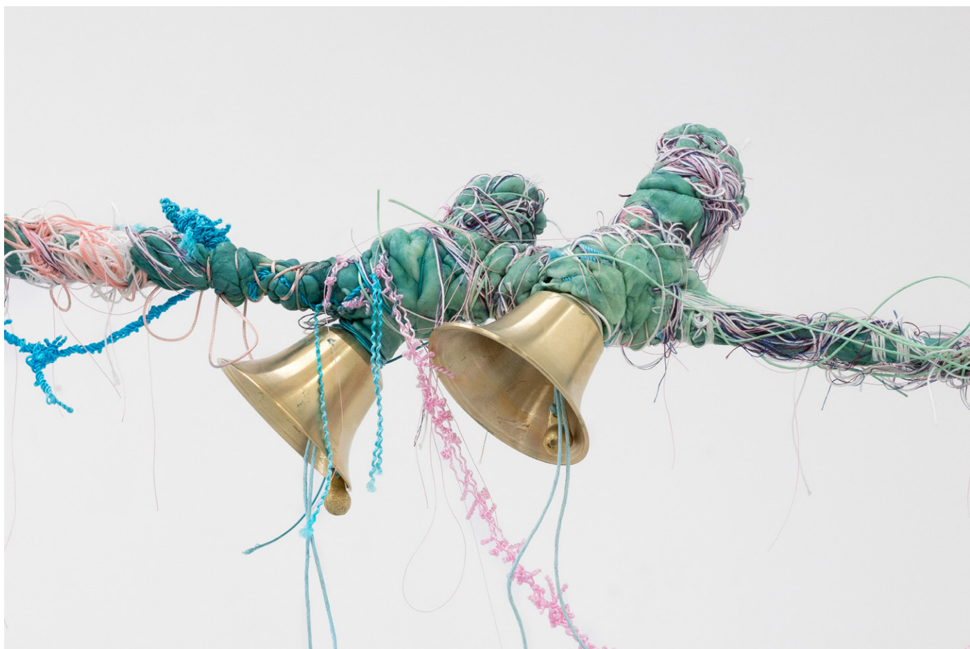
Untitled, 2023 (detail), PCL plastic on steel, fabric, thread, brass bells, vinyl, electrical wiring, rice 300 × 150 × 35 cm/118 1/8 × 59 × 13 3/4 in