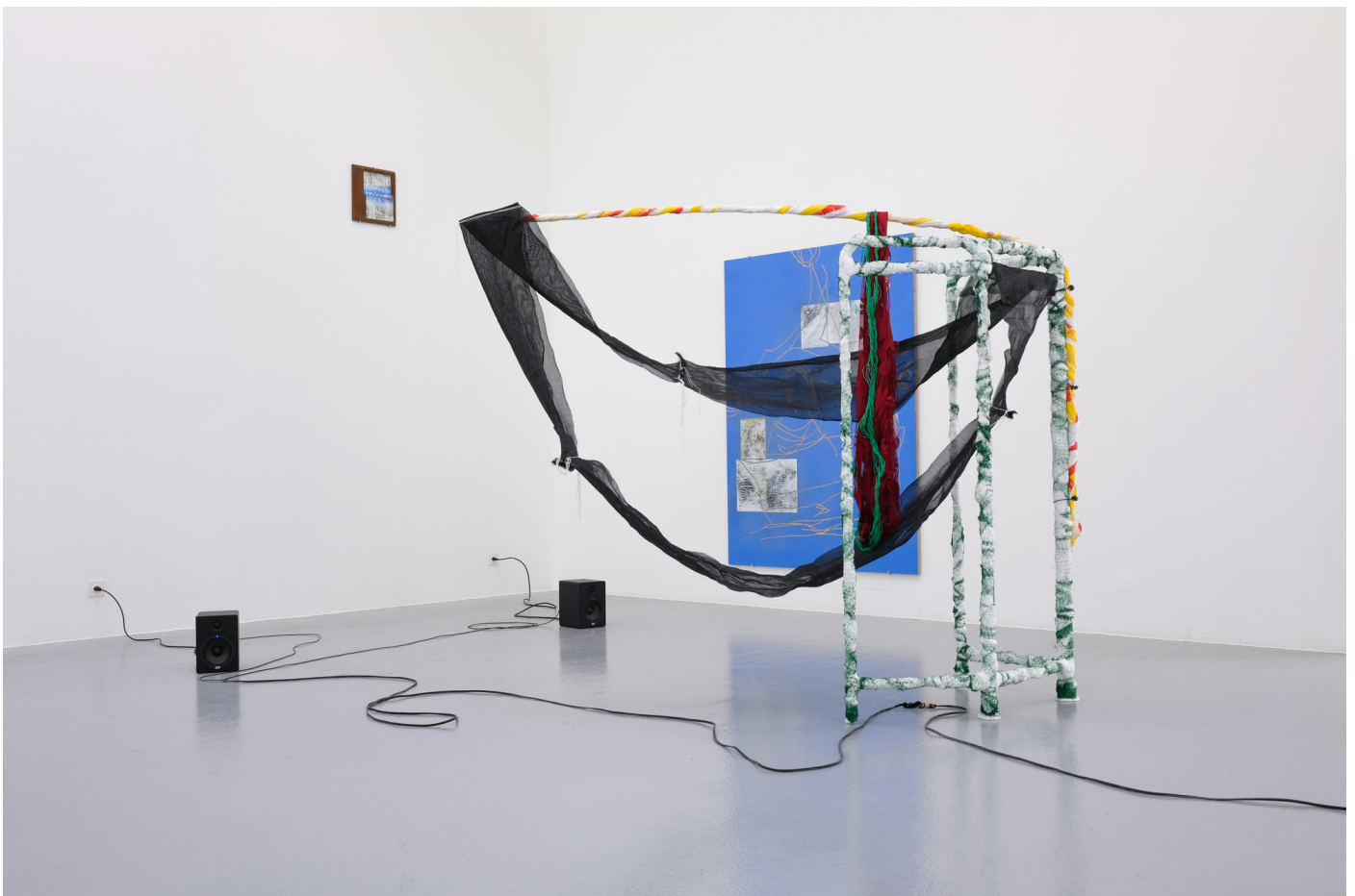
Il pleut encore, des minis gouttelettes (...) , 2019, CAN, Neuchâtel, installation view