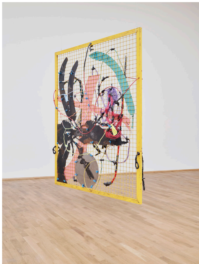
People remain asleep during bad dreams (...), 2020 Metal grid, laser cut steel, paint, plastic, electrical wiring Approx. 210 × 170 × 64 cm / 82 5/8 × 66 7/8 × 25 1/4 in