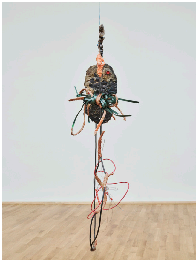
People remain asleep during bad dreams (...), 2020 Plastic, electrical wiring, wood Approx. 230 × 140 × 50 cm / 90 1/2 × 55 1/8 × 19 3/4 in