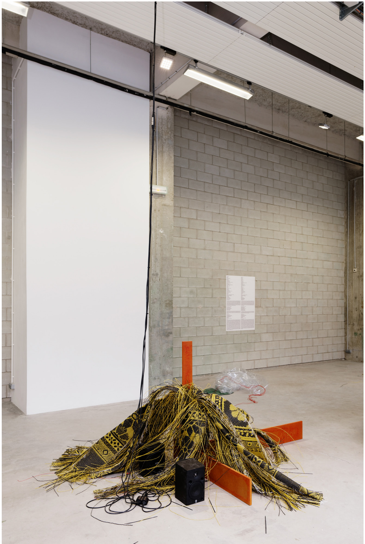
La pluie a rendu cela possible (...) vais-je oser le dire hier on m'a traité de négro de service, 2018 Wood, plastic, pigment, carpet, speakers, sound 250 × 150 × 150 cm / 98 3/8 × 59 1/8 × 59 1/8 in