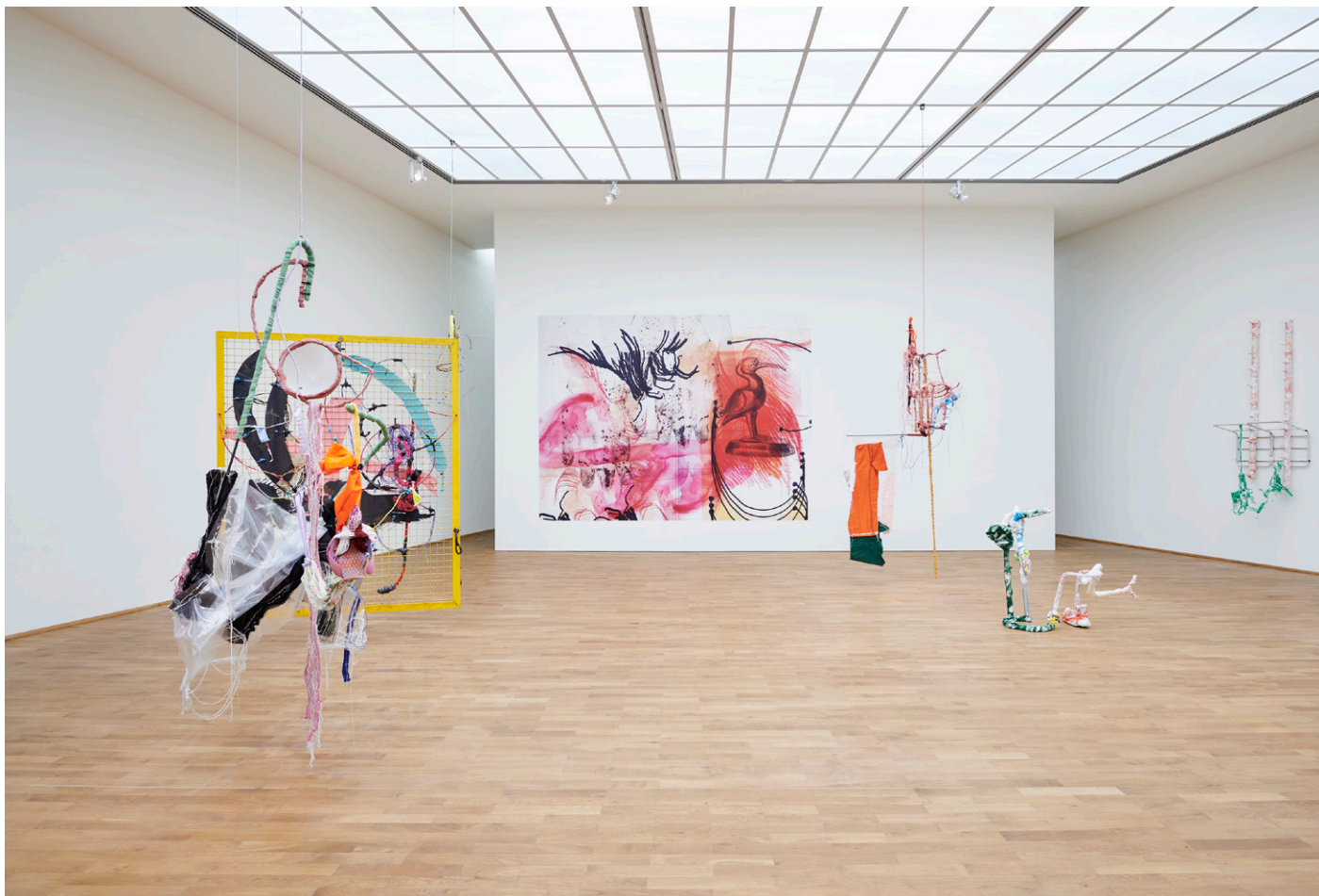
Frank Walter – A Retrospective, 2020, Museum für Moderne Kunst, Frankfurt am Main, Germany, installation view