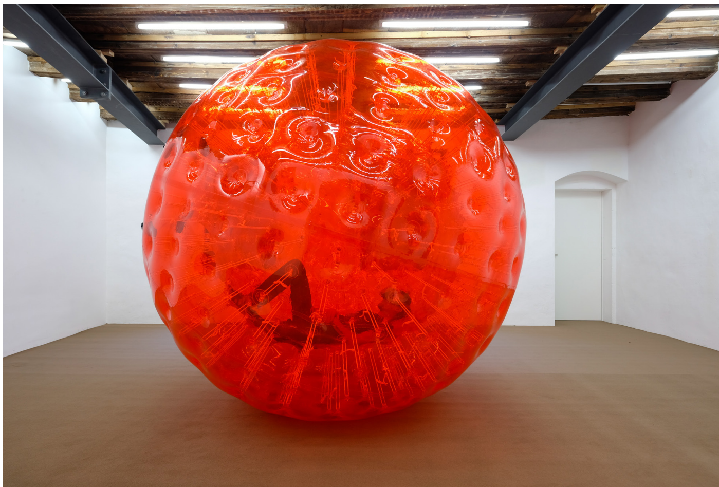
a peptide hormone and neuropeptide , 2019, Zorb ball, VR goggles, virtual reality environment, ø 200 cm / 78 3/4 in