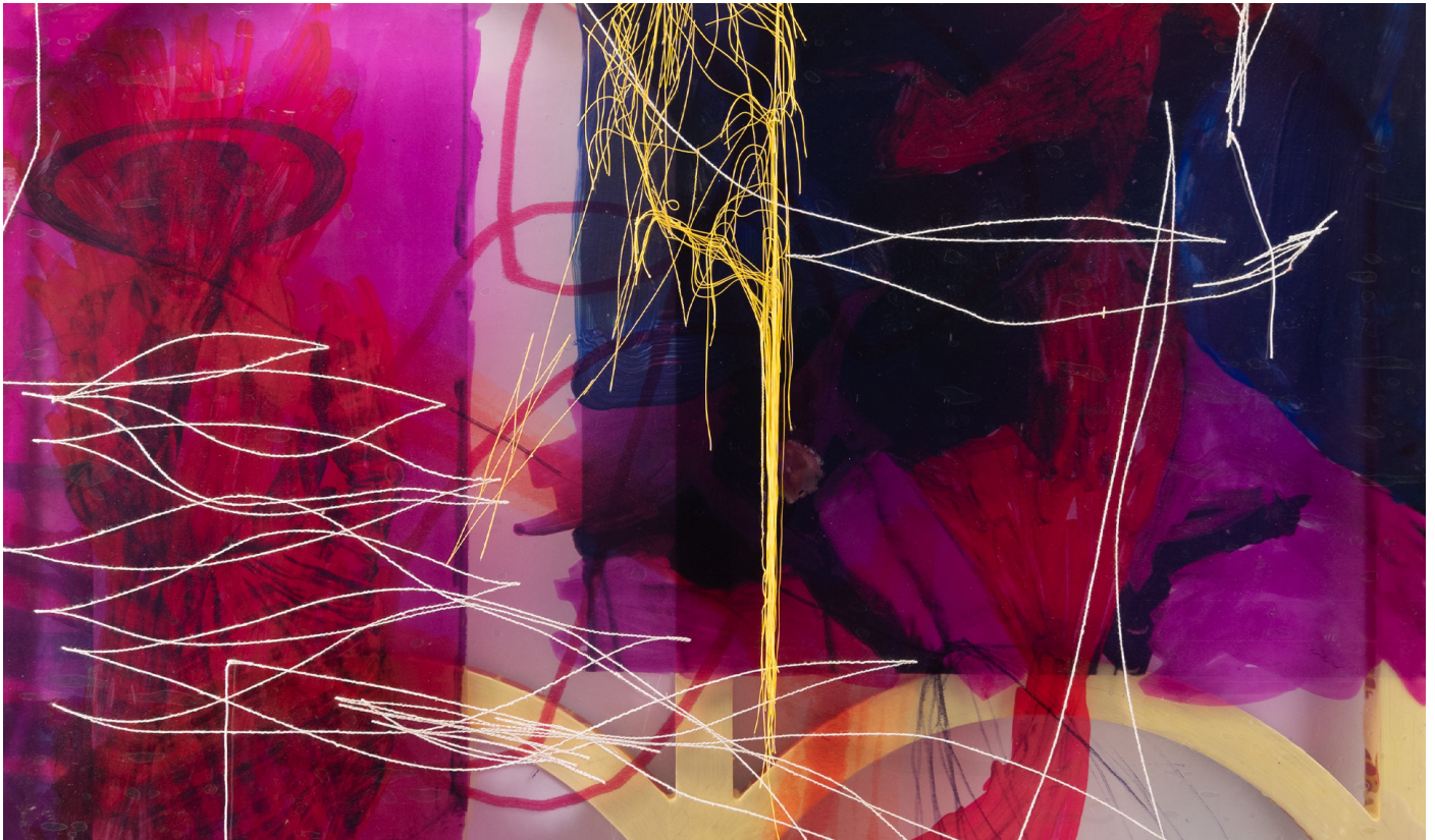
Untitled, 2023 (detail), wood, acrylic paint, UV print on vinyl, thread, 162 × 130 × 3 cm / 63 3/4 × 51 1/8 × 1 1/8 in