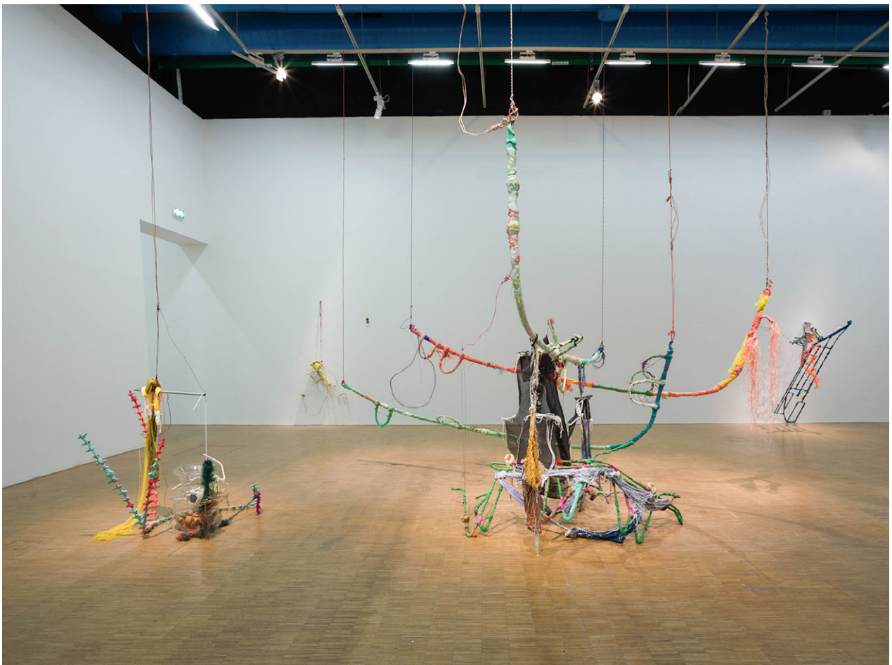
Prix Marcel Duchamp, 2021, Centre Pompidou, Paris, France, installation view