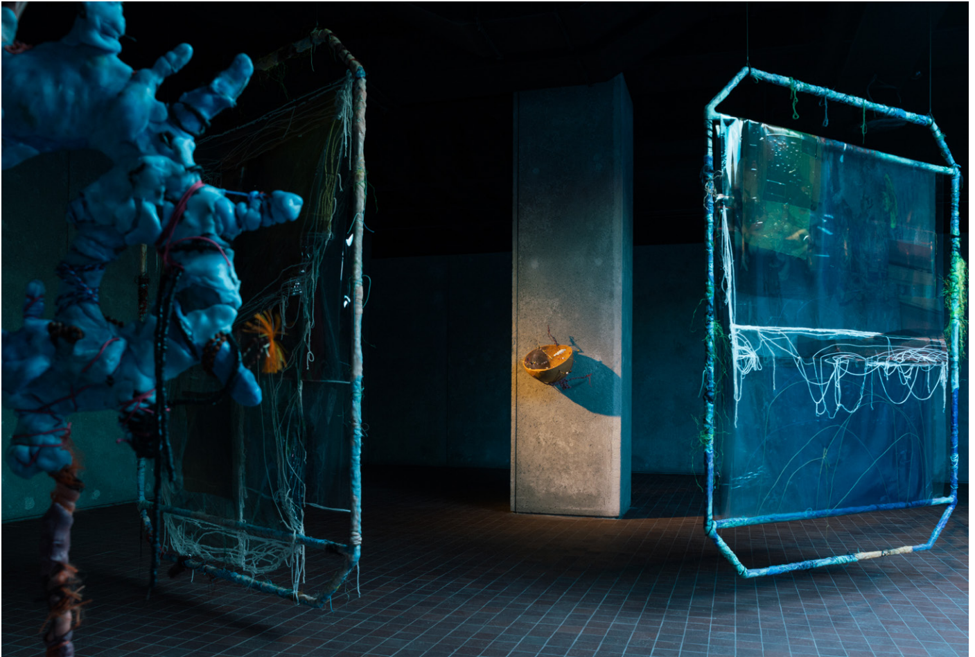
Orphée ruminait des mots à l'étouffée (...) , 2022, LUMA, Arles, France, installation view