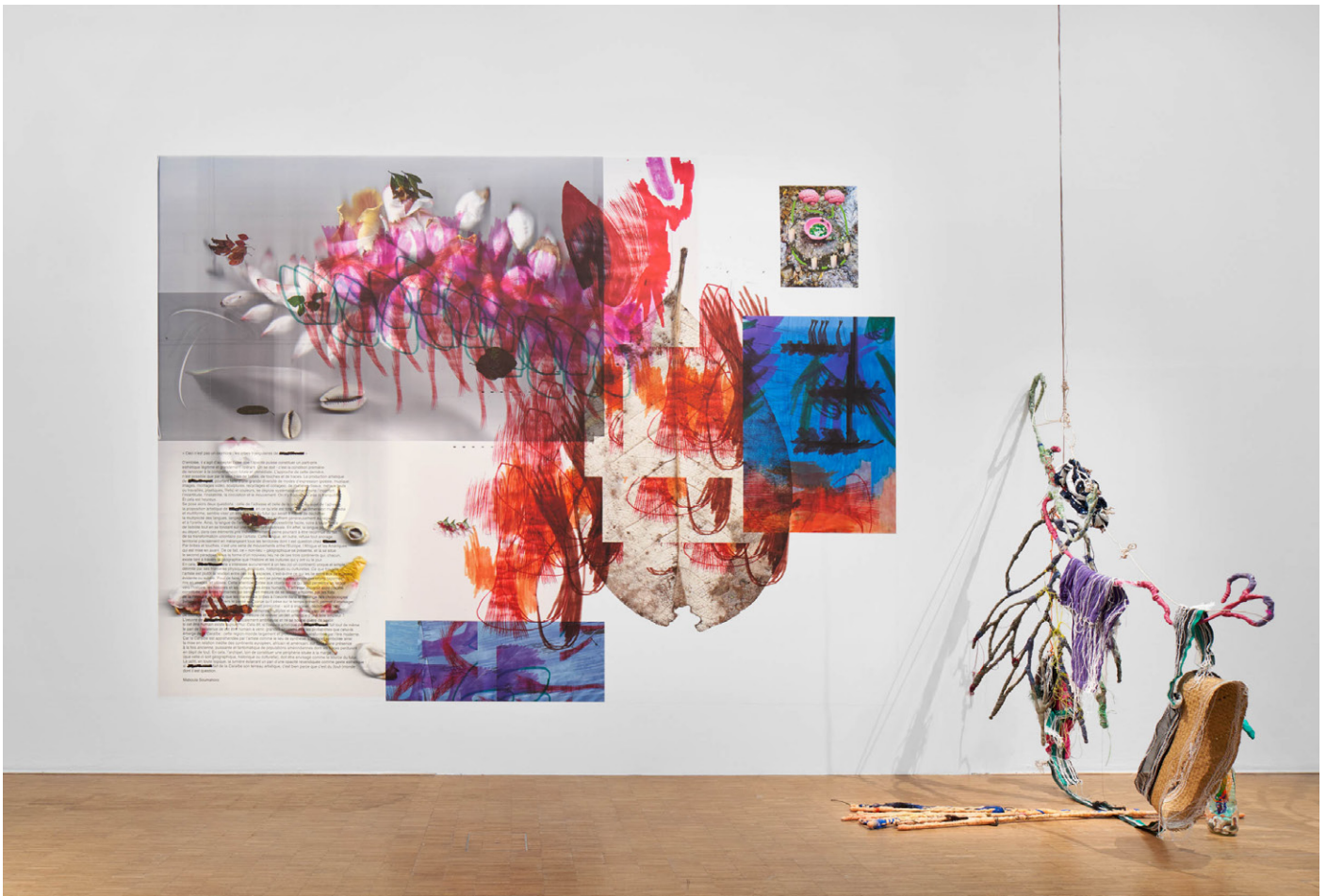
Prix Marcel Duchamp, 2021, Centre Pompidou, Paris, France, installation view