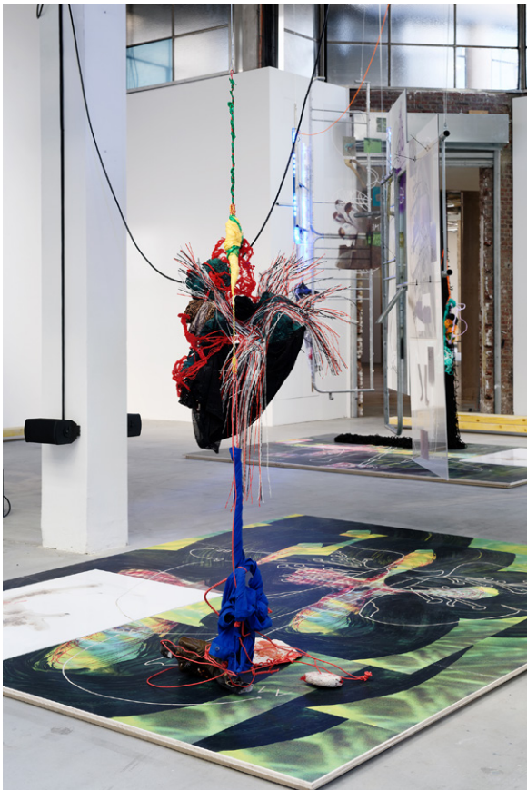
affectionate name, the heart, the sacred heart, they saw, 2019 UV print on wood, paint, paper, plastic, fabric, electrical wiring, metal wiring, approx. 400 × 300 × 300 cm / 157 1/2 × 118 1/8 x 118 1/8 in