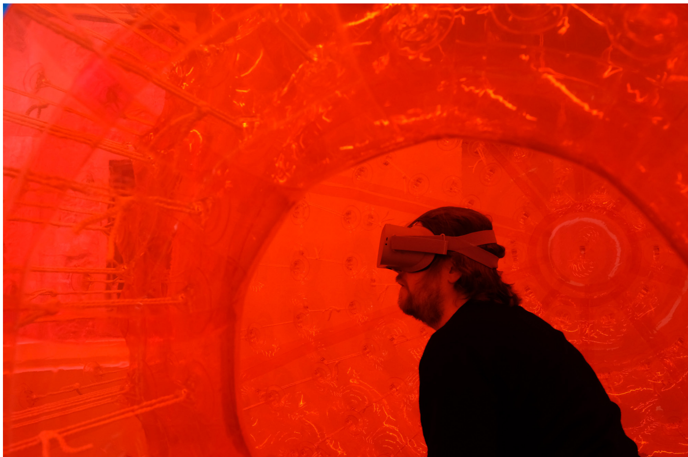
a peptide hormone and neuropeptide , 2019 (detail), Zorb ball, VR goggles, virtual reality environment, ø 200 cm / 78 3/4 in