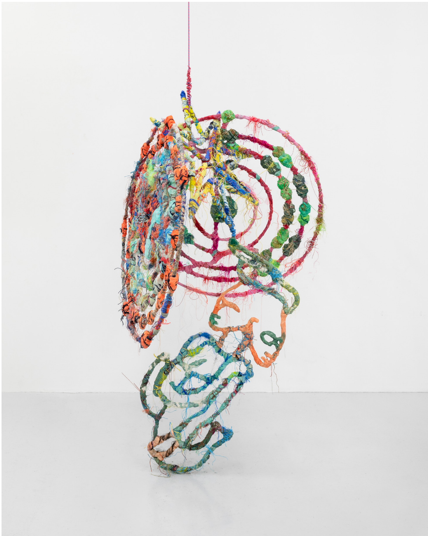
Untitled , 2023, PCL plastic on steel, thread, fabric, electrical wiring, 170 × 110 × 110 cm / 66 7/8 × 43 1/4 × 43 1/4 in