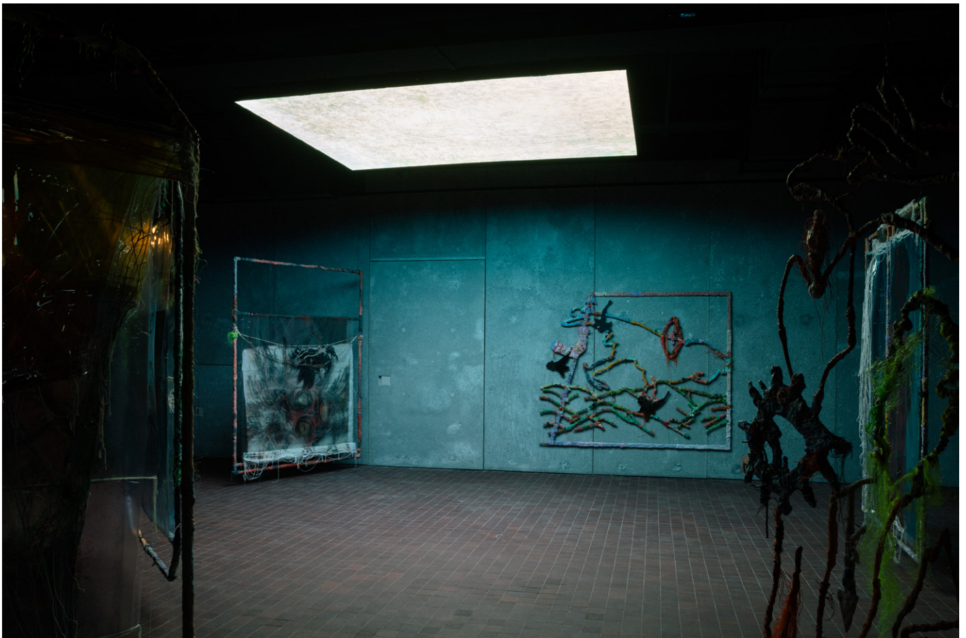
Orphée ruminait des mots à l'étouffée (...) , 2022, LUMA, Arles, France, installation view