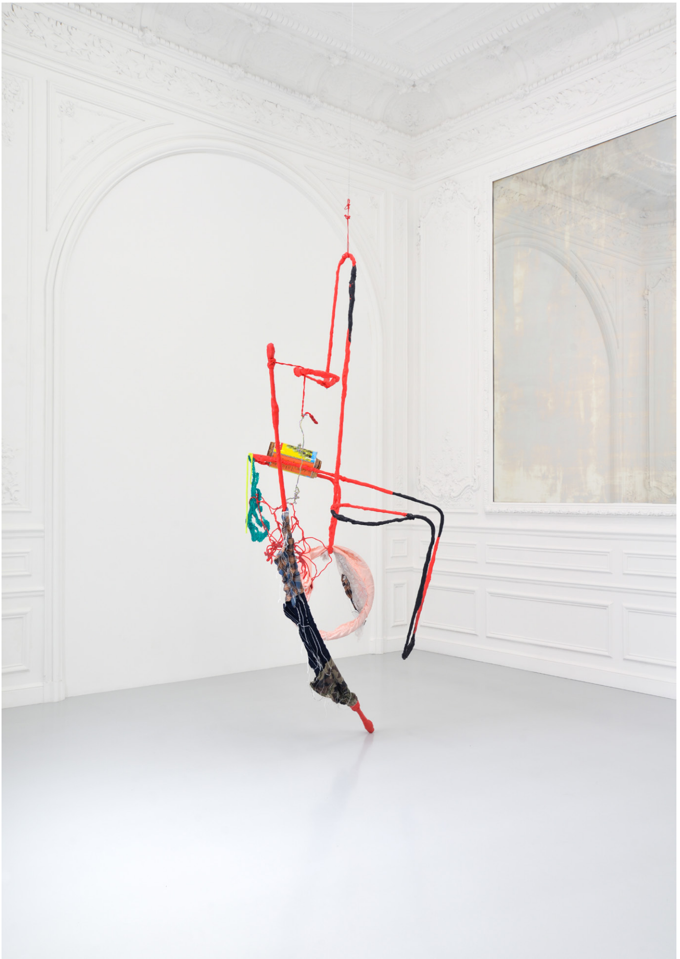
The vicious snake / has always been there / to divide us / crawling, spreading / cells of our blood (...), 2019 Metal, plastic, fabric, lace, can, string, electrical wiring, snake skin 278 × 110 × 40 cm / 109 1/2 × 43 1/4 × 15 3/4 in