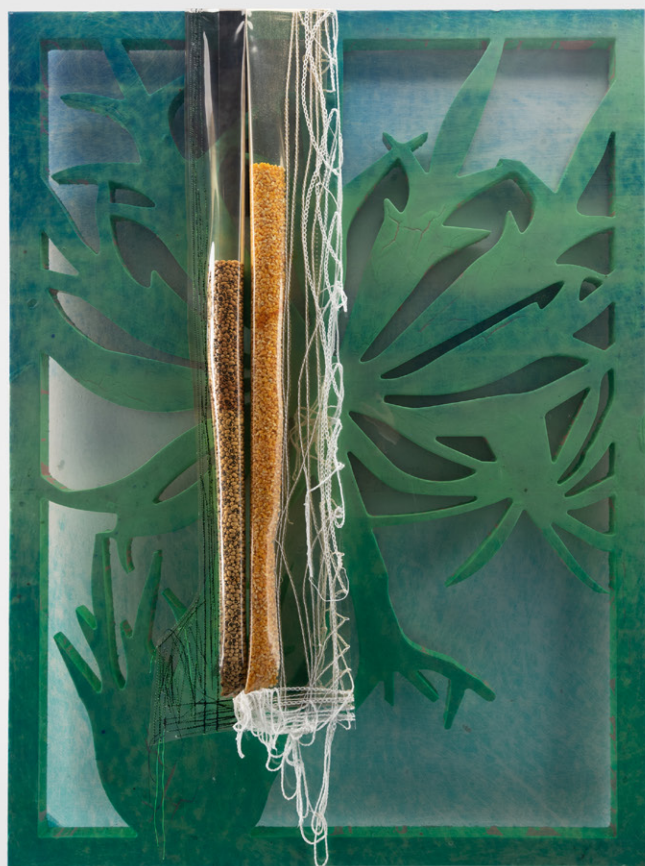
Untitled , 2023, wood, acrylic paint, UV print on vinyl, thread, rice, red beans, black-eyed beans 131 × 97 × 3 cm / 51 5/8 × 38 1/4 × 1 1/8 in