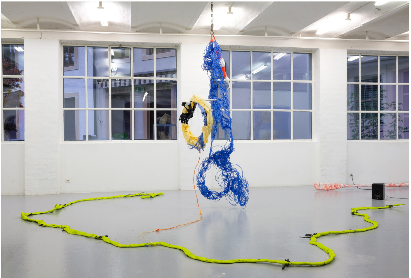
Il pleut encore, des minis gouttelettes (...) , 2019, CAN, Neuchâtel, installation view