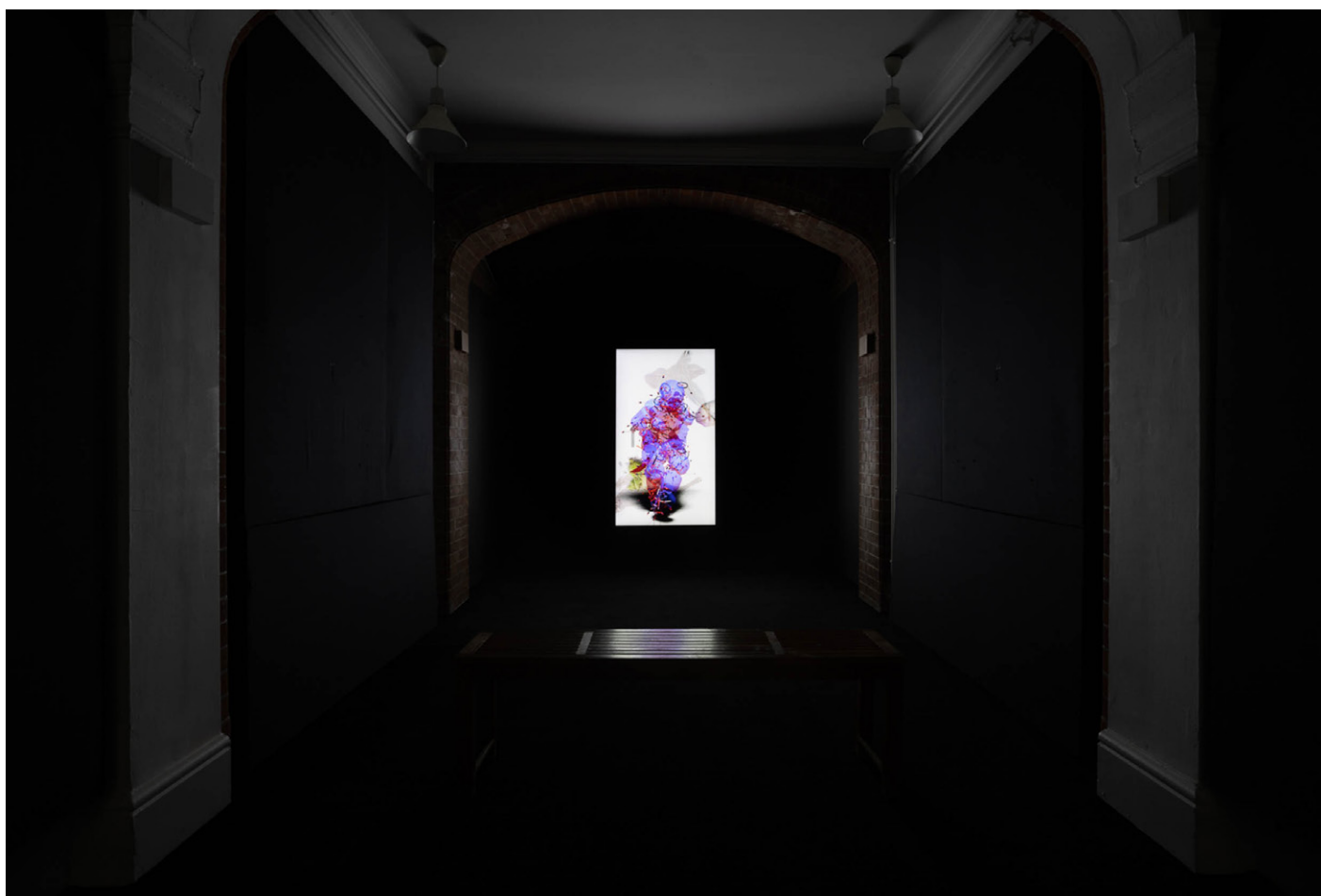
Too blue, too deep, too dark we sank, meandering every moving limb (...) , 2022, Camden Arts Centre, London, England, installation view