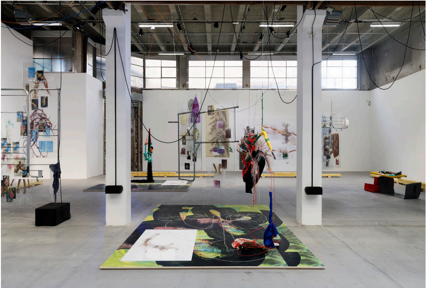
Les lumières affaiblies des étoiles lointaines les lumières (...), 2019, Palais de Tokyo, Paris, installation view