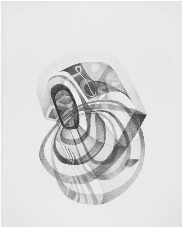
Samara Kupferberg, Untitled , Graphite on Paper 2022.

At a time when humanity is witnessing, with more or less concern, a seemingly absurdist quest for a fantastic future, the old unknown is more relevant than ever in everyone's sight. Coping with such uncertainty develops tendencies for abstract, exploratory journeys through time, space, and, ultimately, life.