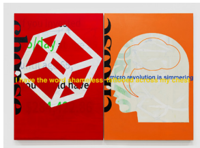
Andy Meerow Untitled , 2023 Acrylic, ink and graphite on canvas 60 x 84.5 in (152.4 x 214.6 cm) AM073