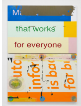
Andy Meerow Untitled , 2022 Acrylic and graphite on canvas 84.5 x 60 in (214.6 x 152.4 cm) AM075