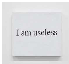
Ann Zhao Untitled , 2022 Sesame seeds and gesso on linen 5 x 5 in (12.7 x 12.7 cm) AZ004