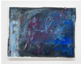
Whitney Claflin Night Loop (Dirty Etnies) , 2023 Oil on canvas 9 x 12 in (22.9 x 30.5 cm) WC072