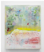
Whitney Clafin Brick Wall , 2023 Oil on canvas 36 x 30 x 3 in (91.4 x 76.2 x 7.6 cm) WC071