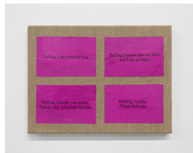
Ann Zhao Four mantras of love , 2022 Acrylic and paper on linen 9 x 12 in (22.9 x 30.5 cm) AZ007