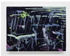
Whitney Claflin In Use , 2023 Oil and alcohol ink on panel 9 x 12 in (22.9 x 30.5 cm) WC074