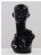
Whitney Clafin April , 2020 Magazine clipping on necklace on mannequin 19 x 7 x 7 in (48.3 x 17.8 x 17.8 cm) WC075