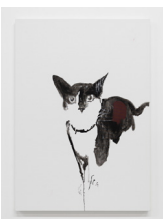
Whitney Clafin Locked and loaded , 2023 Oil on canvas 40 x 28 in (101.6 x 71.1 cm) WC070