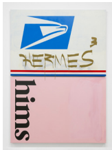
Andy Meerow Untitled , 2022 Acrylic and graphite on canvas 84.5 x 60 in (214.6 x 152.4 cm) AM074