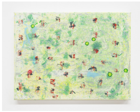
Whitney Claflin Trick Wall , 2023 Oil, alcohol ink, and earring on canvas 9 x 12 in (22.9 x 30.5 cm) WC073