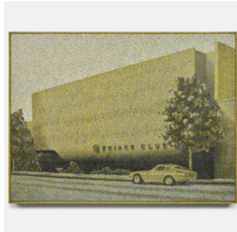
Maserati (Friars Club) , 2022 Oil on canvas with wood frame 18 × 24 in (45.5 × 61 cm)