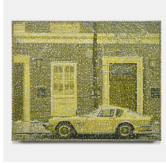
Maserati (The Strasberg Institute) , 2022 Oil on canvas with wood frame 16 × 20 in (40.5 × 51 cm)