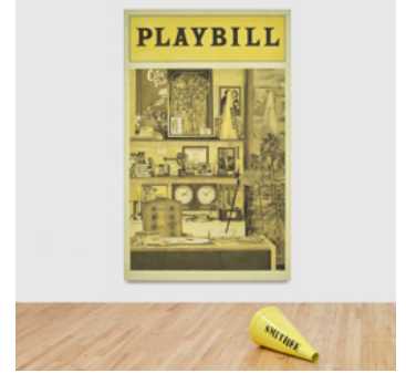
ACT 1: The Corner Office , 2022 Sand on aluminum panel and enamel painted iron 97 × 60 in (246.5 × 152.5 cm)