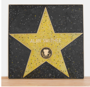
Walk of Fame , 2023 Terrazzo, cement, marble chips, brass inlay and foam 37 × 36 ½ × 1 in (94 × 92.5 × 2.5 cm) Edition 1 of 10 + 2 AP