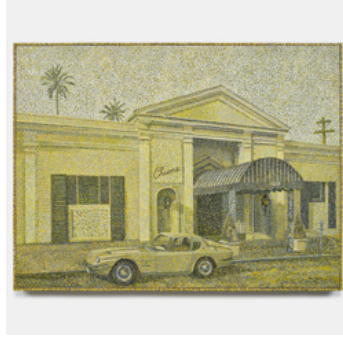
Maserati (Chasen's) , 2022 Oil on canvas with wood frame 18 × 24 in (45.5 × 61 cm)