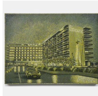
Maserati (Dream Sequence) , 2022 Oil on canvas with wood frame 18 × 24 in (45.5 × 61 cm)