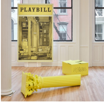
ACT 3: The Loft , 2022 Sand on aluminum panel with enamel painted styrofoam and enamel painted iron 97 × 60 in