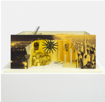
Set Design by Alan Smithee Act 3 , 2022 Gatorfoam, styrene, museum board, bristol board, aluminum and cast resin 18 ½ × 38 × 30 in