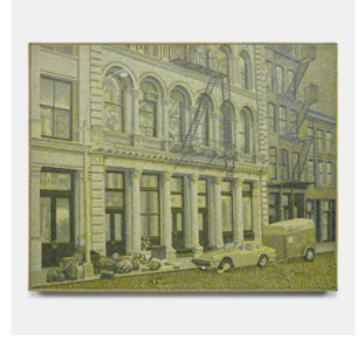
Maserati (39 Walker) , 2022 Oil on canvas with wood frame 30 × 24 in (76 × 61 cm)