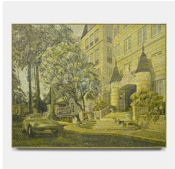
Maserati (Celebrity Centre) , 2022 Oil on canvas with wood frame 24 × 30 in (61 × 76 cm)