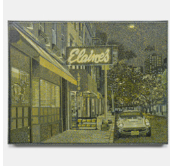
Maserati (Elaine's) , 2022 Oil on canvas with wood frame 20 × 26 in (51 × 66 cm)