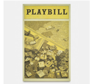
ACT 2: The Cabana , 2022 Sand on aluminum panel 97 × 60 in (246.5 × 152.5 cm)