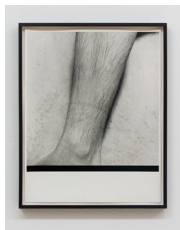
Moyra Davey Leg (1984) s/w Gelatine Silberdruck, b/w gelatine silver print 28 x 36 cm, gerahmt/framed: 30 x 37,6 cm Unique