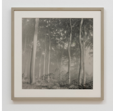
Simone Gilges Planet im Nebel II, 2016 Silbergelatine Handabzug, Karbontoner / Silver gelatin print, carbon toner 53 x 53 cm (gerahmt/framed), Unique