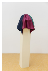
Simone Gilges Der halbleere Kelch, 2016 Holzsockel, Lautsprecher, Hut, Viskosestoff / Wood pedestal, speaker, hat, viscose patchwork ca. / approx. 135 x 40 x 40 cm Sound collage, in collaboration with Elsa M'bala, 1:00:51