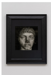
Patrick Faigenbaum Héliogabale. Musee du Capitole, Rome (1986) s/w Gelatine Silberdruck, b/w gelatine silver print 30,5 x 40,5 cm, gerahmt/framed: 38,5 x 47,3 cm Unique