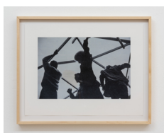
Martin Beck I have heard that the earth is round like a ball, and so are the stars (2013) Pigmentdruck auf Hahnemühle 310g Pigment print on Hahnemühle Photo Rag Smooth 310g 36 x 24 cm, gerahmt/framed: 52 x 41,5 x 3,4 cm Ed. 2/5 + II AP