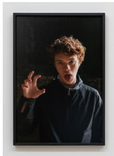
Heinz Peter Knes Untitled, 2023 C-Print 35,4 x 51,2 cm (gerahmt/framed) Ed. 5 + II AP