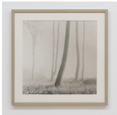
Simone Gilges Planet im Nebel II, 2016 Silbergelatine Handabzug, Karbontoner / Silver gelatin print, carbon toner 53 x 53 cm (gerahmt/framed), Unique