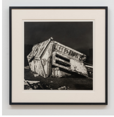
Peter Hujar Shack, Queens (1985) s/w Gelatine Silberdruck / b/w Gelatin silver print 36,8 x 37,5 cm, gerahmt/framed: 53,5 x 53,5 cm Original photographic print by Peter Hujar dated 1985