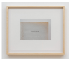
Martin Beck Mary (2013) Pigmentdruck auf Hahnemühle 310g Pigment print on Hahnemühle Photo Rag Smooth 310g 33,2 x 27 cm, gerahmt/framed: 39,1 x 33 x 3,5 cm Ed. 2/5 + II AP