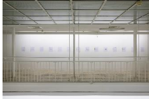
Salwa Aleryani, Masraf, 1972–1974, 2023

Inkjet and silver emboss print on paper, UK National Archives MINT-33-X4-Z (selection of 14 from 164), acrylic glas, plastic beam strips, metal ring binders