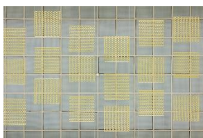
Salwa Aleryani, Remnants of what was once owed , 2023 Brass webbing punched sheets 556 x 620 cm (70 x 70 cm each)