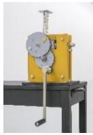
Salwa Aleryani, Variations in pressure, or a thought for your penny , 2023 Penny press machine, 5/10/20 YER coins, assorted magnifying glasses, wooden table 122 x 85 x 56 cm