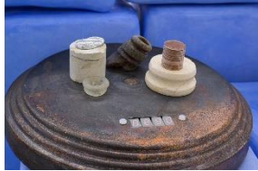
Salwa Aleryani, Weight of a pocket at day's end , 2023 Copper lamp base, weighing scale PCB, LED display, marble, planchet coin on 2 cent coin stack, sea glass bottle heads 12 x Ø 22 cm