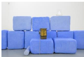
Salwa Aleryani, Warrior—or Man with a raised hand , 2023 Photopolymer flexo printing plate: al-Juba alabaster stele c. 1 BCE–1 CE illustrated on 200 YER (replica from British Museum: object no. 2015,4146.17 orig. by James Moore for De La Rue in 1996), glass stand, antique magnifying glass, qadad cylinder, 7 x 7.5 x 0.1 cm (plate), Ø 12 x 7.5 cm (magnifying glass), Ø 3,5 x 25 cm (cylinder)