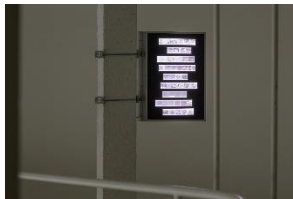
Hans Helfritz, untitled (Jemen), undated

35 mm and 60 mm film negatives, aluminum double sided light box