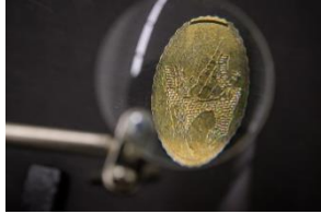
Salwa Aleryani, Variations in pressure, or a thought for your penny , 2023, Detail