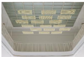
Salwa Aleryani, Remnants of what was once owed , 2023 Brass webbing punched sheets 556 x 620 cm (70 x 70 cm each)