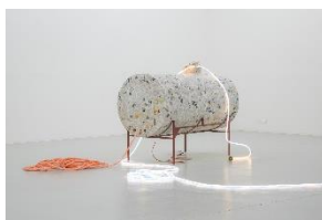
Salwa Aleryani, Means to flow with , 2023 Newspapers, wood, plastic mesh, powder coated steel, brass sprinkle heads, LED hose 195 x 200 x 90 cm