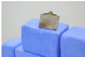
Salwa Aleryani, Postage stamp printing plate (Commemoration of the admission of Yemen to UN), 1947–49, 2023 Steel plate, metal stand 9 x 6 x 0.6 cm