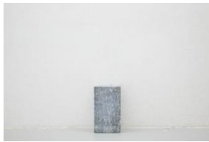
Salwa Aleryani, Coined Notion , 2016 Marble, misstruck error Lincoln coin 48 x 18 x 23 cm