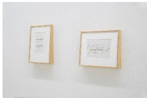
Salwa Aleryani, Potential infringement (brick mold) , 2023 Potential infringement (trowel) , 2023 Each: inkjet print on paper (Patent US162355, Patent US82037), tape, soldered copper rods, tilted oak wood frame 40 x 31.5 x 6 cm, 31.5 x 40 x 6 cm