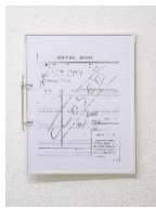
Salwa Aleryani, Masraf, 1972–1974, 2023, Detail

Inkjet and silver emboss print on paper, UK National Archives MINT-33-X4-Z (selection of 14 from 164), acrylic glas, plastic beam strips, metal ring binders