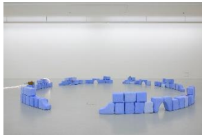
Salwa Aleryani, Far from closing the circle , 2023 Hemp, lime plaster, qadad, pigment 40 x Ø 585 cm