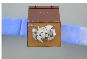
Salwa Aleryani, Memorial to a fallen traffic man , 2023 Metal cash box, cast pewter whistles, steel sheet, weighing scale PCB, LED display 10 x 22 x 16 cm