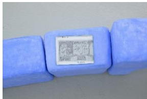
Salwa Aleryani, The front of 28. (200 RIYAL) , 2023 Glass frame, printed paper (part of page 85 ripped from P Symes, M. Hanewich (ed.), The Bank Notes of Yemen (1997) 9 x 12 x 0.5 cm