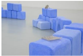
Salwa Aleryani, Two folds , 2023 Inkjet print on folded tracing paper 12 x 10 x 0.5 cm