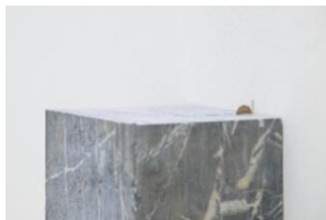
Salwa Aleryani, Coined Notion , 2016, Detail Marble, misstruck error Lincoln coin 48 x 18 x 23 cm