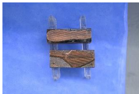
Salwa Aleryani, Utility in low relief , 2023 Glass stand, antique copper letterpress, wood blocks 4 x 6 x 10 cm