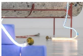
Salwa Aleryani, Means to flow with , 2023, Detail Newspapers, wood, plastic mesh, powder coated steel, brass sprinkle heads, LED hose 195 x 200 x 90 cm