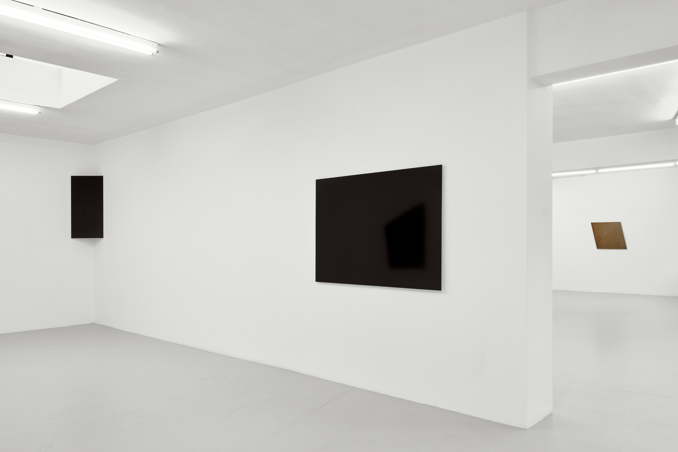
Liz Deschenes / Keystone (Solo Exhibition) 29 September - 17 November 2019 at Campoli Presti, London