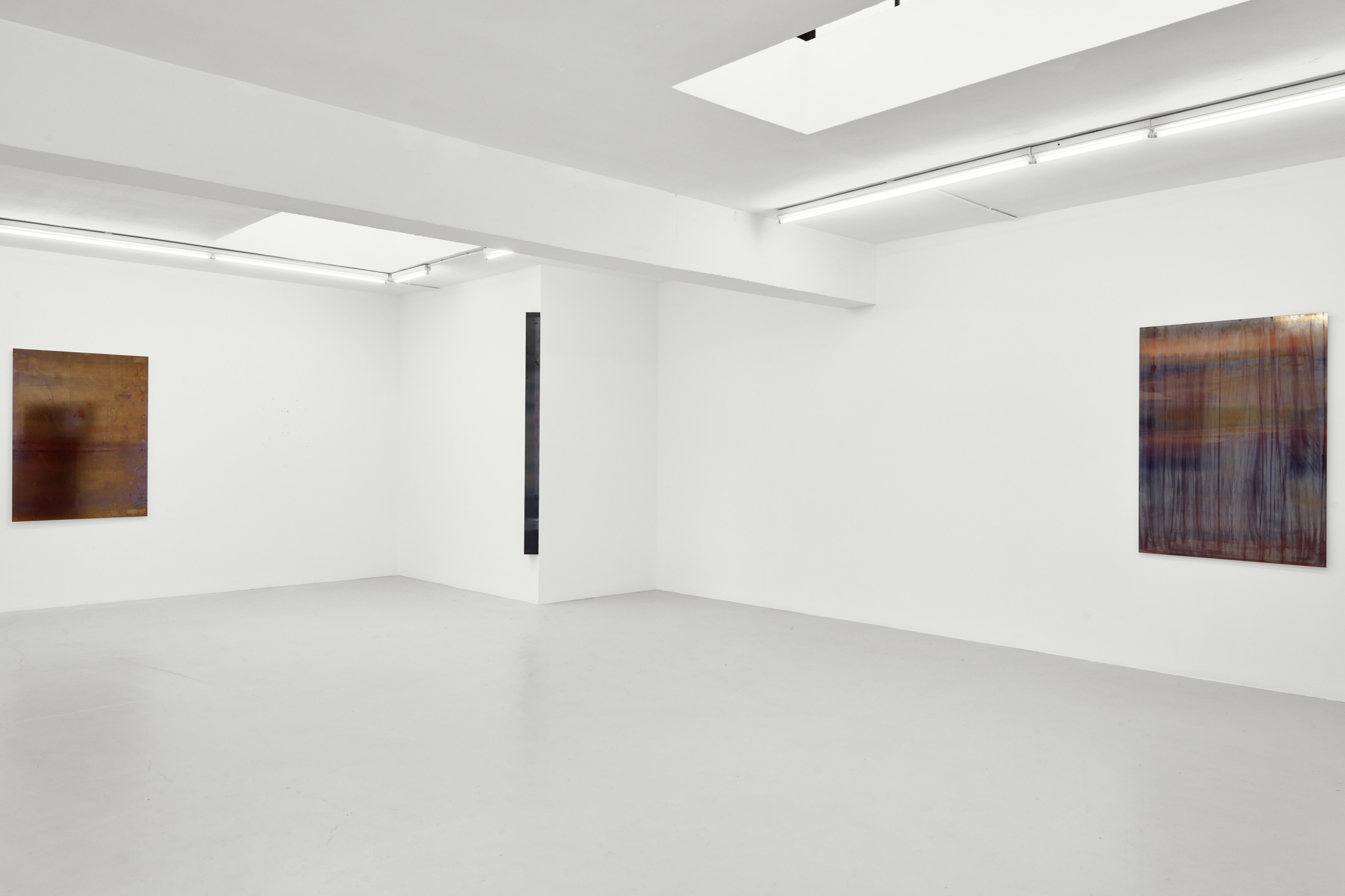
Liz Deschenes / Keystone (Solo Exhibition) 29 September - 17 November 2019 at Campoli Presti, London