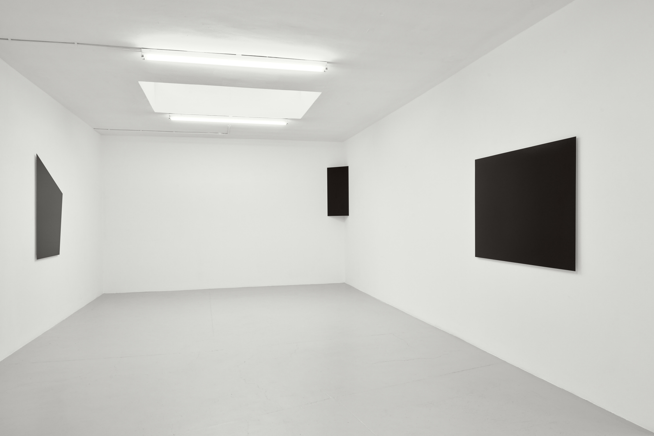
Liz Deschenes / Keystone (Solo Exhibition) 29 September - 17 November 2019 at Campoli Presti, London