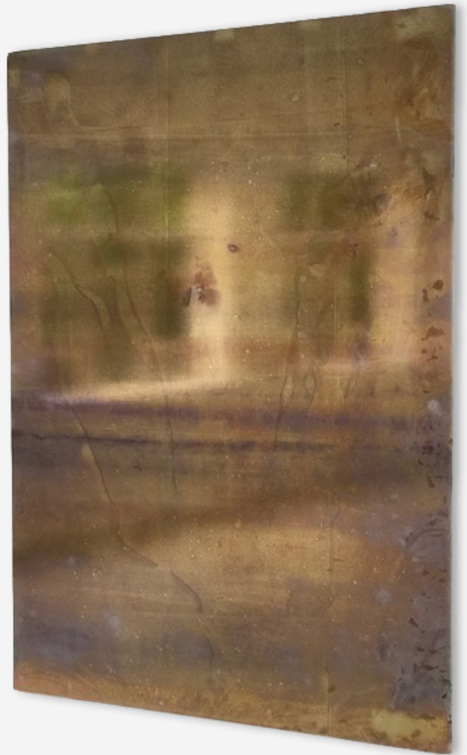
Snap shot to show reflective surface of the work