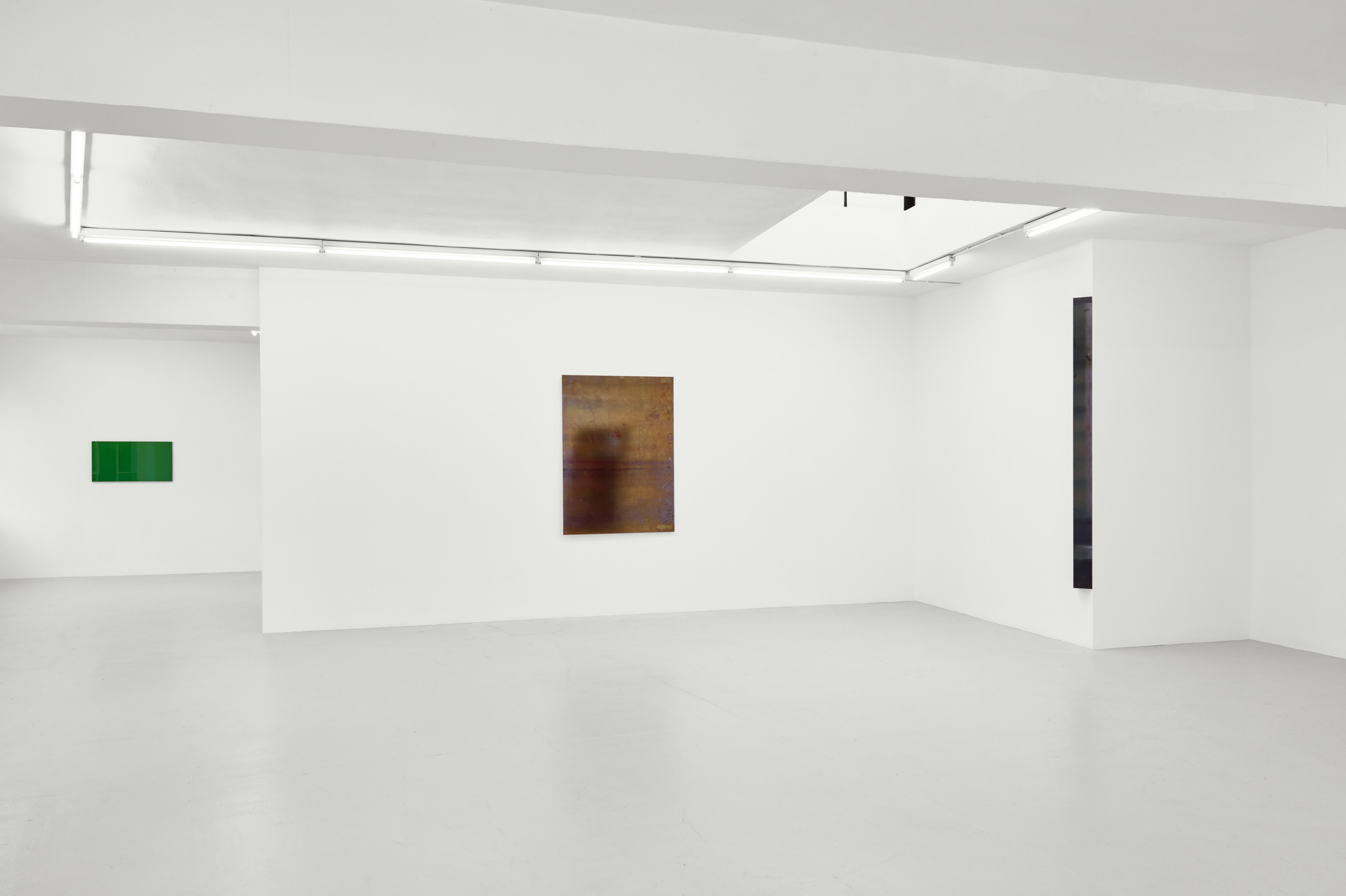
Liz Deschenes / Keystone (Solo Exhibition) 29 September - 17 November 2019 at Campoli Presti, London