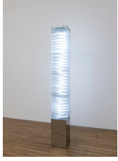
Laura Grisi Spiral Light , 1968 Neon, Plexiglas, steel 232 x 30 x 30 cm 91 5/16 x 11 13/16 x 11 13/16 in. (AP-GRISL-00004)