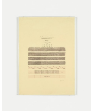
Laura Grisi Le dimensioni immaginarie , 1977 Ink and photo collage on paper 7 parts: 70 x 50 cm 27 9/16 x 19 11/16 in. (AP-GRISL-00001)