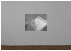
Laura Grisi Wind Speed 40 Knots , 1968 b-w digital video from 16mm film, 4'45'' (AP-GRISL-00008)