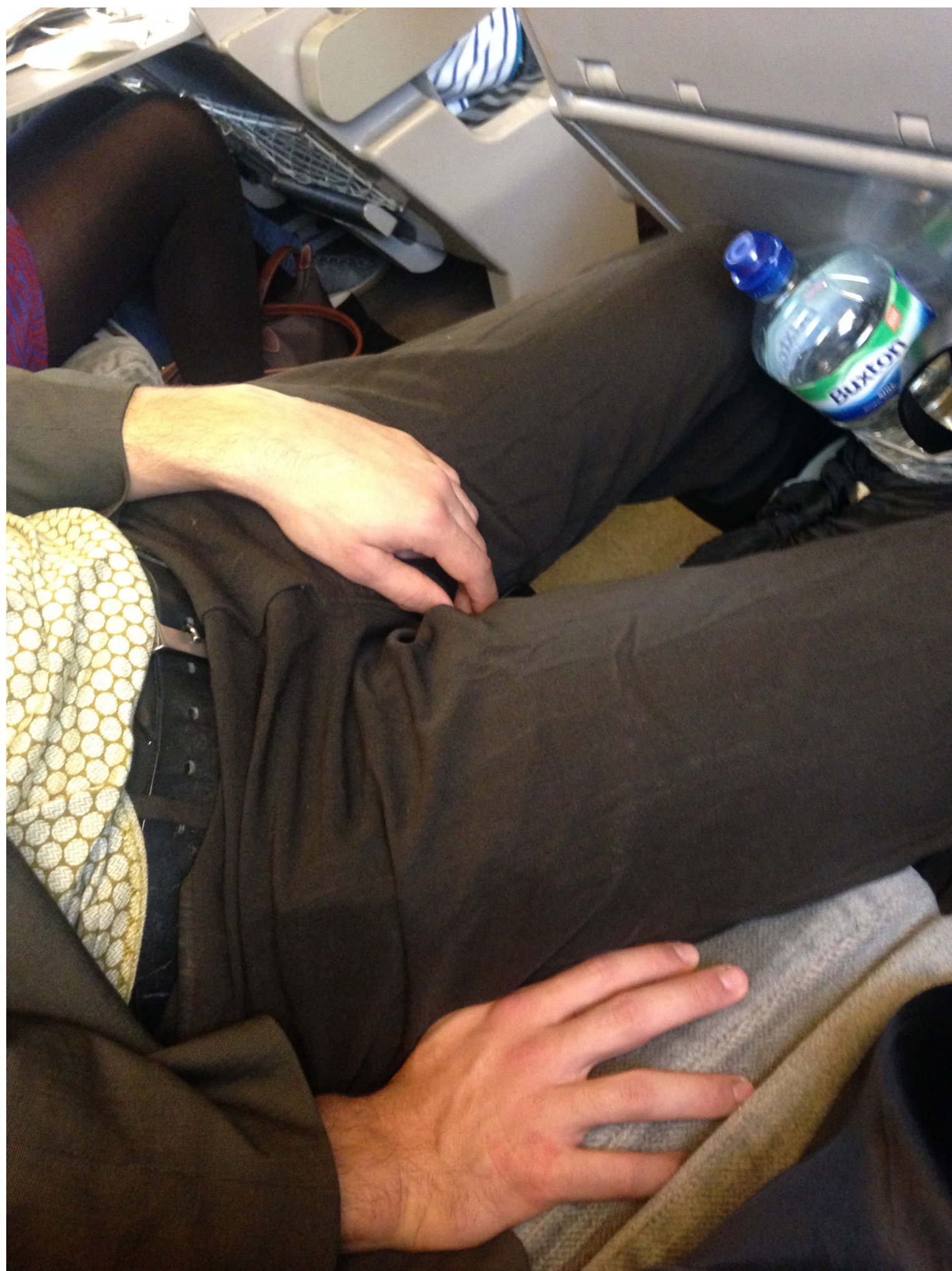
Catalogue Image, 2020