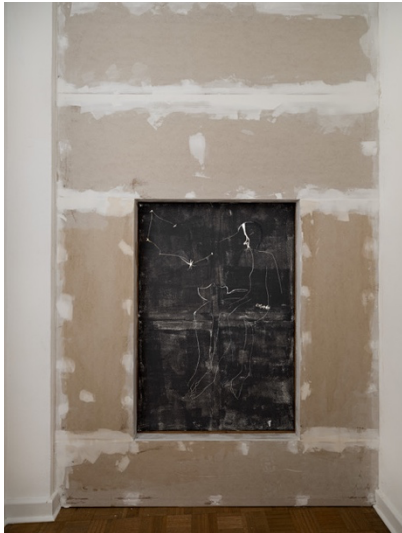
Tolia Astakhishvili, Moonlight accordion player and lies, night side , 2014 Acrylic on canvas, plasterboard, plaster, instant coffee, oil, dirt, acryl 150 x 105 cm Installation view, I think it's closed , Kunstverein Bielefeld 2023