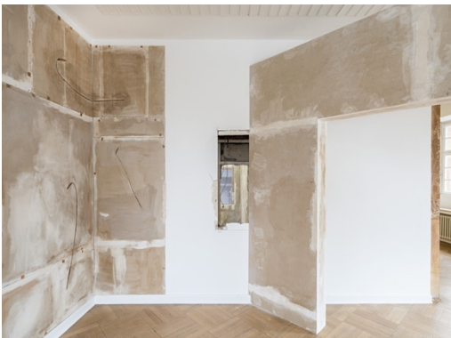
Tolia Astakhishvili, Narrow shelter , 2023 Plasterboard, plaster, instant coffee, oil, dirt, acrylic, ballpoint pen, pencil, paper, wire, string 3 m x 6,28 m x 22,5 cm The main entrance , 2022-23 Plasterboard, plaster, instant coffee, oil, machine oil, dirt, wheat stalks 3,16 m x 3,46 m x 1,2 cm Installation view, I think it's closed , Kunstverein Bielefeld 2023