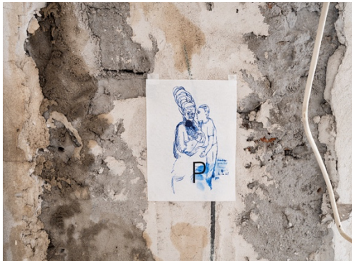
Tolia Astakhishvili, Gossip niche , 2023 Ink on paper 22 x 15,5 cm Detail, Gossip niche , 2023, I think it's closed , Kunstverein Bielefeld 2023