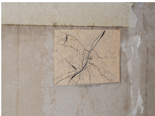
Tolia Astakhishvili, Narrow shelter , 2023 Plasterboard, plaster, instant coffee, oil, dirt, acrylic, ballpoint pen, pencil, paper, wire, string 3 m x 6,28 m x 22,5 cm Detail, Narrow shelter , 2023, I think it's closed , Kunstverein Bielefeld 2023