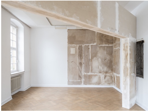
Tolia Astakhishvili, Narrow shelter , 2023 Plasterboard, plaster, instant coffee, oil, dirt, acrylic, ballpoint pen, pencil, paper, wire, string 3 m x 6,28 m x 22,5 cm The main entrance , 2022-23 Plasterboard, plaster, instant coffee, oil, machine oil, dirt, wheat stalks 3,16 m x 3,46 m x 1,2 cm Installation view, I think it's closed , Kunstverein Bielefeld 2023