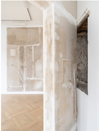
Tolia Astakhishvili, Narrow shelter , 2023 Plasterboard, plaster, instant coffee, oil, dirt, acrylic, ballpoint pen, pencil, paper, wire, string 3 m x 6,28 m x 22,5 cm The main entrance , 2022-23 Plasterboard, plaster, instant coffee, oil, machine oil, dirt, wheat stalks 3,16 m x 3,46 m x 1,2 cm Installation view, I think it's closed , Kunstverein Bielefeld 2023