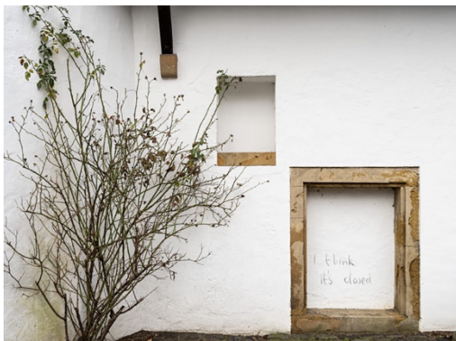
Tolia Astakhishvili Installation view, I think it's closed , Kunstverein Bielefeld 2023