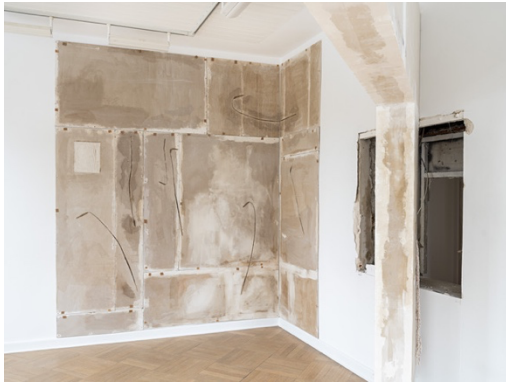
Tolia Astakhishvili, Narrow shelter , 2023 Plasterboard, plaster, instant coffee, oil, dirt, acrylic, ballpoint pen, pencil, paper, wire, string 3 m x 6,28 m x 22,5 cm The main entrance , 2022-23 Plasterboard, plaster, instant coffee, oil, machine oil, dirt, wheat stalks 3,16 m x 3,46 m x 1,2 cm Installation view, I think it's closed , Kunstverein Bielefeld 2023