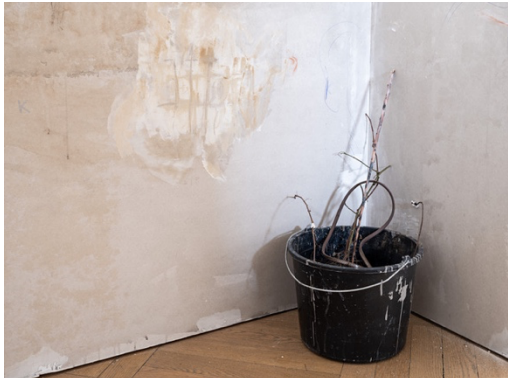
Tolia Astakhishvili, Simple judgments and polite answers , 2023 Plasterboard, plaster, instant coffee, oil, dirt, acrylic, ballpoint pen, pencil, paper, plastic bucket, dry plants 3 m x 1,81 m x 2,5 m Installation view, I think it's closed , Kunstverein Bielefeld 2023