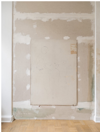
Tolia Astakhishvili, Moonlight accordion player and lies, day side , 2014 Acrylic on canvas, plasterboard, plaster, instant coffee, oil, dirt, acryl 150 x 105 cm Installation view, I think it's closed , Kunstverein Bielefeld 2023