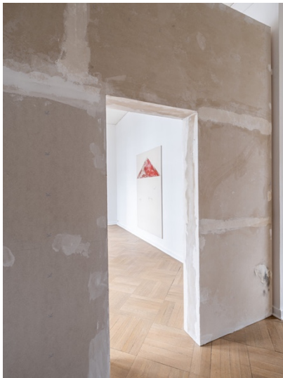
Tolia Astakhishvili, W = w , 2023 Plasterboard, plaster, instant coffee, oil, dirt 3 m x 2,85 m x 22,5 cm W = w = red = shelter , 2015 Oil on canvas, metal wire, needles, thread 190 x 140 cm Installation view, I think it's closed , Kunstverein Bielefeld 2023