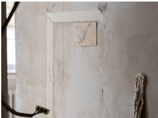
Tolia Astakhishvili, Narrow shelter , 2023 Plasterboard, plaster, instant coffee, oil, dirt, acrylic, ballpoint pen, pencil, paper, wire, string 3 m x 6,28 m x 22,5 cm Detail, Narrow shelter , 2023, I think it's closed , Kunstverein Bielefeld 2023