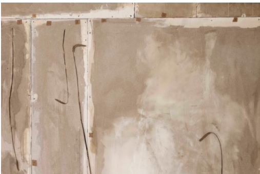
Tolia Astakhishvili The main entrance , 2022-23 Plasterboard, plaster, instant coffee, oil, machine oil, dirt, wheat stalks 3,16 m x 3,46 m x 1,2 cm Detail, The main entrance , 2022-23, I think it's closed , Kunstverein Bielefeld 2023