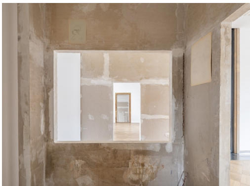
Tolia Astakhishvili, Simple judgments and polite answers , 2023 Plasterboard, plaster, instant coffee, oil, dirt, acrylic, ballpoint pen, pencil, paper, plastic bucket, dry plants 3 m x 1,81 m x 2,5 m Installation view, I think it's closed , Kunstverein Bielefeld 2023