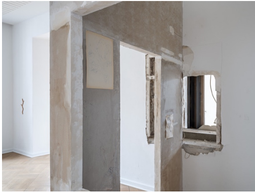
Tolia Astakhishvili, Simple judgments and polite answers , 2023 Plasterboard, plaster, instant coffee, oil, dirt, acrylic, ballpoint pen, pencil, paper, plastic bucket, dry plants 3 m x 1,81 m x 2,5 m Detail, Simple judgments and polite answers , 2023, I think it's closed , Kunstverein Bielefeld 2023