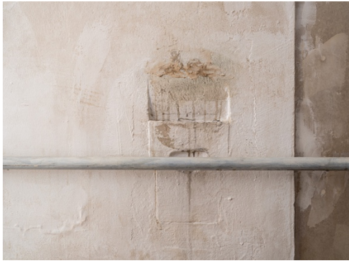
Tolia Astakhishvili, A warm water 1 , 2023 Pipe, acryl, papier mâché, instant coffee, plasterboard, safety pin, machine oil 3,30 m x 67 cm x 1,67 m Detail, A warm water 1 , 2023, I think it's closed , Kunstverein Bielefeld 2023