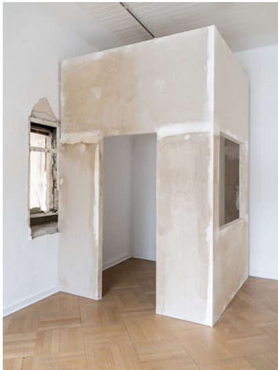
Tolia Astakhishvili, Simple judgments and polite answers , 2023 Plasterboard, plaster, instant coffee, oil, dirt, acrylic, ballpoint pen, pencil, paper, plastic bucket, dry plants 3 m x 1,81 m x 2,5 m Installation view, I think it's closed , Kunstverein Bielefeld 2023