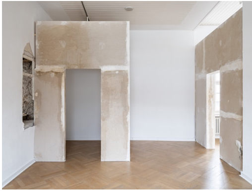
Tolia Astakhishvili, Simple judgments and polite answers , 2023 Plasterboard, plaster, instant coffee, oil, dirt, acrylic, ballpoint pen, pencil, paper, plastic bucket, dry plants 3 m x 1,81 m x 2,5 m W = w , 2023 Plasterboard, plaster, instant coffee, oil, dirt 3 m x 2,85 m x 22,5 cm Installation view, I think it's closed , Kunstverein Bielefeld 2023