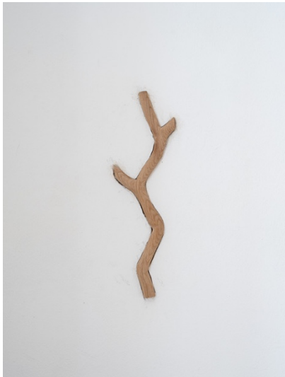
Tolia Astakhishvili, Slow stick , 2023 Ulm wood from a beam of a dismantled house 40 cm x 12,5 cm x 2 cm Detail, Slow stick , 2023, I think it's closed , Kunstverein Bielefeld 2023