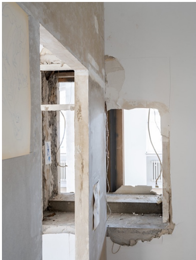
Tolia Astakhishvili, Simple judgments and polite answers , 2023 Plasterboard, plaster, instant coffee, oil, dirt, acrylic, ballpoint pen, pencil, paper, plastic bucket, dry plants 3 m x 1,81 m x 2,5 m Detail, I think it's closed , Kunstverein Bielefeld 2023