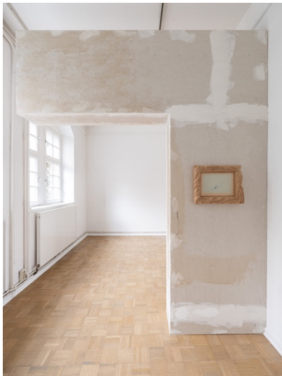
Tolia Astakhishvili, The endless house , 2023 Plasterboard, plaster, instant coffee, oil, dirt 3 m x 2,42 m x 32,5 cm Entry , 2021-23 Paper, ink, Ulm wood from a beam of a dismantled house, museum glass 37 x 46 x 6,5 cm Installation view, I think it's closed , Kunstverein Bielefeld 2023