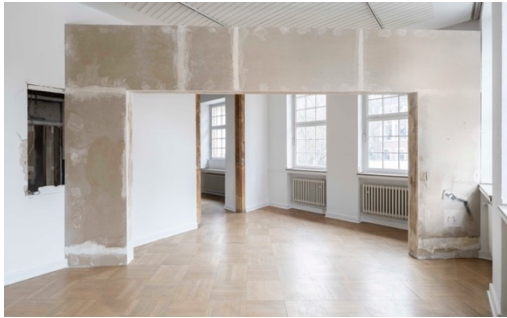
Tolia Astakhishvili, Narrow shelter , 2023 Plasterboard, plaster, instant coffee, oil, dirt, acrylic, ballpoint pen, pencil, paper, wire, string 3 m x 6,28 m x 22,5 cm Installation view, I think it's closed , Kunstverein Bielefeld 2023