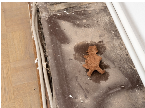
Tolia Astakhishvili, Plätzchen , 2023 Modeling clay 10 x 6,5 x 1,20 cm Detail, Plätzchen , 2023, I think it's closed , Kunstverein Bielefeld 2023