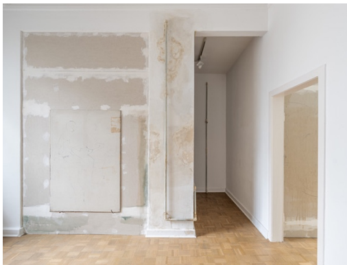
Tolia Astakhishvili, Moonlight accordion player and lies, day side , 2014 Acrylic on canvas, plasterboard, plaster, instant coffee, oil, dirt, acryl 150 x 105 cm A warm water 1 , 2023 Pipe, acryl, papier mâché, instant coffee, plasterboard, safety pin, machine oil 3,30 m x 67 cm x 1,67 m A warm water 2 , 2023 Pipe, acrylic 2,87 m x 5 cm x 10 cm Installation view, I think it's closed , Kunstverein Bielefeld 2023