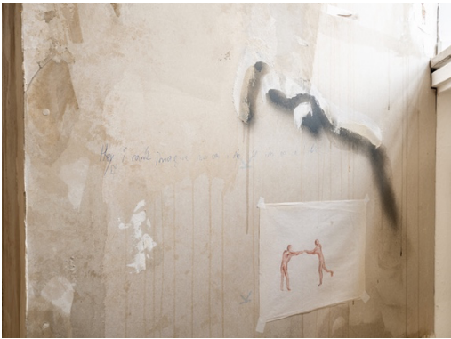
Tolia Astakhishvili, Narrow shelter , 2023 Plasterboard, plaster, instant coffee, oil, dirt, acrylic, ballpoint pen, pencil, paper, wire, string 3 m x 6,28 m x 22,5 cm Detail, Narrow shelter , 2023, I think it's closed , Kunstverein Bielefeld 2023