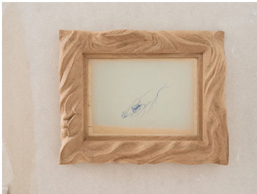
Entry , 2021-23 Paper, ink, Ulm wood from a beam of a dismantled house, museum glass 37 x 46 x 6,5 cm Detail, Entry , 2021-23, I think it's closed , Kunstverein Bielefeld 2023