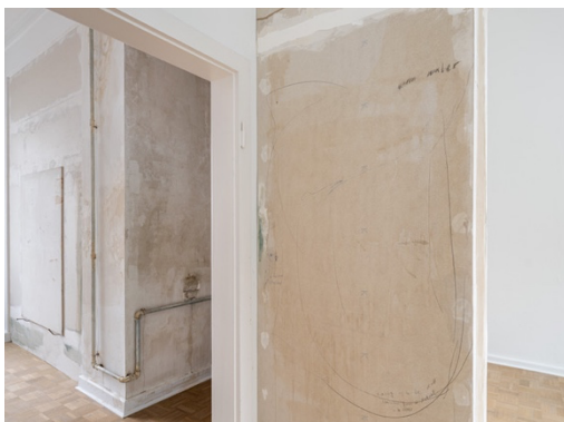
Tolia Astakhishvili, The endless house , 2023 Plasterboard, plaster, instant coffee, oil, dirt 3 m x 2,42 m x 32,5 cm A warm water 1 , 2023 Pipe, acryl, papier mâché, instant coffee, plasterboard, safety pin, machine oil 3,30 m x 67 cm x 1,67 m Detail, The endless house , 2023, A warm water 1 , 2023, I think it's closed , Kunstverein Bielefeld 2023