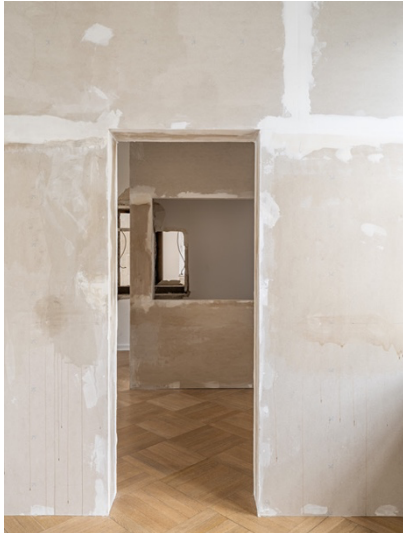
Tolia Astakhishvili, W = w , 2023 Plasterboard, plaster, instant coffee, oil, dirt 3 m x 2,85 m x 22,5 cm Installation view, I think it's closed , Kunstverein Bielefeld 2023