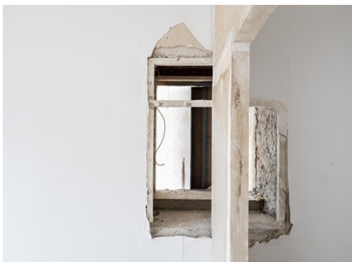
Tolia Astakhishvili, Simple judgments and polite answers , 2023 Plasterboard, plaster, instant coffee, oil, dirt, acrylic, ballpoint pen, pencil, paper, plastic bucket, dry plants 3 m x 1,81 m x 2,5 m Detail, Simple judgments and polite answers , 2023, I think it's closed , Kunstverein Bielefeld 2023