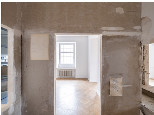
Tolia Astakhishvili, Simple judgments and polite answers , 2023 Plasterboard, plaster, instant coffee, oil, dirt, acrylic, ballpoint pen, pencil, paper, plastic bucket, dry plants 3 m x 1,81 m x 2,5 m Detail, Simple judgments and polite answers , 2023, I think it's closed , Kunstverein Bielefeld 2023