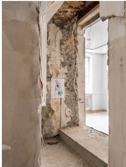
Tolia Astakhishvili, Gossip niche , 2023 Ink on paper 22 x 15,5 cm Installation view, I think it's closed , Kunstverein Bielefeld 2023