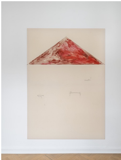
Tolia Astakhishvili, W = w = red = shelter , 2015 Oil on canvas, metal wire, needles, thread 190 x 140 cm Installation view, I think it's closed , Kunstverein Bielefeld 2023