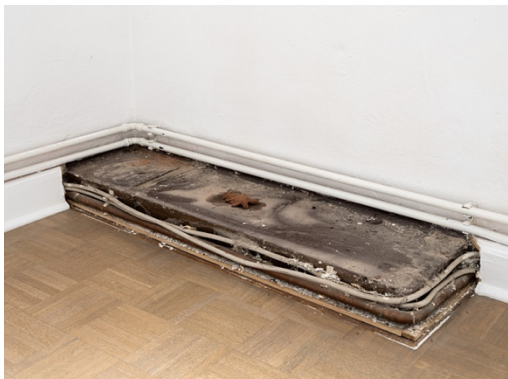
Tolia Astakhishvili, Plätzchen , 2023 Modeling clay 10 x 6,5 x 1,20 cm Installation view, I think it's closed , Kunstverein Bielefeld 2023