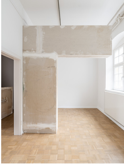
Tolia Astakhishvili, The endless house , 2023 Plasterboard, plaster, instant coffee, oil, dirt 3 m x 2,42 m x 32,5 cm Installation view, I think it's closed , Kunstverein Bielefeld 2023