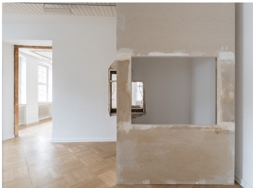
Tolia Astakhishvili, Simple judgments and polite answers , 2023 Plasterboard, plaster, instant coffee, oil, dirt, acrylic, ballpoint pen, pencil, paper, plastic bucket, dry plants 3 m x 1,81 m x 2,5 m Installation view, I think it's closed , Kunstverein Bielefeld 2023