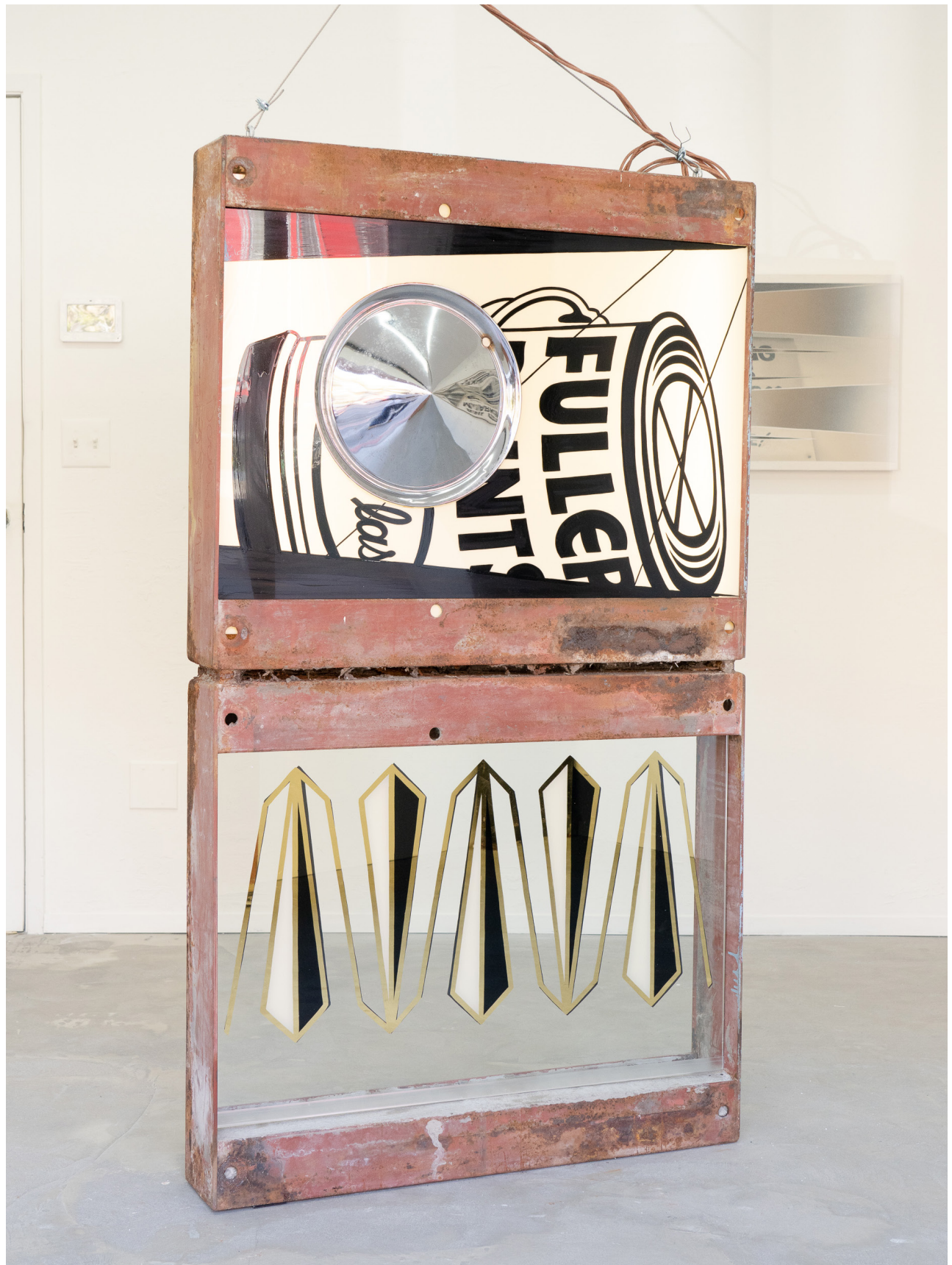
They Last, 2023

enamel, glass, gold leaf, steel, chrome, and found material 35 x 61 x 6 inches (88.9 x 154.94 x 15.24 cm)