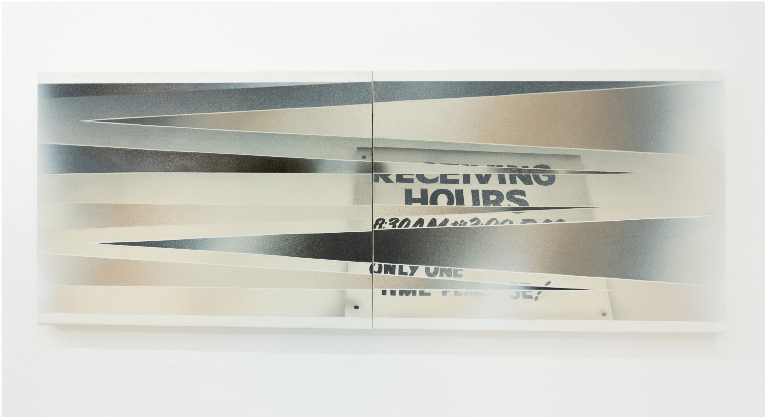
Receiving Hours (scalloped), 2023

acrylic on canvas 18 x 48 inches (45.72 x 121.92 cm)