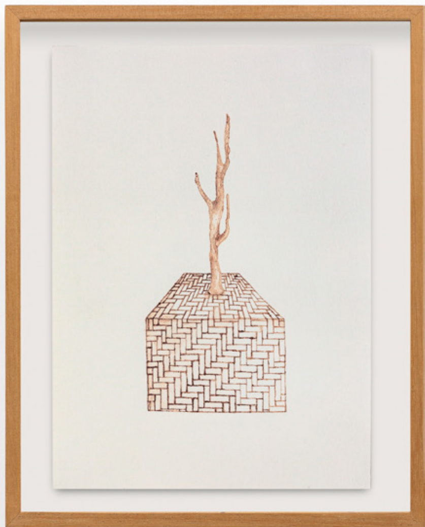
Untitled, 2009 brick dust and PVA glue on paper 32 x 24 cm 12.6 x 9.4 in