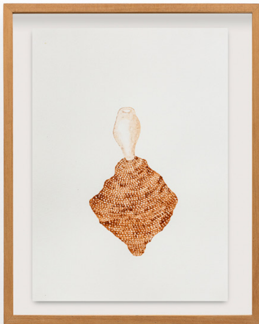
Untitled, 2009 brick dust and PVA glue on paper 32 x 24 cm 12.6 x 9.4 in