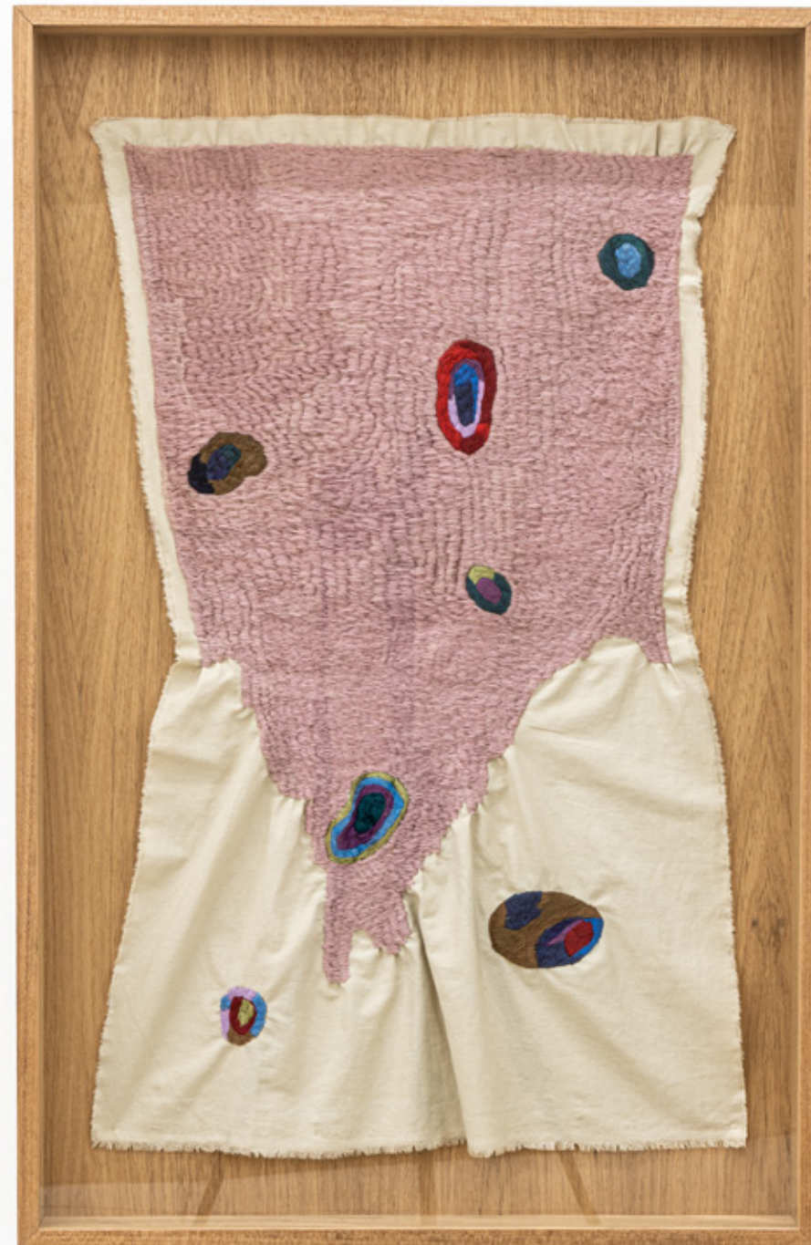
Os hematomas , 2016 embroidery on fabric 75 x 46 cm 29.5 x 18.1 in

An example of how an external action may affect the skin, is a hematoma, which constitutes the focus of this body of work. In order to illustrate this in the form of embroidery, the artist sews them onto strips of fabric on a human scale, embroidering fields of intense color or pronounced textures and thicknesses, which contrast with the rest of the surface. Later, she explored the idea through sculptures, dyeing body parts in different colors, evoking both different tactile sensations and the coexistence of two chromatic fields within a single body.