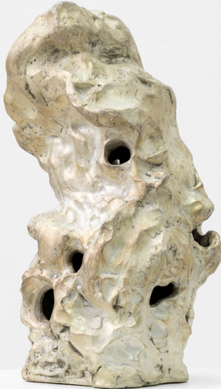
Segredos do mar , 2021 bronze with silver bath 74 x 42 cm | 29.1 x 16.5 in