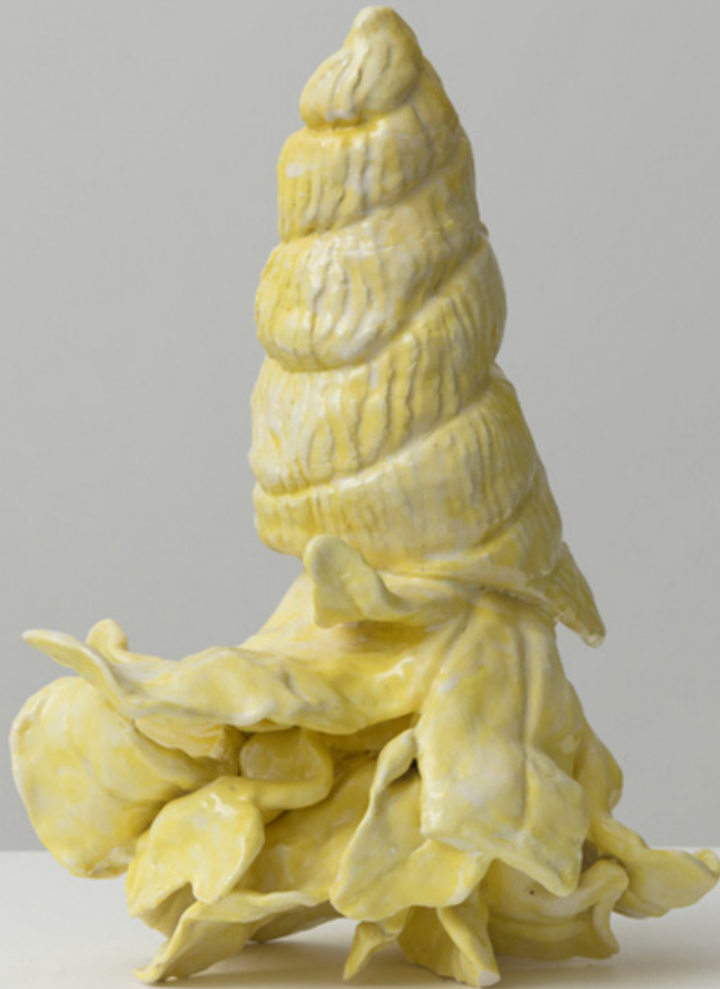
Sob o sol , 2017 enameled ceramics 27 x 18 x 20 cm 10.6 x 7.1 x 7.9 in