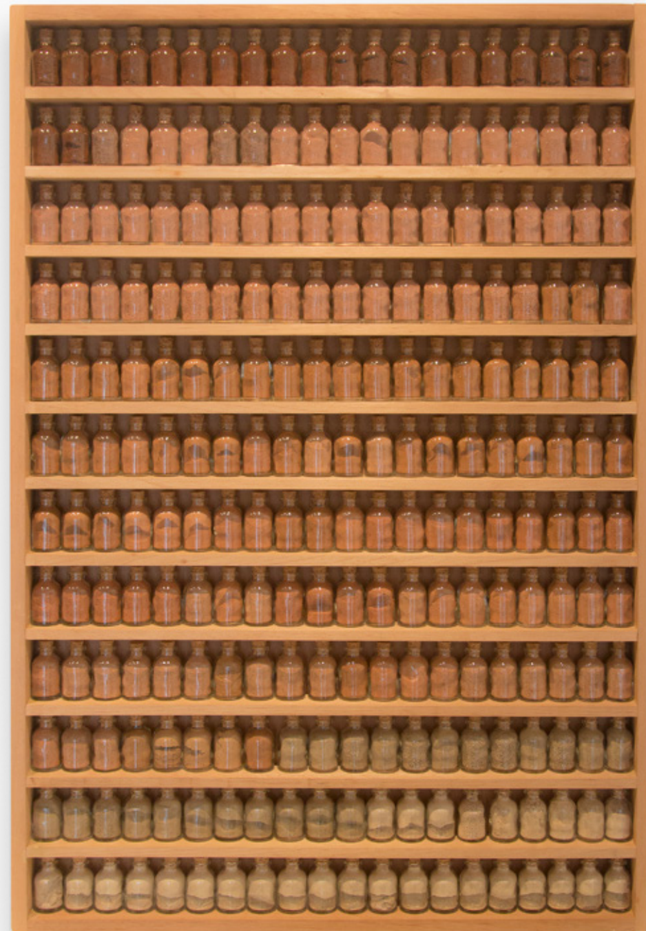
Home [Casa], 1997/2013 240 glass bottles filled with brick dust on wood box 120 x 68 x 7 cm 47.2 x 26.8 x 2.8 in

‘When I employ the brick’s dust in my work, it’s like a process of deconstruction. I like the idea of transforming the rigid matter of a brick into something so malleable that it could be taken as something else and also go anywhere. A mobile house, able to travel around’.*