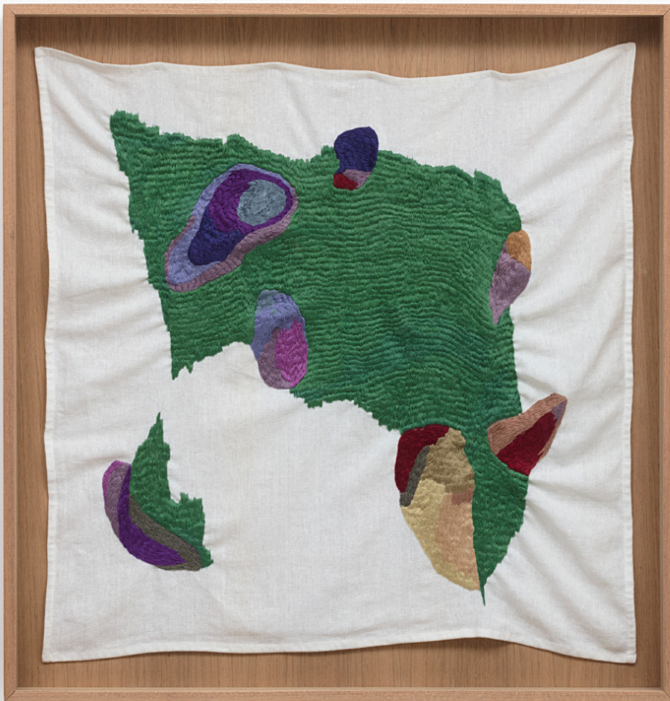
Os hematomas da planta , 2016 embroidery on fabric 73,5 x 77,5 x 7,5 cm 28.9 x 30.5 x 3 in