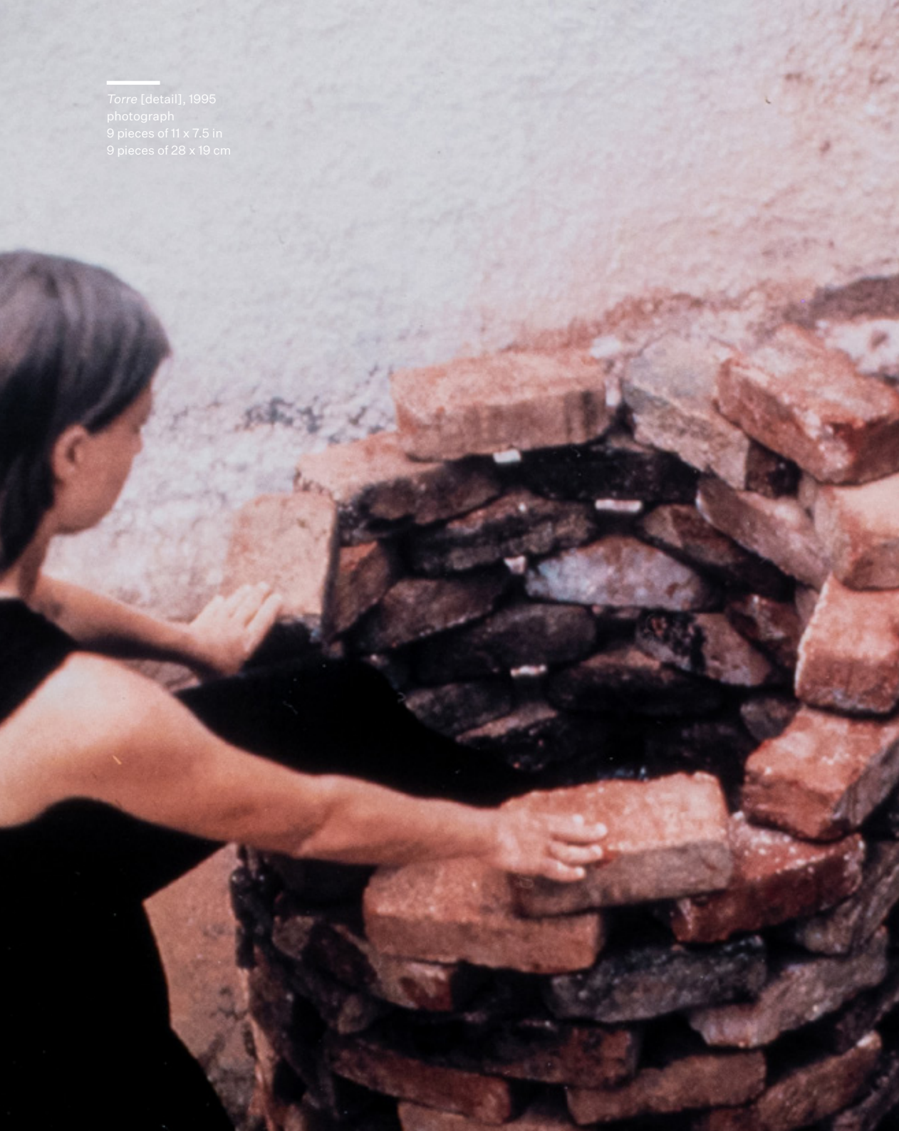
Torre [detail], 1995 photograph 9 pieces of 11 x 7.5 in 9 pieces of 28 x 19 cm

‘When Guy Brett says that connections can be made between my work and that of Clark and Oiticica, it goes like this: (...) ‘Such connections refer especially to the notions of dwelling and habitation... Each of them [the projects], metaphorized a different experience of being in the world, alone or in the company of others, as a constructive core of sensory pleasure, contemplation, and creativity, proposing a kind of mythical place for feelings, for action, for creating things and building one's own inner cosmos.’ For me, this description fits well with the Tower Project, which I created in 1996. While using the bricks of the house, I built a space to exist in. A space of recollection, of renunciation, of reflection, a kind of laboratory for the self. The tower-space , is also a temple, an alley, and a cave, on top of the mountain, or in the middle of the desert. A space to create and to make things happen’.*