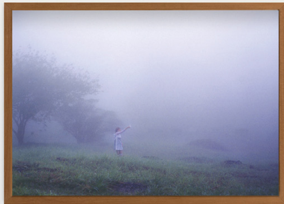
A coleta da neblina [Mist Collecting], 1996 action photographic record 40 x 60 cm | 15.7 x 23.6 in