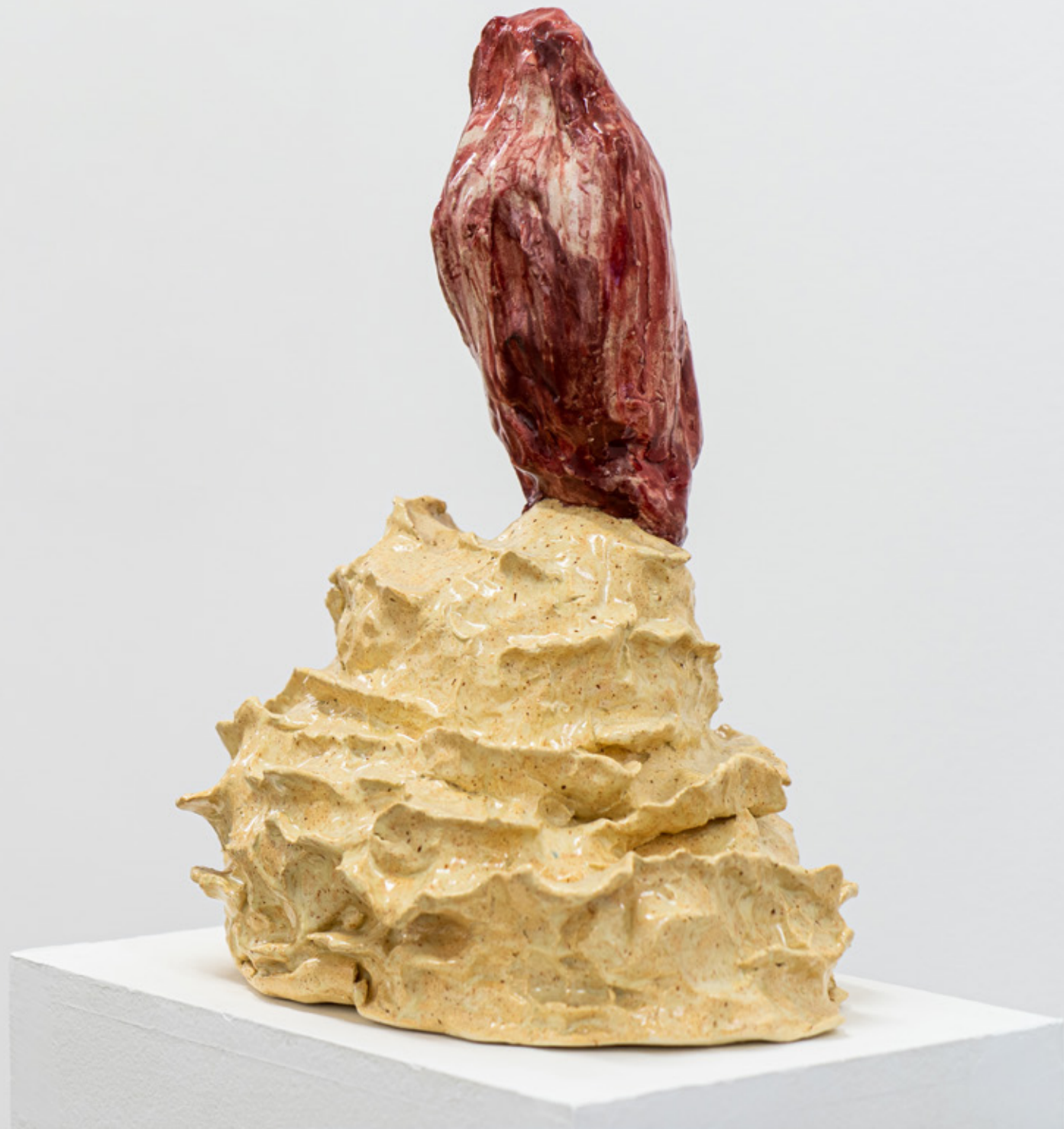
A Carne do Mar I , 2018 enamelled ceramic 34 x 25 x 28 cm 13.4 x 9.8 x 11 in