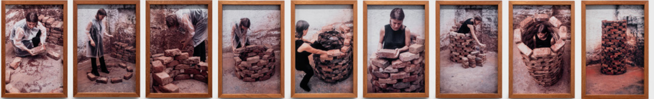
Torre , 1995 photograph 9 pieces of 11 x 7.5 in 9 pieces of 28 x 19 cm