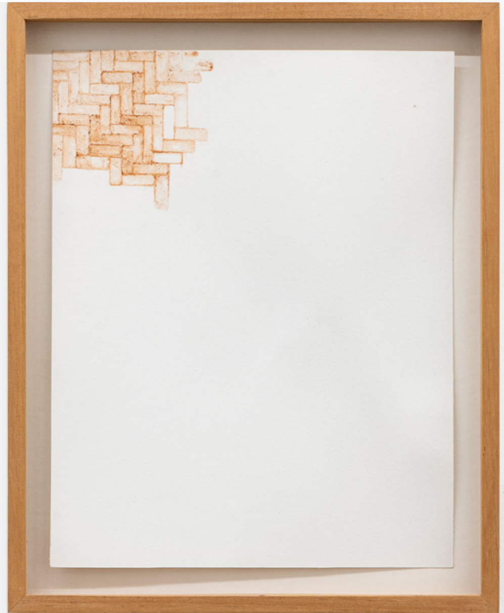
Untitled, 2009 brick dust and PVA glue on paper 30 x 23 cm | 11.8 x 9.1 in

'I put myself very freely in relation to the different mediums. At times, photography, as well as film or an image in general is not enough for me, and it's time to dive into the material, into a certain need to work with my hands, to produce objects and to draw. The drawings also form images, and even when abstract, they are impregnated with texture of graphite, the grains of wax pencil, the flaws, the washes of the nankin". Such is the drive, the work goes on opening its paths, even opposing ones at times, and somewhere there will be an encounter, an intertwinement'.*