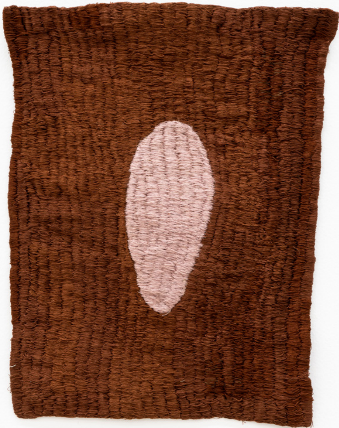
Minha pele sua pele , 2017 embroidery on fabric 40 x 40 cm 15.7 x 15.7 in