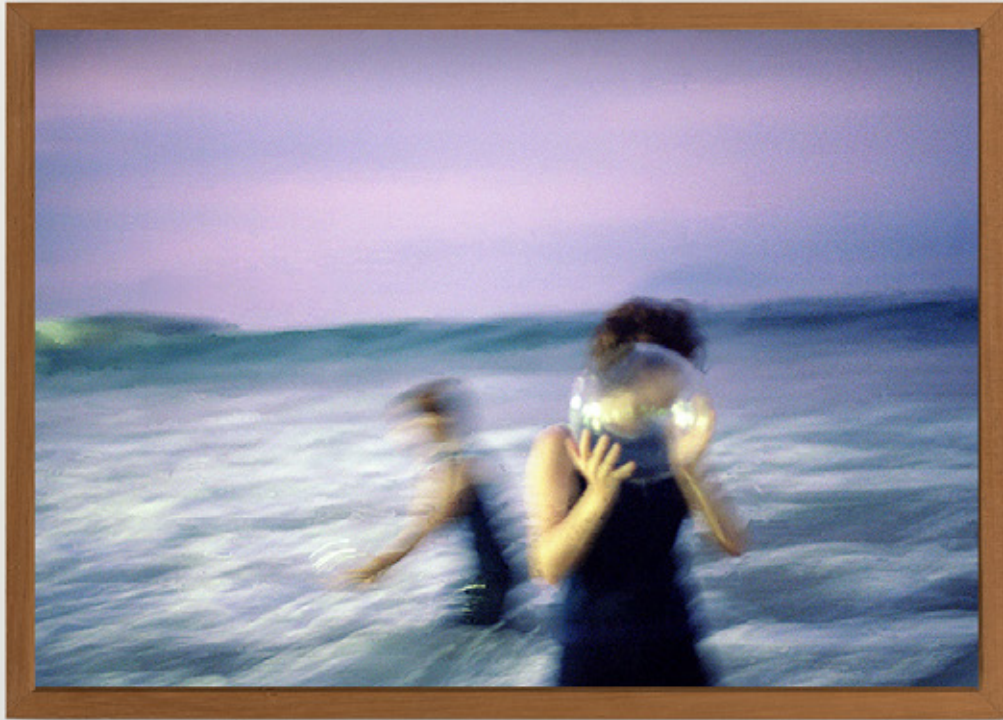
A coleta da maresia , 2002 photography edition of 5 100 x 150 cm | 39.4 x 59.1 in