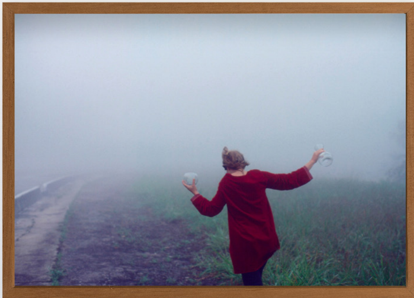
A coleta da neblina [Mist Collecting] , 1996 action photographic record 40 x 60 cm | 15.7 x 23.6 in