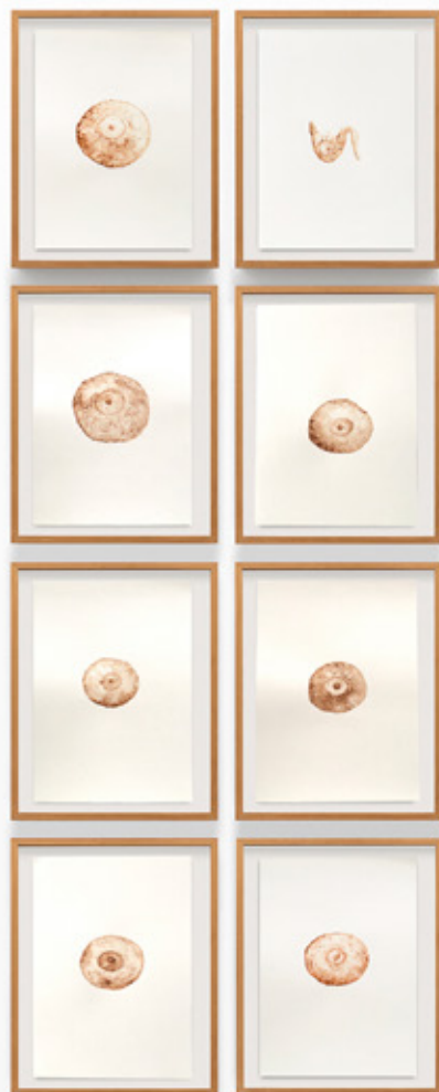
each work Untitled , 2020 brick powder and white glue 29 x 21 cm 11.4 x 8.3 in