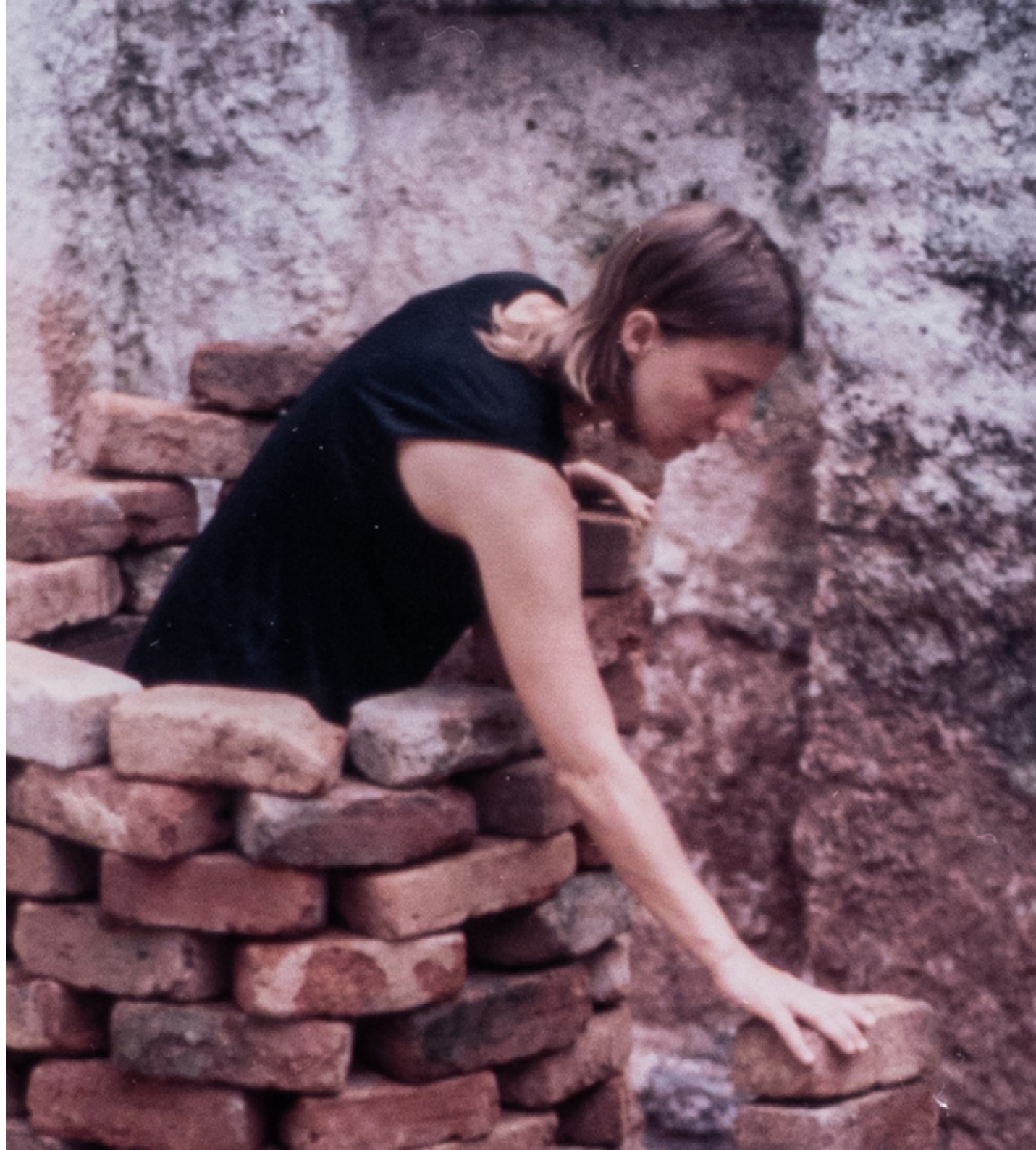
Torre [detail], 1995 photograph 9 pieces of 11 x 7.5 in 9 pieces of 28 x 19 cm

From the mid-1990s, Brígida Baltar turned to her own house as a source of inspiration, finding in it the thematic and materials to develop a body of work that she would continue working with for decades to come. From her home, the artist experienced and developed ideas around the house's structure, its relationship with the body, inhabitation, and intimacy, engaging with and employing the building's physical elements to materialize her propositions.