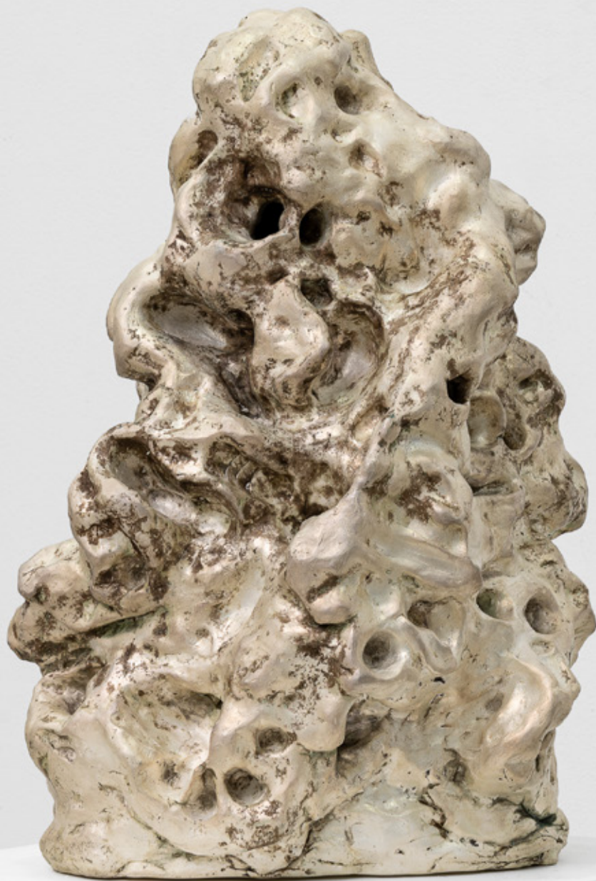
Segredos do mar , 2021 bronze with silver bath 55 x 35 cm | 21.7 x 13.8 in