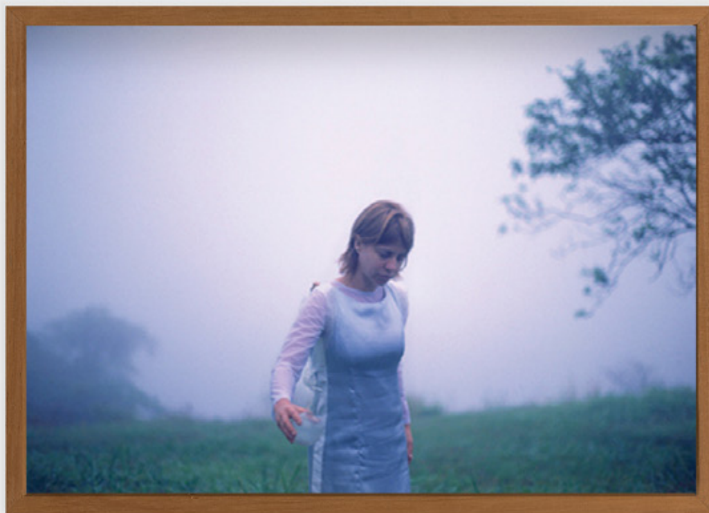
A coleta da neblina [Mist Collecting], 1996 action photographic record 40 x 60 cm | 15.7 x 23.6 in