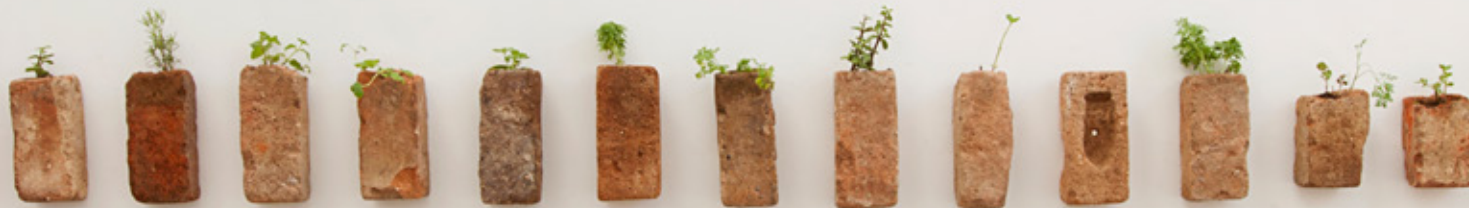
A horta da casa , 1996 spices and herbs planted on 13 bricks variable dimensions

In works such as Horta da Casa , from 1996, the artist planted herbs and spices into bricks. Following this process, Brígida Baltar began to investigate concepts of disappearance, or dematerialization by challenging the concept of owning a home as a fixed, stable, localized matter.