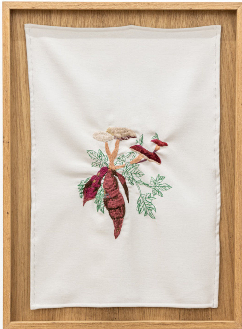
A quimera das plantas [os cogumelos e a batata-doce], 2016 embroidery on fabric 60 x 41 cm 23.6 x 16.1 in

In the mid-2010s the body, always present in Baltar's work, gains a different treatment in response to her lived experiences. The resulting works include a set of embroidery pieces of bruises, blemishes, stray hairs, and sores. In this context, the chimerism of plants germinated in bronze sculptures and embroidery pieces of composite species pick up on the hybridity apparent in previous works. Although they refer to the body, the works reveal delicate textile abstractions and are sewn in very fine lines.