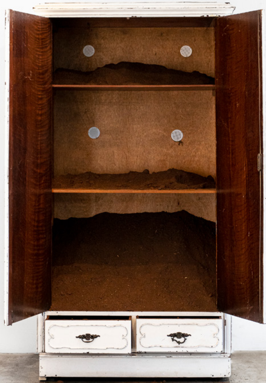
Feminino , 1994/2021 closet and earth edition of 3 190 x 90 x 70 cm 74.8 x 35.4 x 27.6 in

'I performed intimate actions in the house I lived in, using materials like bricks, mortar, or paint peels, during the 1990s. I opened holes in the wall and stored drips in glass jars. The house became a laboratory for my work that was being formed through reflections on the body, memory, and identity constructions. At this moment, I started to extend such experiences into nature, incorporating its own architecture. Thus, I moved furniture to the gardens and hung large pieces of raw cotton from a tree, a work I called Skin . I placed a used dresser directly on the earth and put soil all over it, inside, between drawers and crevices. There it remained for a while and was photographed. For me, it became a fertile place, a place to house seeds. I saw the earth as an element that had always been related to its primitive qualities and feminine polarities.'