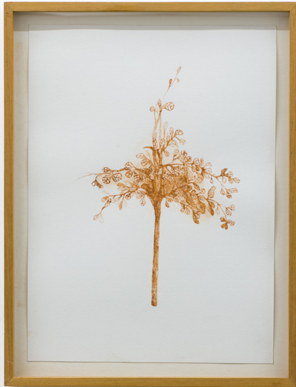
Small almond tree, 2009 brick dust and PVA glue on paper 38 x 27,5 cm 15 x 10.8 in

Baltar eventually left her original house in 2005, taking bricks and brick dust with her, which she continued to use in her works for years to follow. Using the dust from the bricks, she created drawings of vegetables, plants, landscapes and parts of the female body.