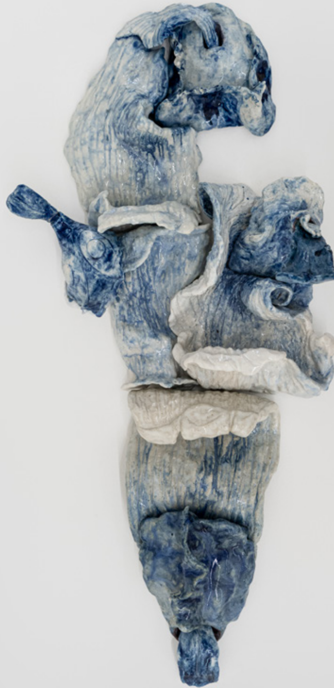
As lambidas do mar , 2017 glazed ceramic 19 x 33 x 74 cm 7.5 x 13 x 29.1 in

'In thinking about the sea, and about the word chimera, I discovered that in the depths of the sea all beings are hybrid.'