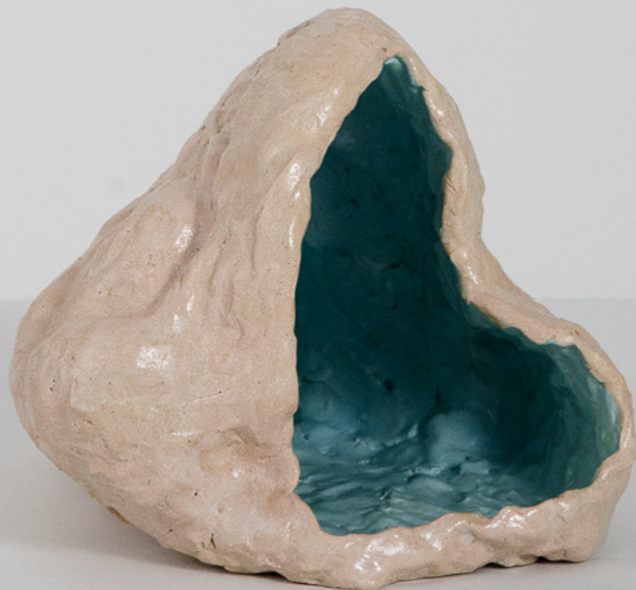
O berro da concha , 2017 glazed ceramic 22 x 25 x 30 cm 8.7 x 9.8 x 11.8 in