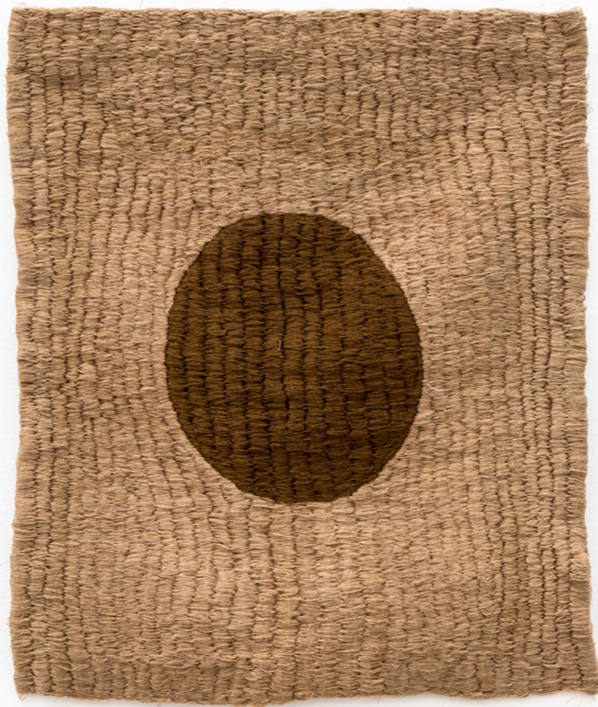
Minha pele sua pele , 2017 embroidery on fabric 40 x 40 cm 15.7 x 15.7 in