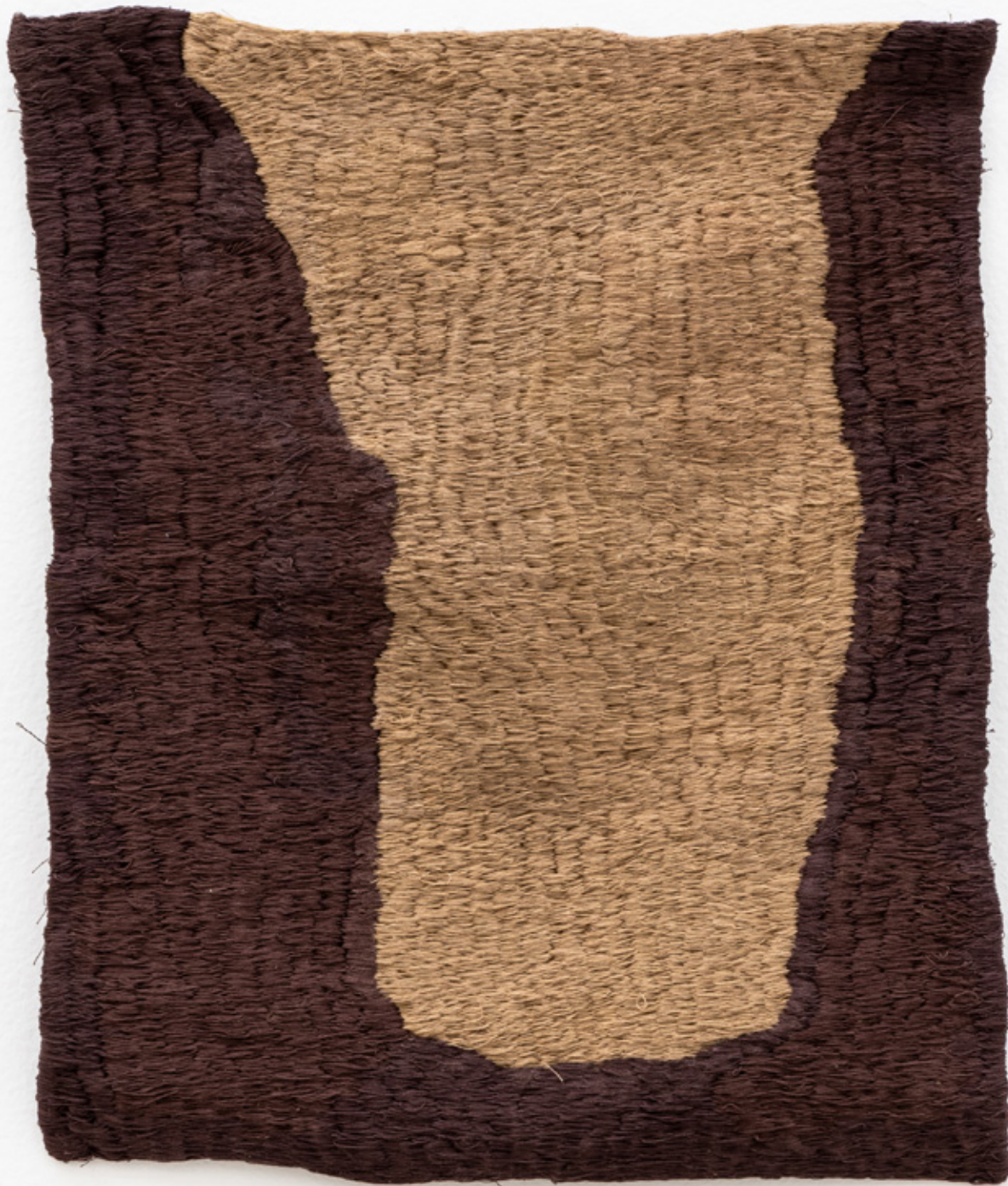
Minha pele sua pele , 2017 embroidery on fabric 40 x 40 cm 15.7 x 15.7 in