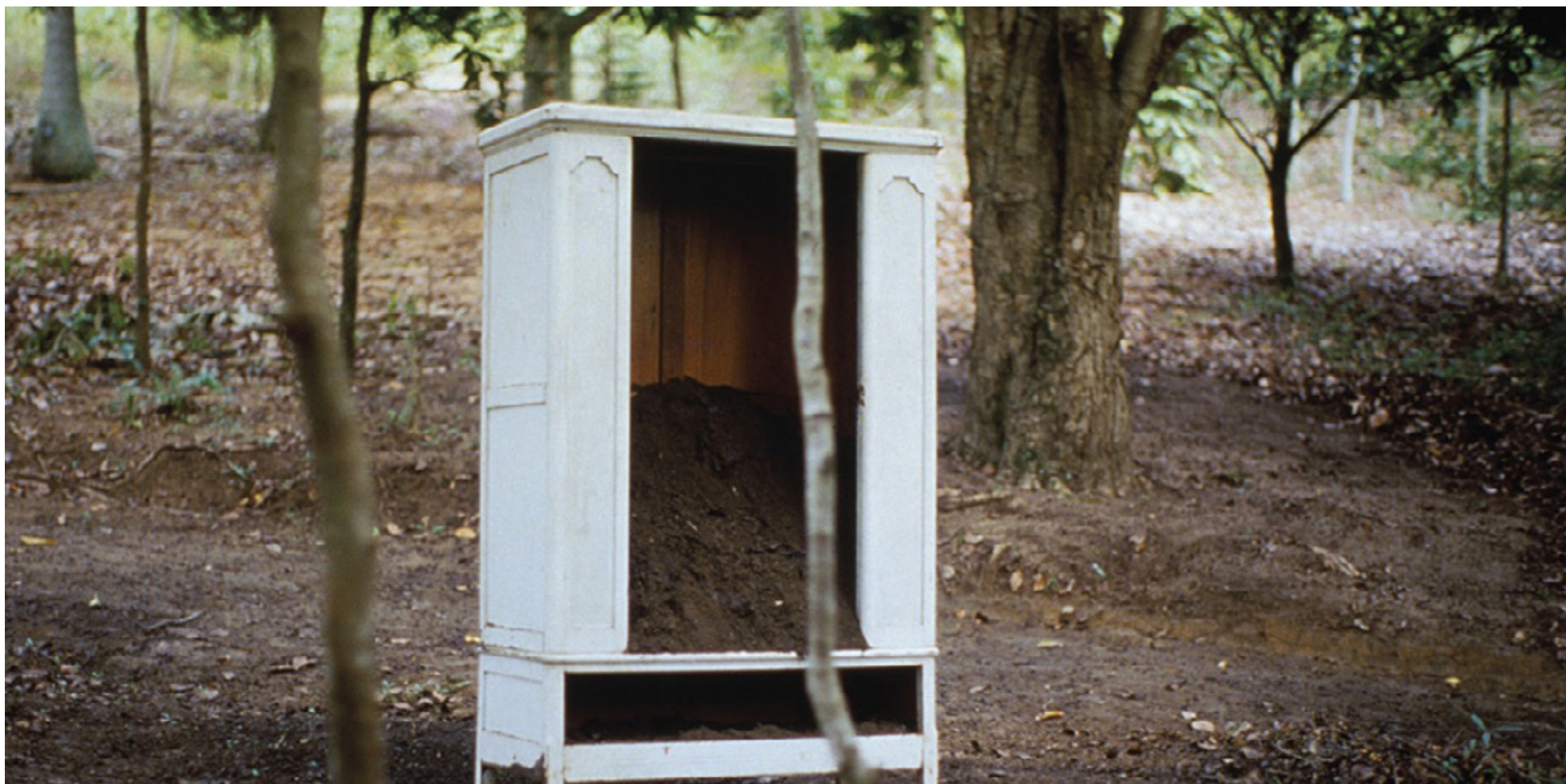
Brígida Baltar Feminino , 1994 closet and earth 190 x 90 x 70 cm 74.8 x 35.4 x 27.6 in