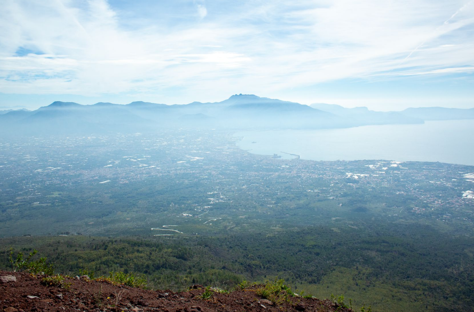
View of Pompeii and neighboring towns from Mount Vesuvius