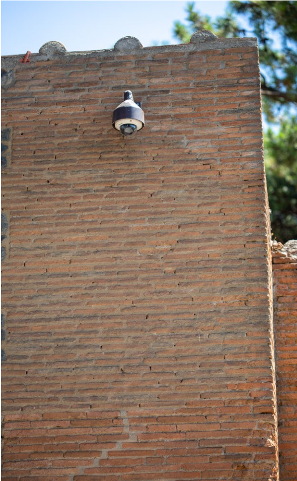
Surveillance camera outside the Palestra Grande in Pompeii