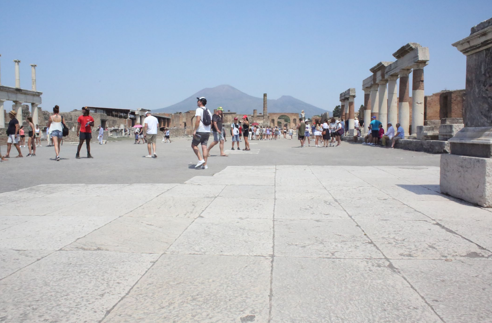
Mount Vesuvius from Pompeii