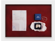
Image © Rose Salane 2023, courtesy the artist and Carlos/Ishikawa. Photographer: Damian Griffiths.