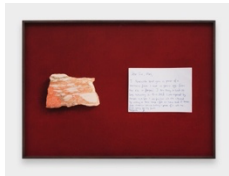
Image © Rose Salane 2023, courtesy the artist, Carlos/Ishikawa, and the Archaeological Park of Pompeii, in the context of Pompeii Commitment. Archaeological Matters. Photographer: Eva Herzog.

Edition of 3 plus 2 artist's proofs (CI-ROS-0098)