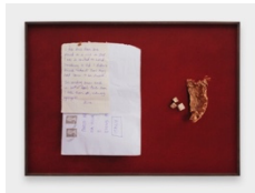
Image © Rose Salane 2023, courtesy the artist, Carlos/Ishikawa, and the Archaeological Park of Pompeii, in the context of Pompeii Commitment. Archaeological Matters . Photographer: Eva Herzog.