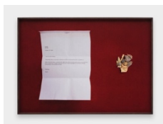
Image © Rose Salane 2023, courtesy the artist, Carlos/Ishikawa, and the Archaeological Park of Pompeii, in the context of Pompeii Commitment. Archaeological Matters. Photographer: Eva Herzog.

Edition of 3 plus 2 artist's proofs (CI-ROS-0099)