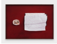
Image © Rose Salane 2023, courtesy the artist, Carlos/Ishikawa, and the Archaeological Park of Pompeii, in the context of Pompeii Commitment. Archaeological Matters. Photographer: Eva Herzog.

Framed Edition of 3 plus 2 artist's proofs (CI-ROS-0097)