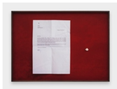
Image © Rose Salane 2023, courtesy the artist, Carlos/Ishikawa, and the Archaeological Park of Pompeii, in the context of Pompeii Commitment. Archaeological Matters . Photographer: Eva Herzog.