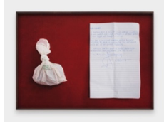
Image © Rose Salane 2023, courtesy the artist, Carlos/Ishikawa, and the Archaeological Park of Pompeii, in the context of Pompeii Commitment. Archaeological Matters . Photographer: Eva Herzog.

Edition of 3 plus 2 artist's proofs (CI-ROS-0108)