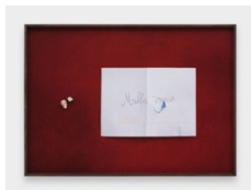
Image © Rose Salane 2023, courtesy the artist, Carlos/Ishikawa, and the Archaeological Park of Pompeii, in the context of Pompeii Commitment. Archaeological Matters . Photographer: Eva Herzog.