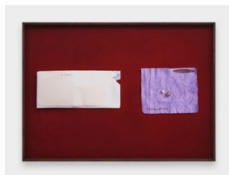
Image © Rose Salane 2023, courtesy the artist, Carlos/Ishikawa, and the Archaeological Park of Pompeii, in the context of Pompeii Commitment. Archaeological Matters . Photographer: Eva Herzog.