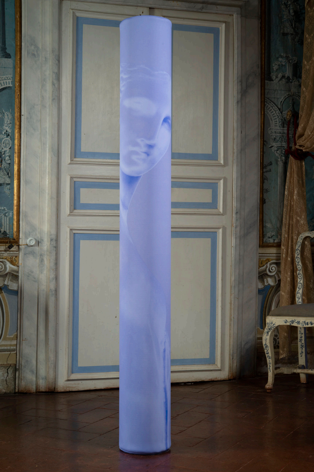
Sara VanDerBeek Roman Woman XXIII , 2019 Dye sublimation on neoprene, PVC, polyethylene foam 182.9 x 20.3 x 20.3 cm / 72 x 8 x 8 inches Editon 1 of 3 + (1 AP)