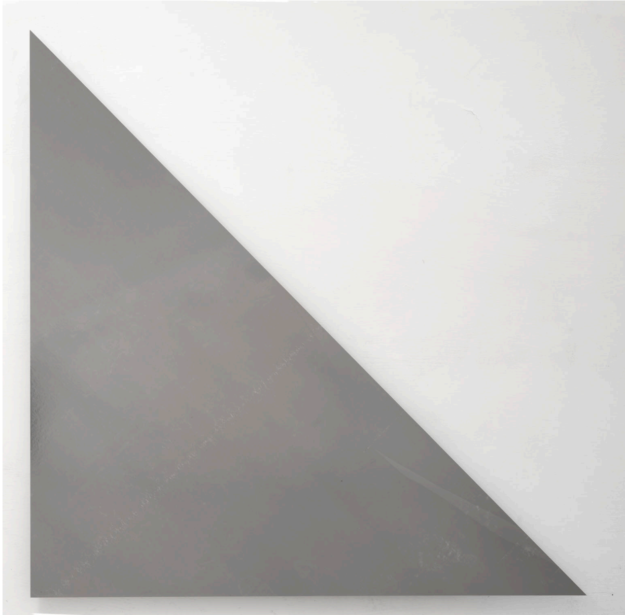
Liz Deschenes Stereopticon #1 , 2019 Silver-toned gelatin silver photogram mounted on aluminium 50.8 x 50.8 cm / 20 x 20 inches