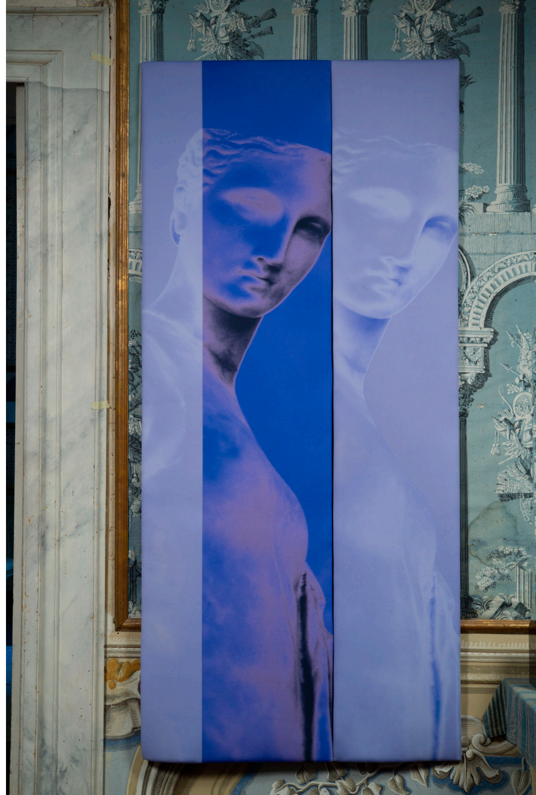
Sara VanDerBeek Roman Woman XXV , 2019 Dye sublimation print on Neoprene 183.5 x 81.3 cm / 72.25 x 32 inches Editon 1 of 3 + (1 AP)