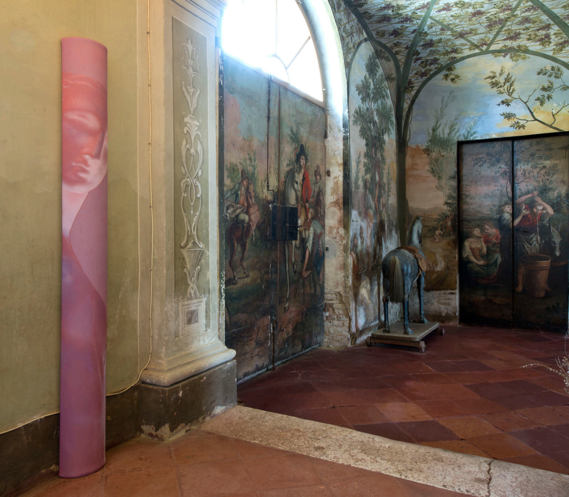
Sara VanDerBeek Roman Woman XXIV , 2019 Dye sublimation on neoprene, PVC, polyethylene foam 182.9 x 10.2 x 20.3 cm 72 x 4 x 8 inches Editon 1 of 3 + (1 AP)