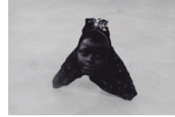
THINKING MAKES a Person Sad , 2023 CMYK print on anodised aluminium 59.7 x 66.3 x 31.5 cm 23 1/2 x 26 1/8 x 12 3/8 in edition of 3 + 1 AP