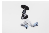
Sandwoman , 2022 collage with paper pins on birch plywood panel 196 x 145 cm 77 1/8 x 57 1/8 in