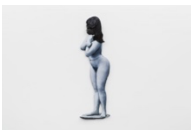
The Onlooker , 2022 collage with paper pins on birch plywood panel 197 x 65 cm 77 1/2 x 25 5/8 in