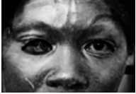
The "haunted" house , 2023 video installation edition of 3 + 1 AP