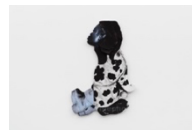
Leather on skin , 2022 collage with paper pins on birch plywood panel 120 x 82 cm 47 1/4 x 32 1/4 in