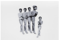
Leading the Blind , 2022 collage with paper pins on birch plywood panel 235.5 x 185 cm 92 3/4 x 72 7/8 in