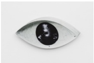
Eye , 2022 collage with paper pins on birch plywood panel 30 x 60 cm 11 3/4 x 23 5/8 in