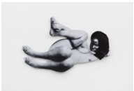
Three Legged Woman , 2022 collage with paper pins on birch plywood panel 99 x 148 cm 39 x 58 1/4 in