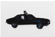
Car Ride , 2022 collage with paper pins on birch plywood panel 97 x 230 cm 38 1/4 x 90 1/2 in