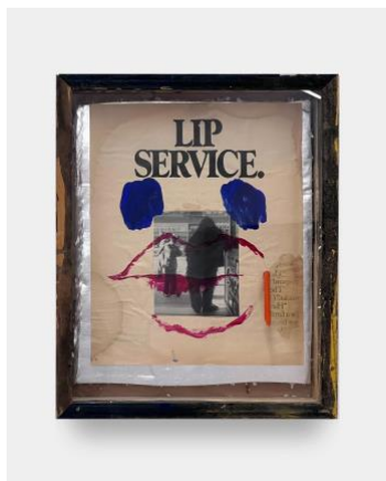
Bruce High Quality Foundation Ways to Die , 2018 Mixed media 16 x 13 x 3.5 inches