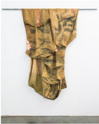
Tahir Karmali Fingers in the Soil , 2017 Raffia, copper and cobalt oxide 70 x 44 x 6 inches