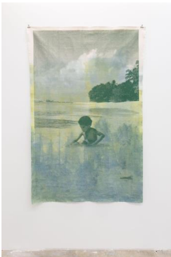
Tahir Karmali PARADISE VII , 2019 Screen printed acrylic on natural dyed canvas 60 x 39 inches