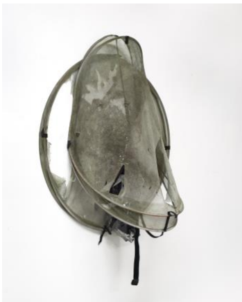
Vladislav Markov Cremation Society , 2020 Resin, vulcanized rubber, hood hinges, mesh, straps 30 x 23 x 15 inches