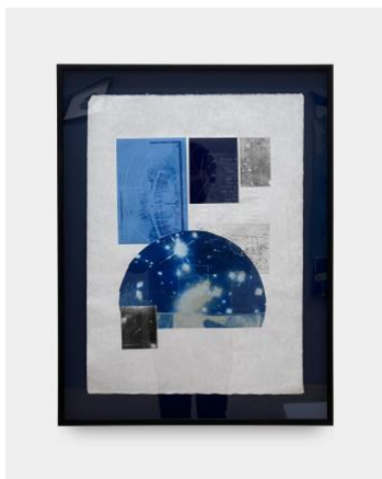
Kate Liebman Icarus III-a , 2021 Etching, photo litho and cyanotype chinecolle on Japanese mulberry paper 18.5 x 25.5 inches 30.75 x 23.75 inches framed