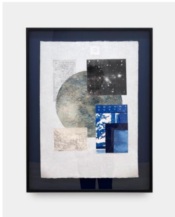
Kate Liebman Icarus II-b , 2021 Etching, photo litho and cyanotype chinecolle on Japanese mulberry paper 18.5 x 25.5 inches 30.75 x 23.75 inches framed