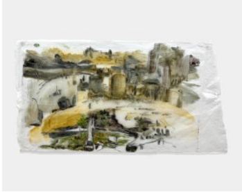
Nikholis Planck Untitled (duo horizontal) , 2021 Water soluble oil and wax pencil on wax paper 12 x 23 inches