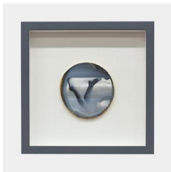
Liane Lang Bliss , 2022 Print on agate 8 x 8 x 1 inch framed