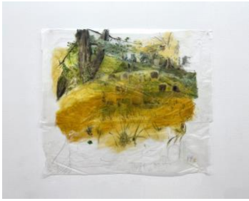
Nikholis Planck Another Portal , 2021 Water soluble oil and wax pencil on wax paper 20 x 22 inches