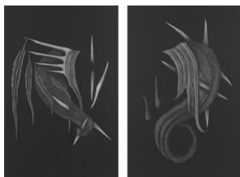
Afroz Amighi Love Story, Ghost Story , 2018 Scratchboard Each 25 x 37 inches framed