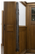
Victoire Thierrée Weave #3, 2023 152 x 10 cm Technical ceramic, steel, cire Unique Edition