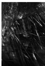
Victoire Thierrée War piece #2, 2022 26 x 33,5 cm Gelatin silver print Edition 5 + 2 AP