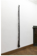
Victoire Thierrée Weave #1, 2023 218 x 16 x 3 cmm Technical ceramic, steel, cire Unique Edition

LA MAISON DE RENDEZ-VOUS is pleased to announce Crashed , a solo exhibition with Paris-based artist Victoire Thierrée. In the LMDRV exhibition, Thierrée appropriates the form and material of armed force, fragmenting, abstracting and re-imagining media as varied as military-grade ceramic fiber and documentary photography. Thierrée draws upon the inherently fetishistic relationship between object and image to create a body of work as extraordinarily alien as it is disarmingly familiar.