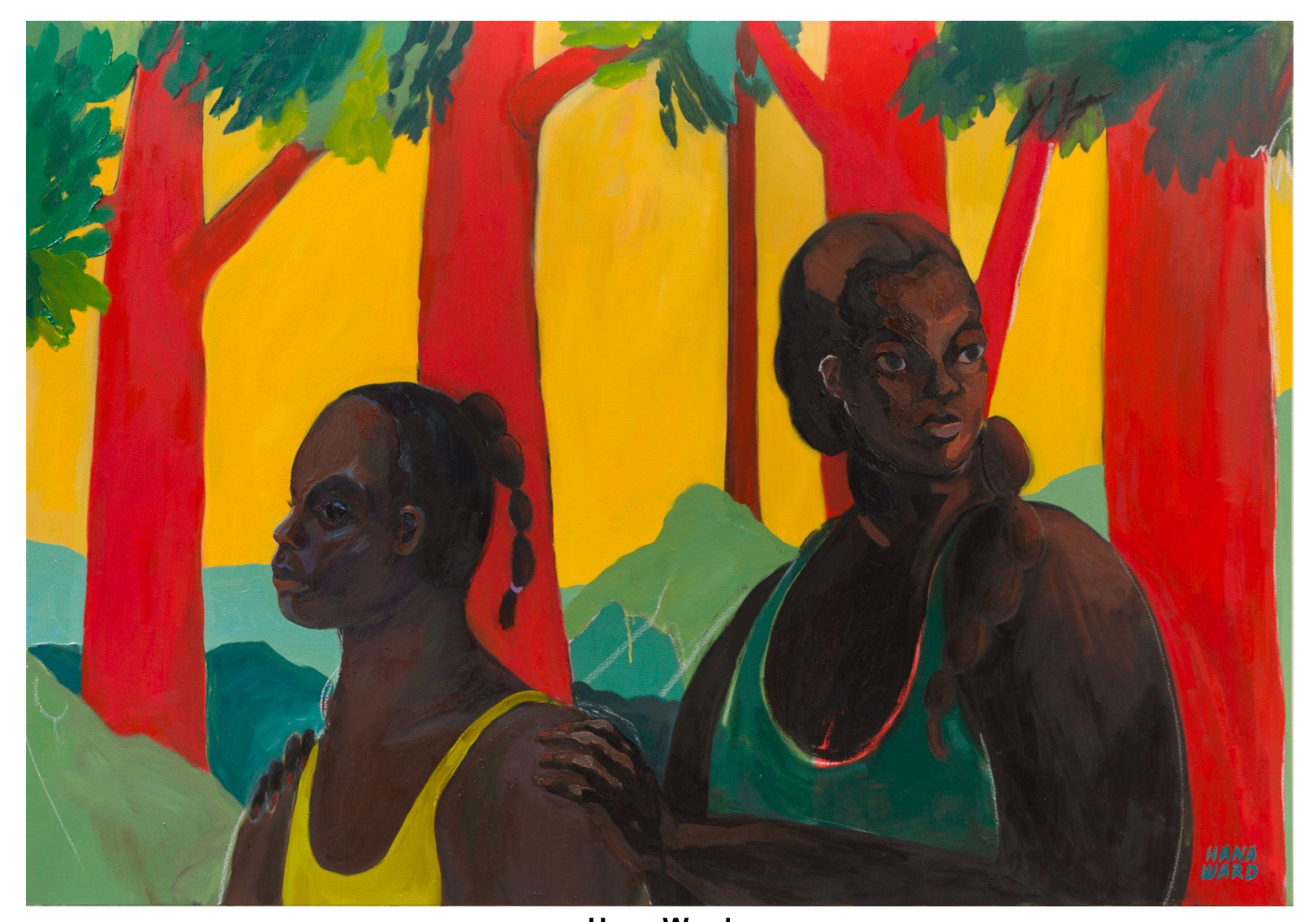
Hana Ward A Sound That Traveled Through the Trees, 2022 oil on canvas 48 x 72 in. / 121.9 x 182.9 cm.