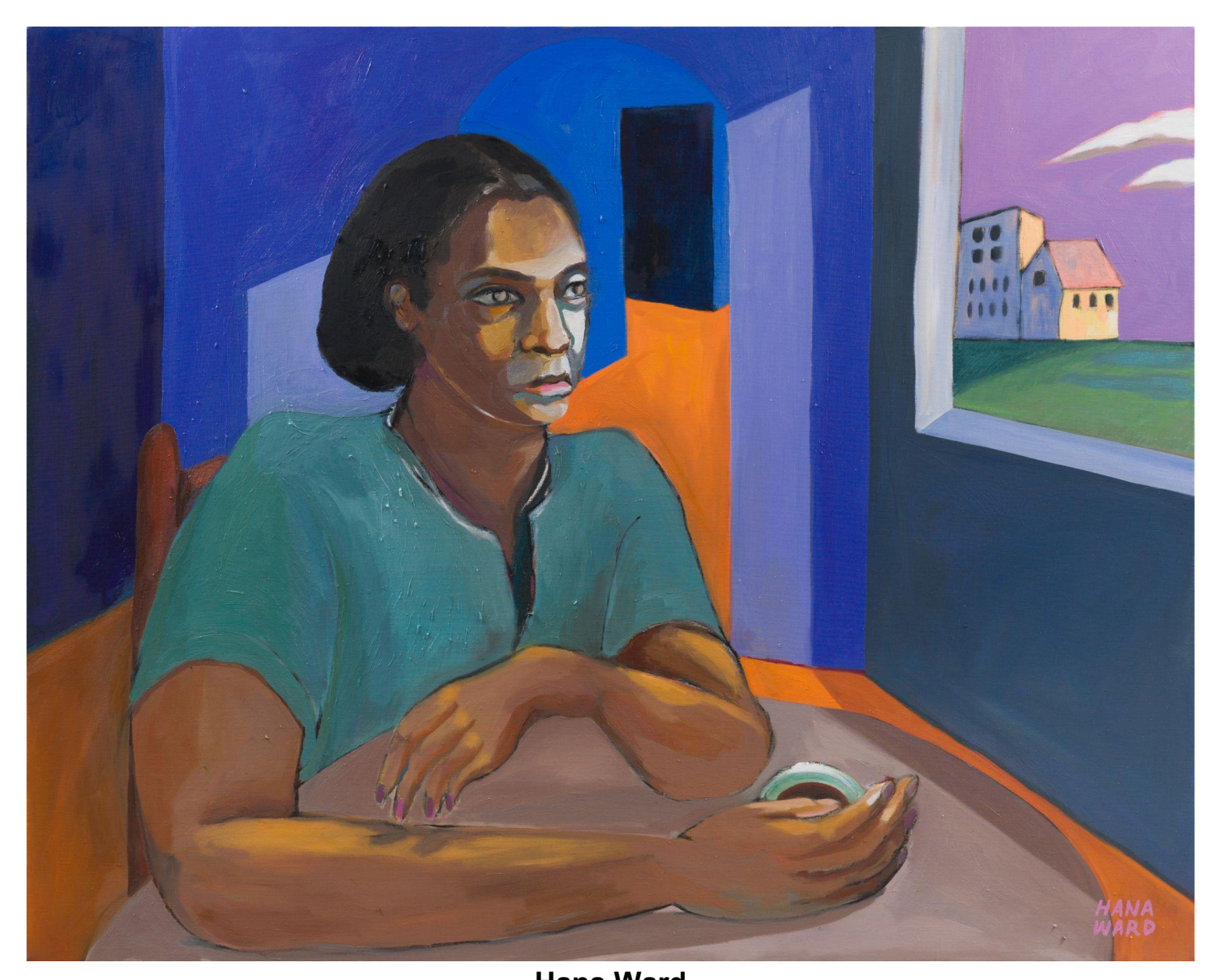
Hana Ward Blues Clues, 2022 oil on linen 40 x 48 in. / 101.6 x 121.9 cm.