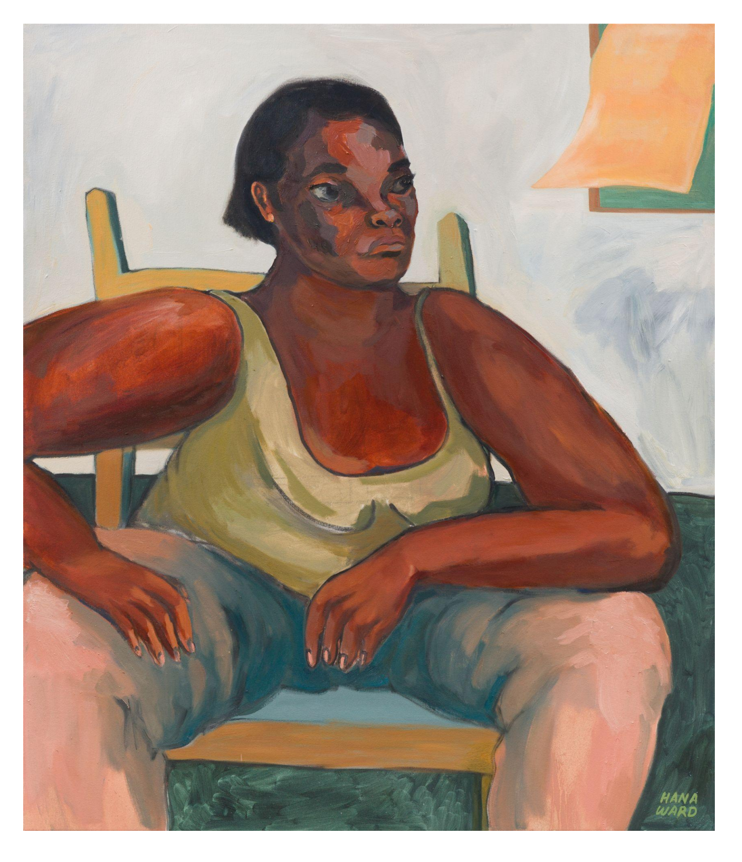
Hana Ward A past anger, soothed (Forgiveness), 2022 oil on canvas 48 x 40 in./ 121.9 x 101.6 cm