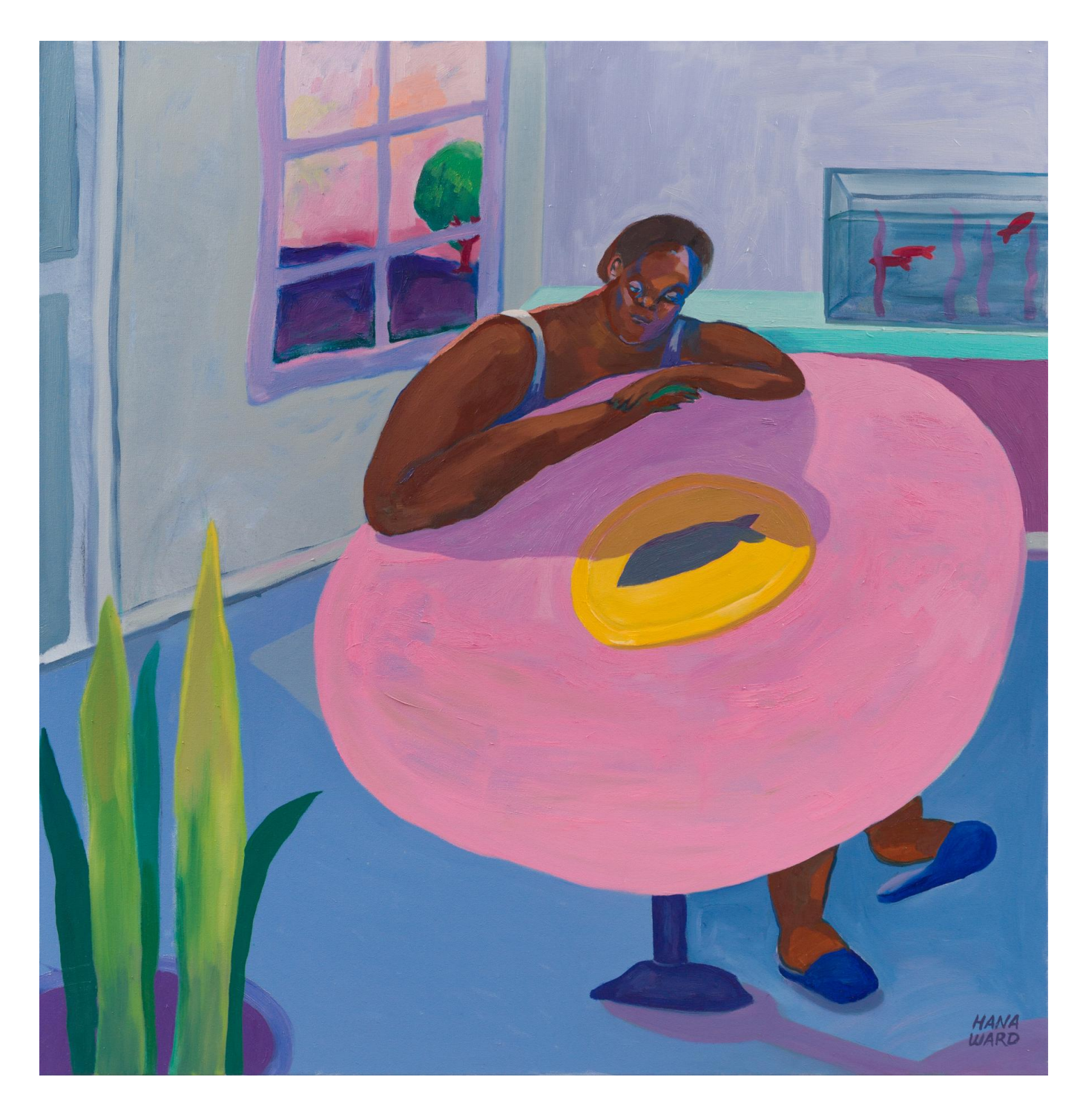
Hana Ward Chimes, 2022 oil on canvas 47.9 x 47.9 in. / 121.9 x 121.9 cm.