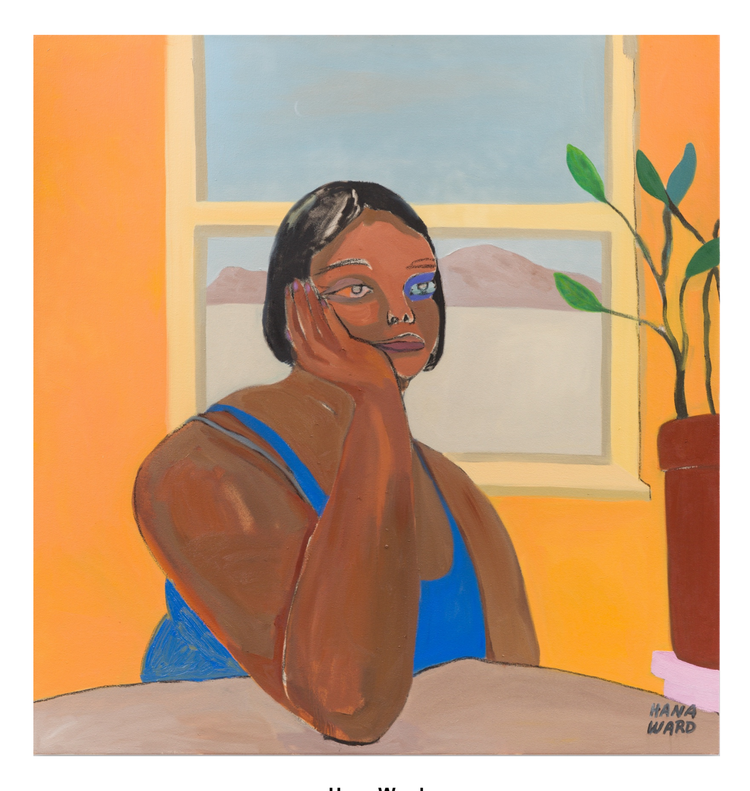
Hana Ward Untitled, 2022 oil on canvas 44 x 42 in., 111.8 x 106.7 cm.