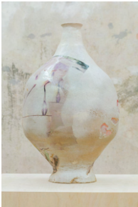
Willowfuck Milky way , 2023 Glazed stoneware 45 x 26 x 13cm