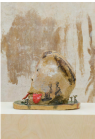
Willowfuck Hage boke kechi , 2023 — alternate view