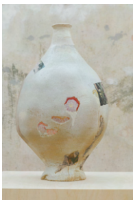
Willowfuck Milky way , 2023 — alternate view