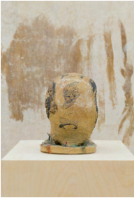
Willowfuck Hage boke kechi , 2023 — alternate view