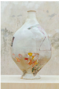
Willowfuck Milky way , 2023 — alternate view