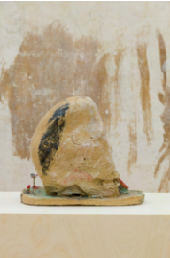
Willowfuck Hage boke kechi , 2023 — alternate view