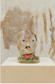
Willowfuck Hage boke kechi , 2023 Glazed stoneware 20 x 22 x 13cm