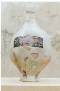
Willowfuck Milky way , 2023 — alternate view