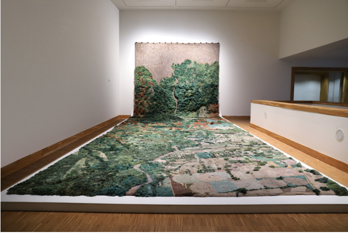
Alexandra Kehayoglou, Rio Parana de las Palmas , 2021. Hand-tufted wool, 472.4 x 169.3 in (1199.896 x 430.022 cm).