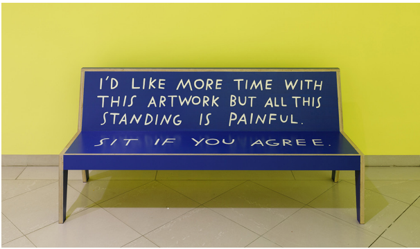
Finnegan Shannon, Do you want us here or not (MMK) 3 , 2021. Plywood, paint, 72 x 26 x 36 in (182.88 x 66.04 x 91.44 cm).