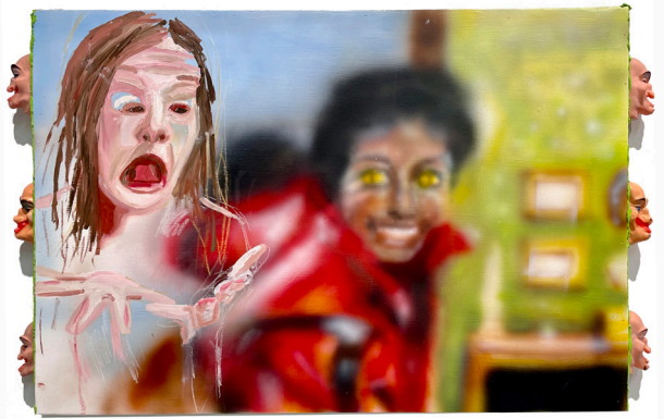
Erykah Townsend, Look Mom, I'm a Woman Now! , 2021. Acrylic, oil, modeling paste, and toy witches on panel, 24 x 36 in (60.96 x 91.44 cm). Courtesy the artist