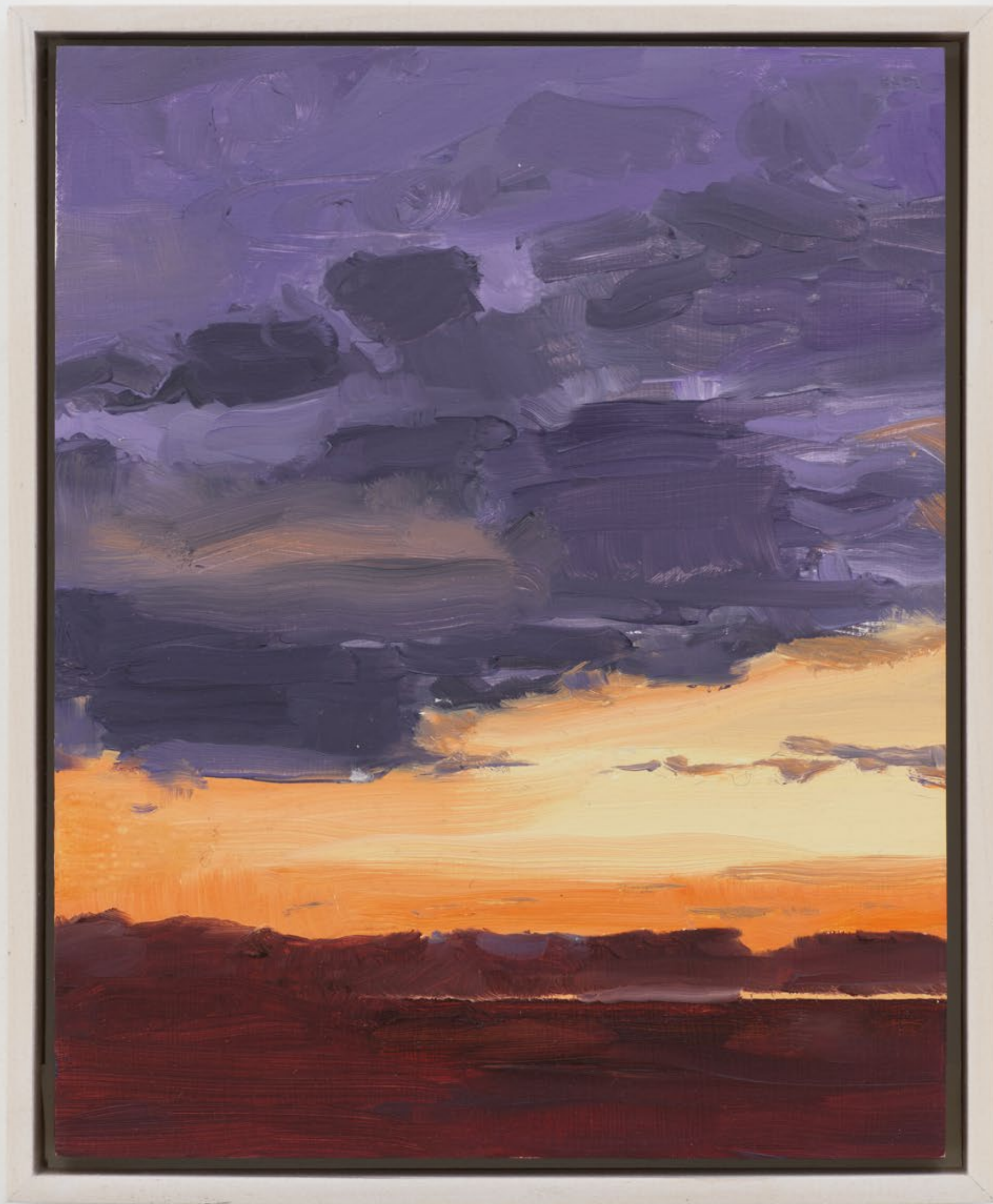
Hans-Peter Thomas untitled, 2023 Oil on wood panel 10 x 8 inches 25.4 x 20.32 cm HT0015