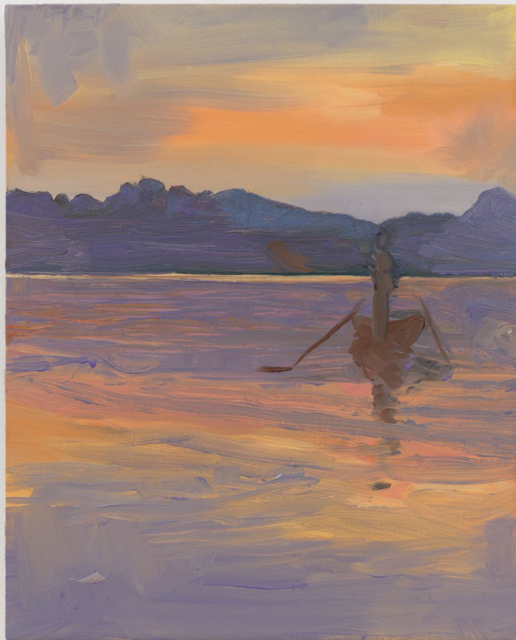
Hans-Peter Thomas untitled, 2023 Oil on wood panel 10 x 8 inches 25.4 x 20.32 cm HT0006