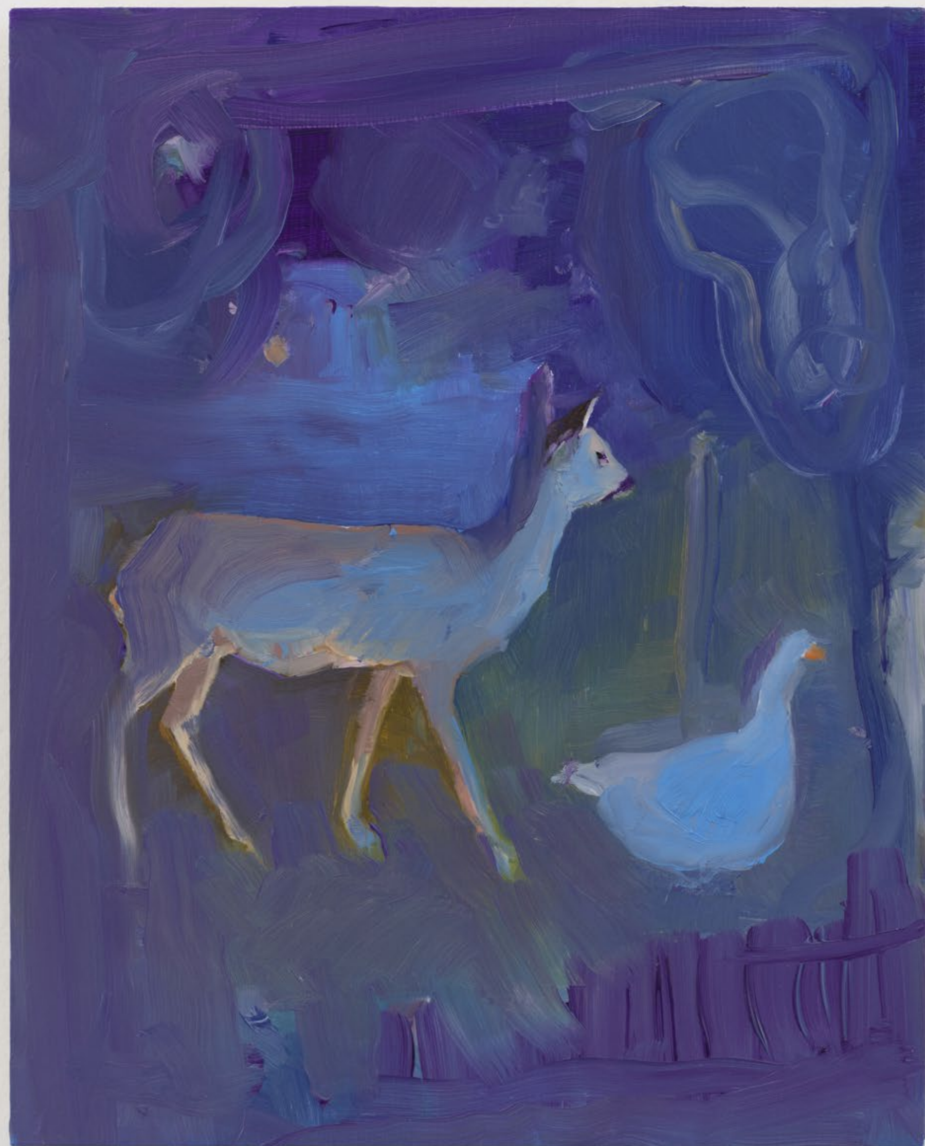
Hans-Peter Thomas untitled, 2023 Oil on wood panel 10 x 8 inches 25.4 x 20.32 cm HT0001