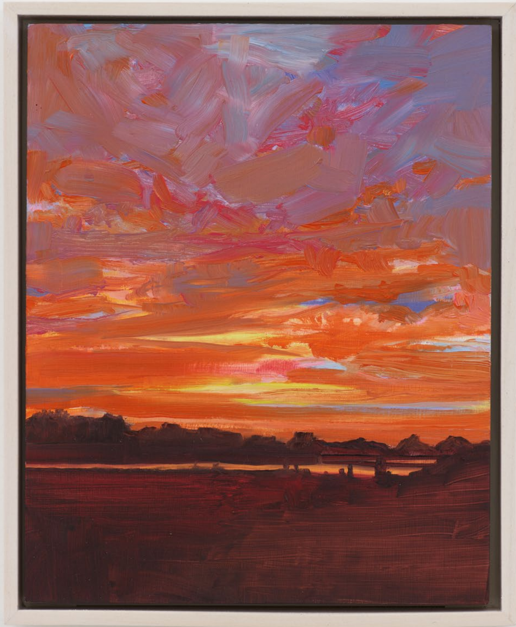
Hans-Peter Thomas untitled, 2023 Oil on wood panel 10 x 8 inches 25.4 x 20.32 cm HT0017