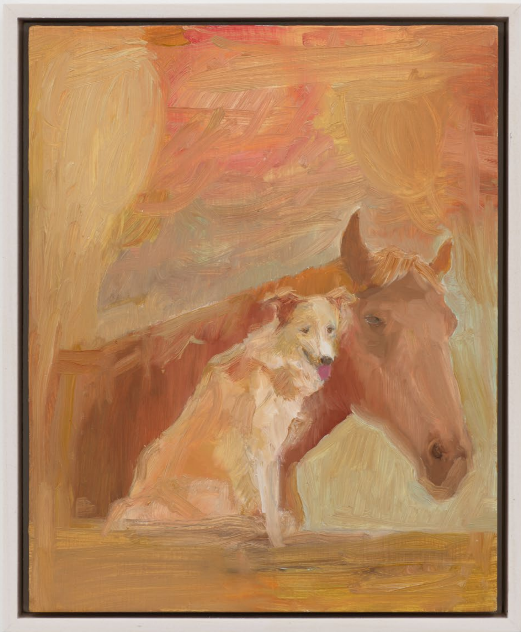
Hans-Peter Thomas untitled, 2023 Oil on wood panel 10 x 8 inches 25.4 x 20.32 cm HT0002