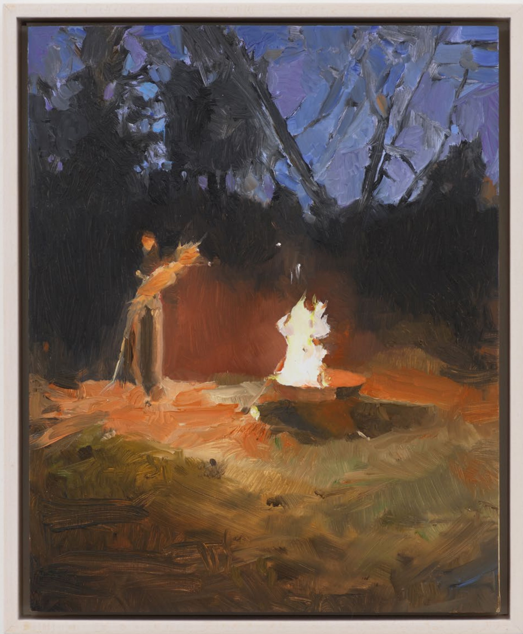
Hans-Peter Thomas untitled, 2023 Oil on wood panel 10 x 8 inches 25.4 x 20.32 cm HT0018