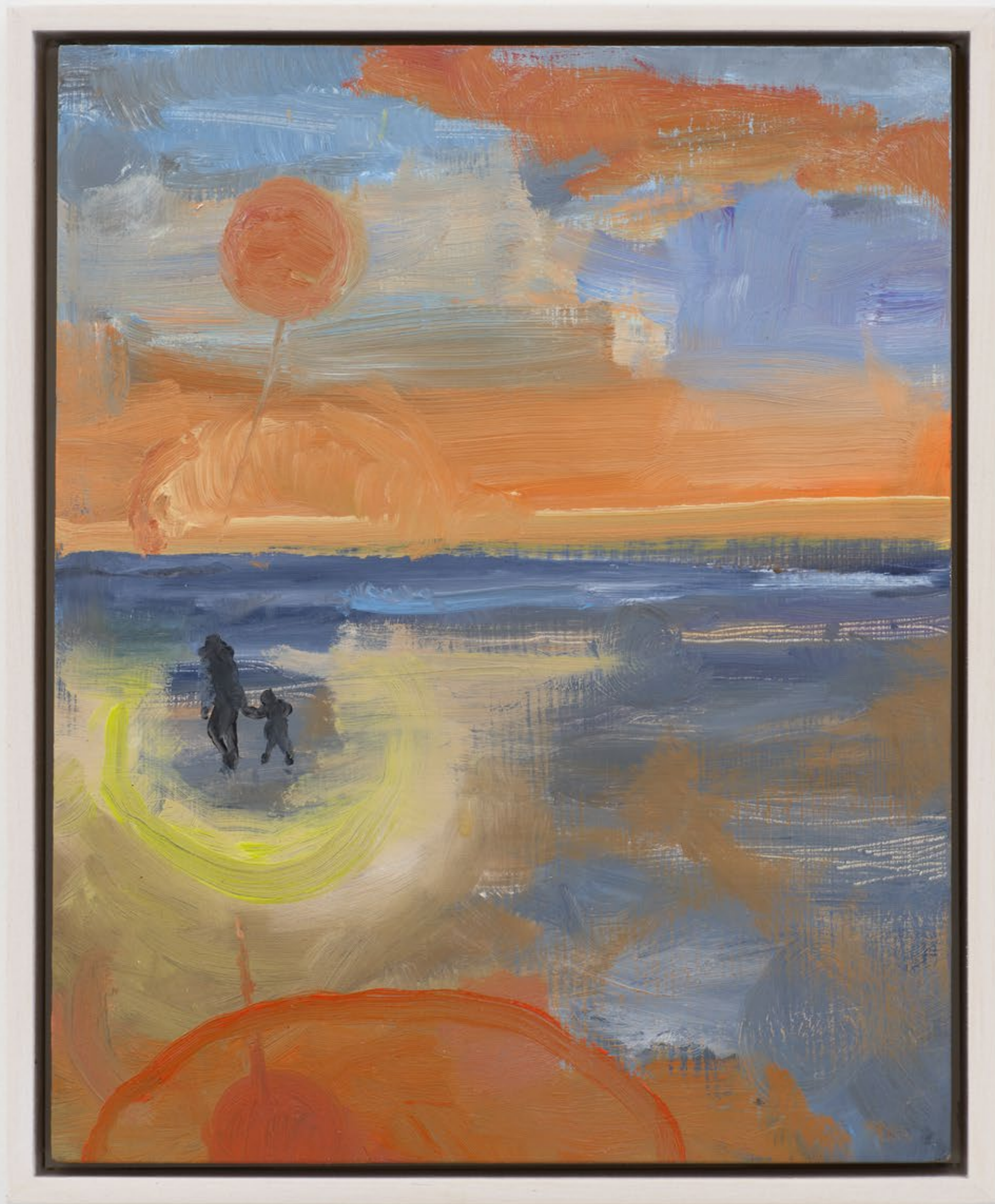
Hans-Peter Thomas untitled, 2023 Oil on wood panel 10 x 8 inches 25.4 x 20.32 cm HT0011