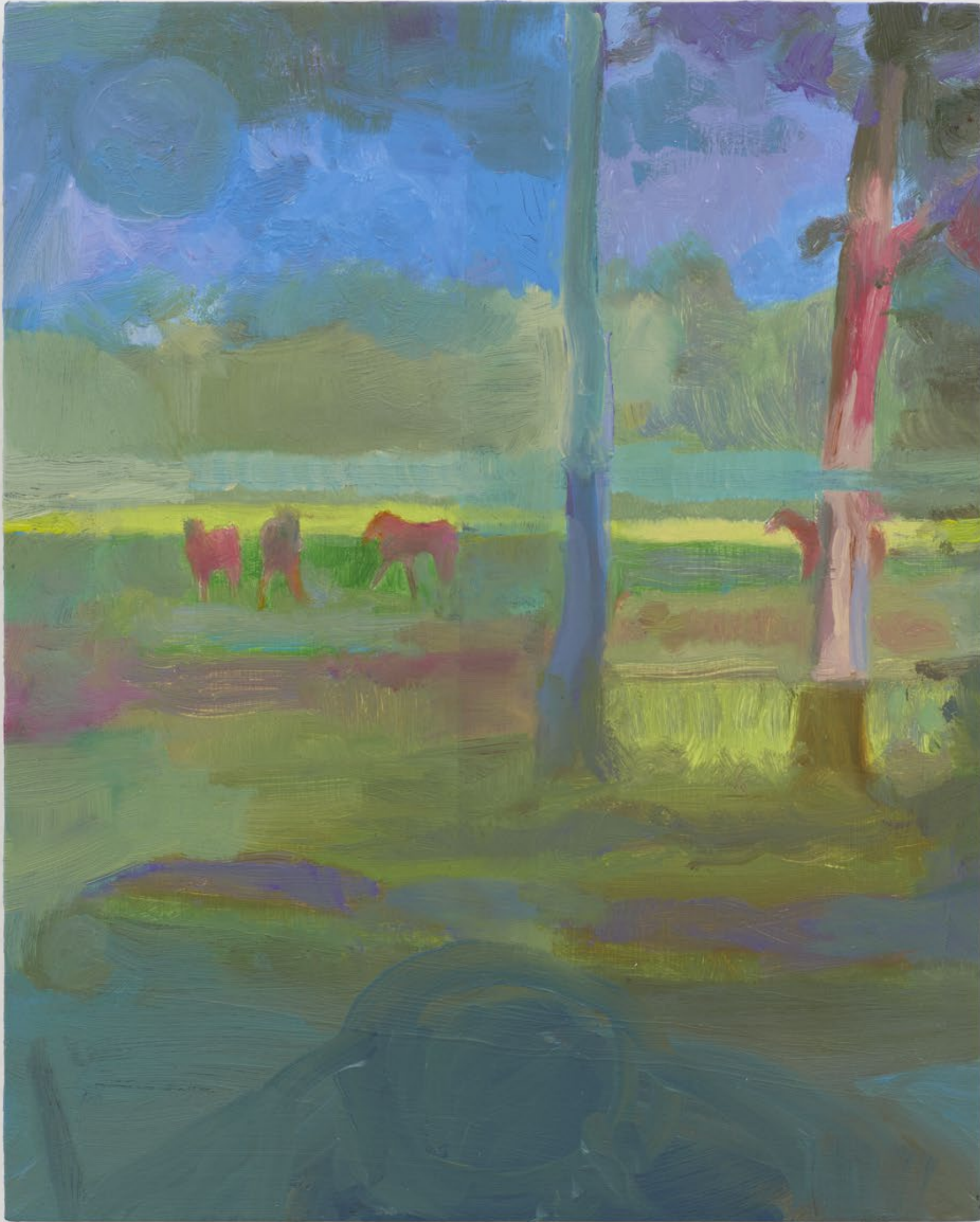
Hans-Peter Thomas untitled, 2023 Oil on wood panel 10 x 8 inches 25.4 x 20.32 cm HT0010