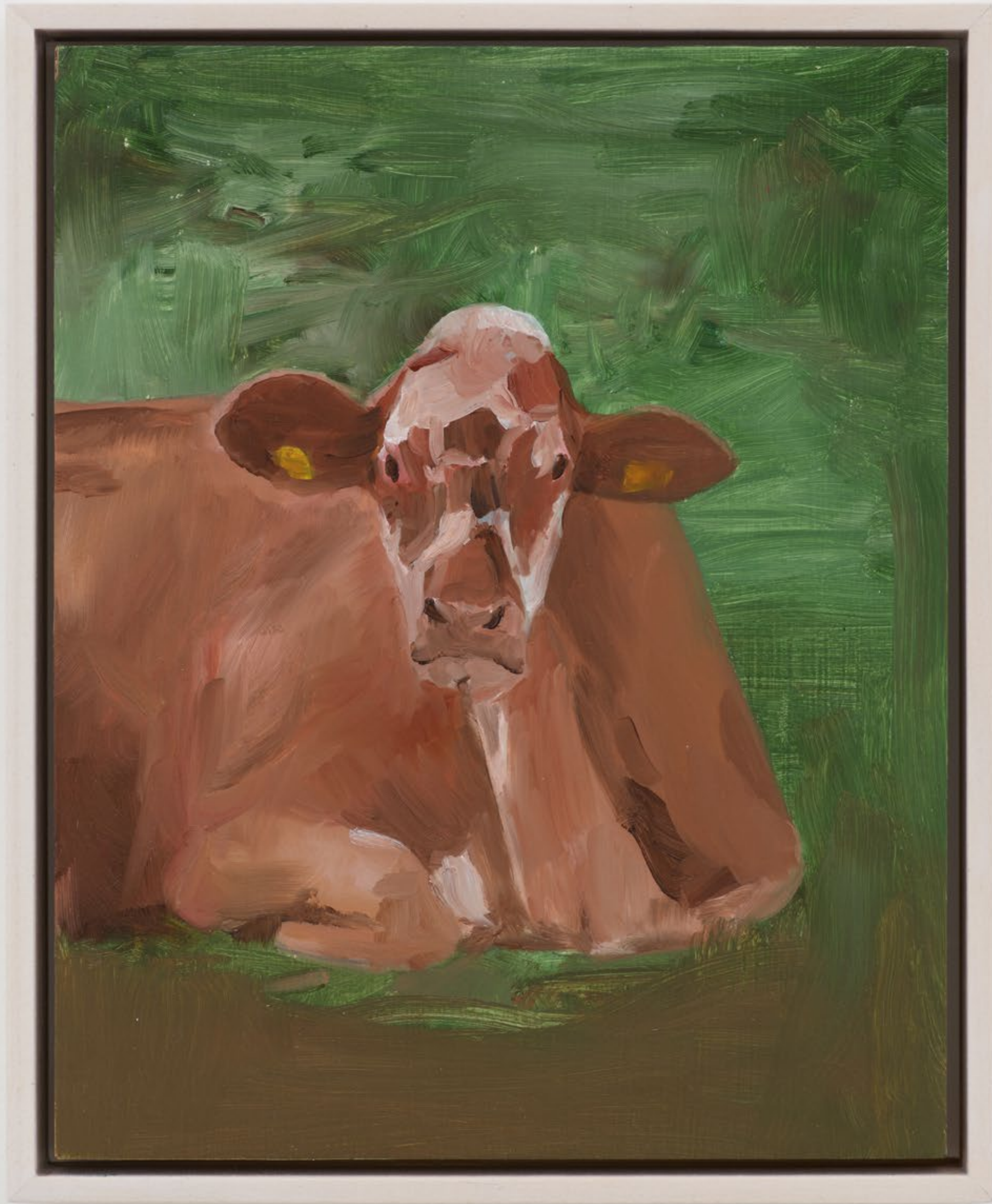
Hans-Peter Thomas untitled, 2023 Oil on wood panel 10 x 8 inches 25.4 x 20.32 cm HT0003