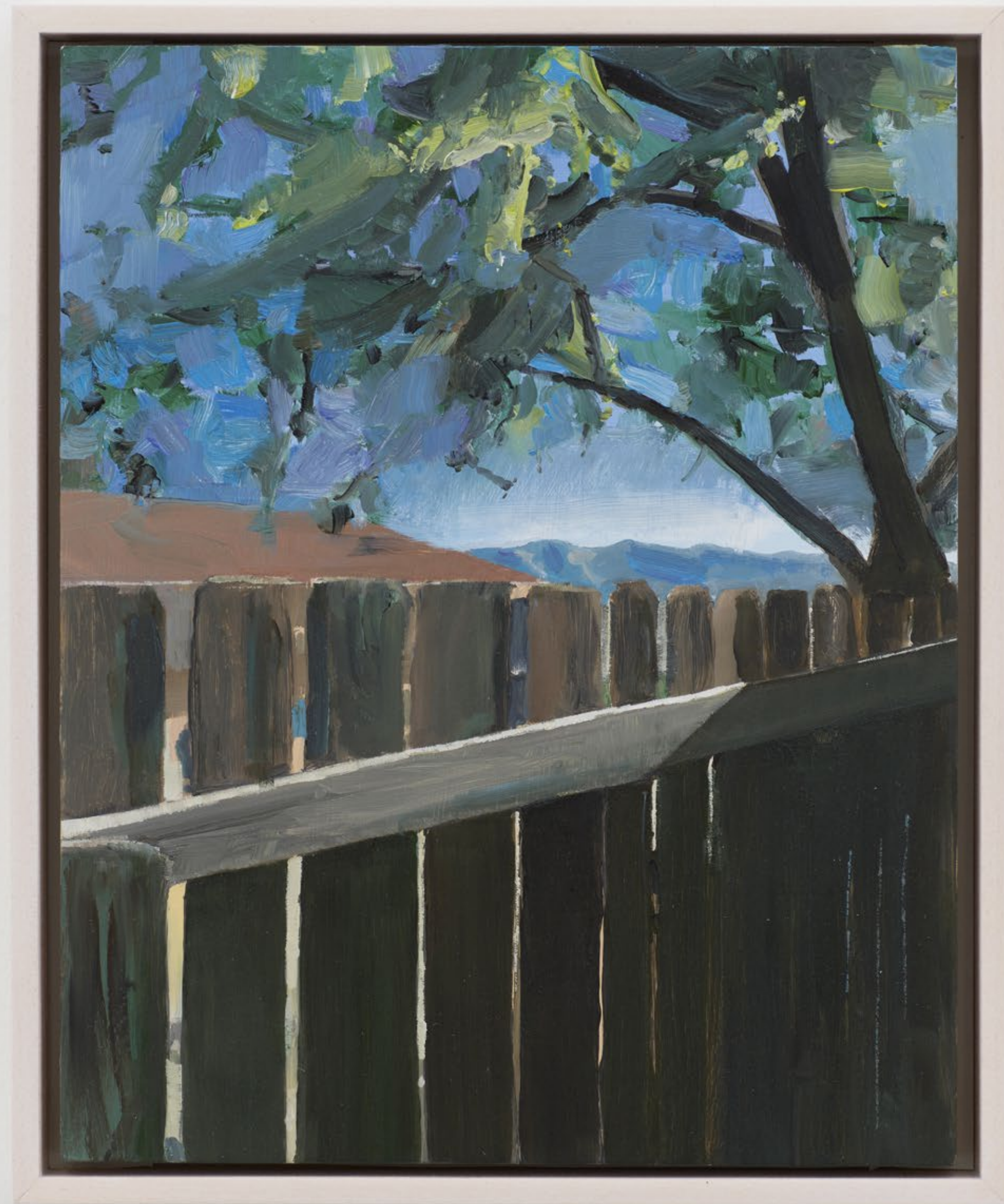
Hans-Peter Thomas untitled, 2023 Oil on wood panel 10 x 8 inches 25.4 x 20.32 cm HT0019