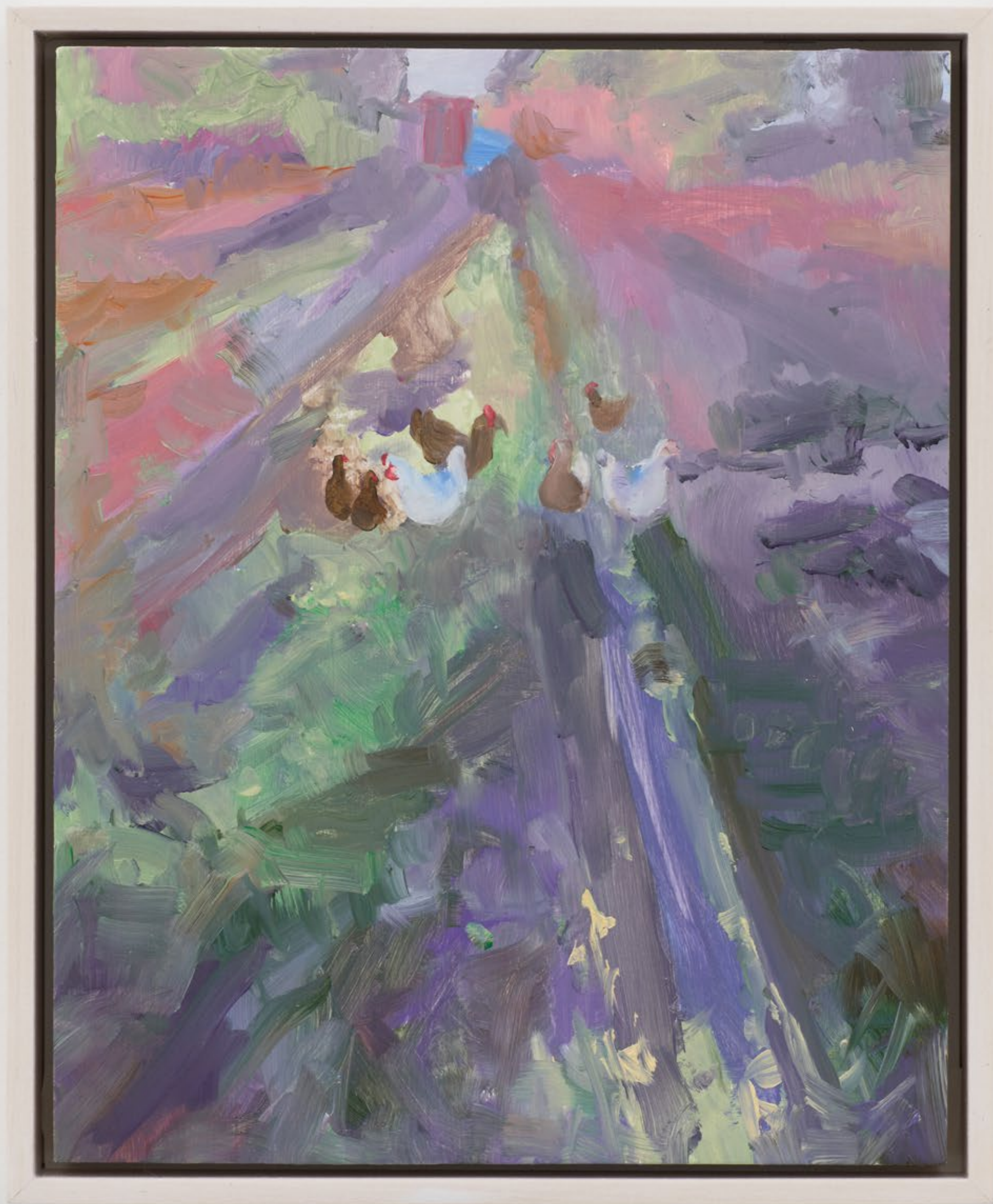
Hans-Peter Thomas untitled, 2023 Oil on wood panel 10 x 8 inches 25.4 x 20.32 cm HT0004