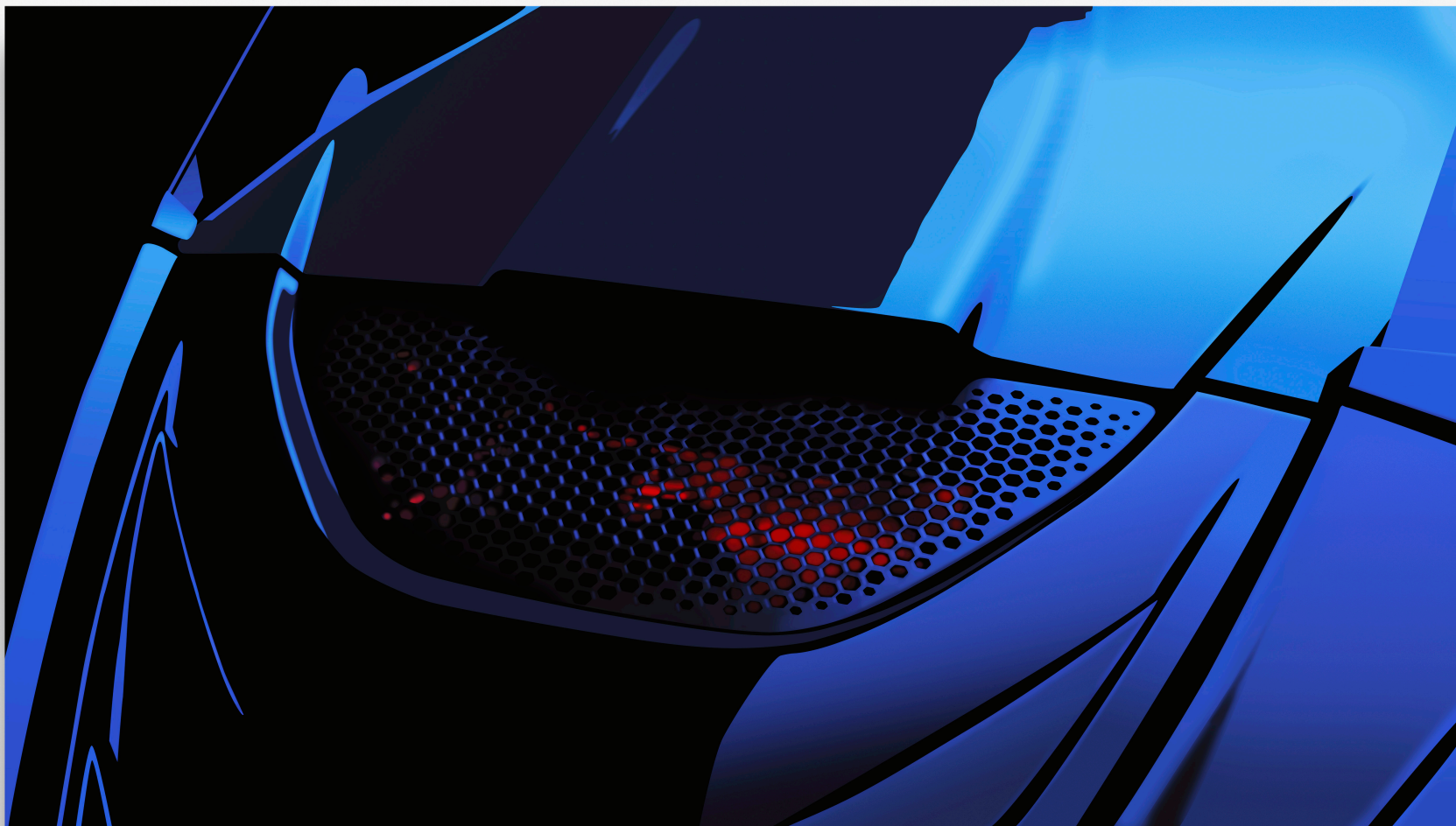
Taslima Ahmed Screenshot 5 , 2020 fine art print on Hahnemühle ultrasmooth photopaper on Alu Dibond 79 x 150 cm 31 1/8 x 59 inches