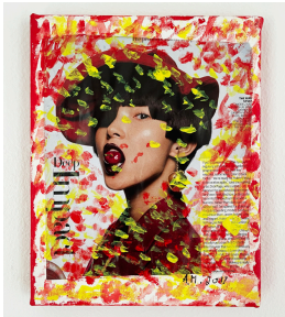
Alice Mackler Untitled , 2017 Acrylic and collage on canvas 10 x 8 inches (25.4 x 20.32 cm)