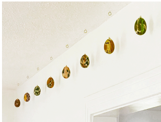
Nikholis Planck Fourteen Ovoids , 2019–2023 Water soluble oil, wax pencil on wax on wood Each 2 1/2 x 1 5/8 x 1 5/8 inches (6.35 x 4.18 x 4.18 cm) Installation variable