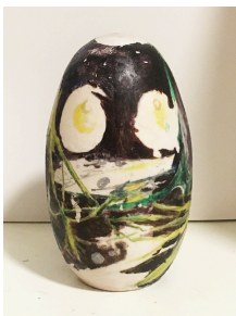
Nikholis Planck Big Ovoid , 2021 Water soluble oil, wax pencil on wax on wood 4 3/4 x 2 3/4 x 2 3/4 inches (12.07 x 6.99 x 6.99 cm)