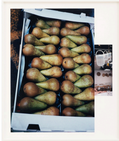
Mary Manning High Hopes Redux , 2023 Chromogenic prints, mat board, artist's frame 27 x 22 3/4 inches (68.58 x 57.79 cm) 27 1/4 x 23 x 1 1/2 inches (69.22 x 58.42 x 3.81 cm) (framed)