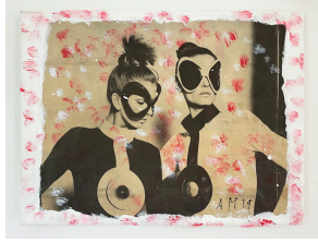
Alice Mackler Untitled , 2019 Acrylic and collage on canvas 9 x 12 inches (22.86 x 30.48 cm)