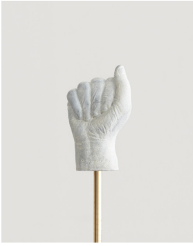
Kemang Wa Lehulere Vowels (detail), 2023 bronze, brass 130 x 30 x 30 cm (each) 1/3