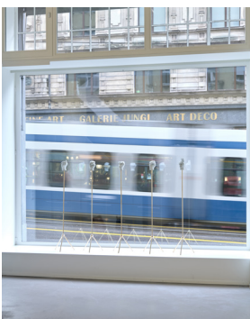
Kemang Wa Lehulere Vowels, 2023 bronze, brass 130 x 30 x 30 cm (each) 1/3