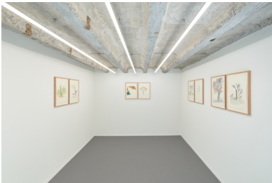
Kemang Wa Lehulere, Erf, 2021 ink on paper Diptych, 42 x 29 cm / 50.5 x 37 cm each (framed)