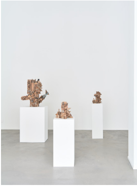
Kemang Wa Lehulere, Library 1, 2021 Wood from salvaged school desks, 70 x 64 x 48 cm Library 10, 2021 Wood from salvaged school desks, 30 x 32 x 23 cm Library 12, 2021 Wood from salvaged school desks, 32 x 35 x 26 cm