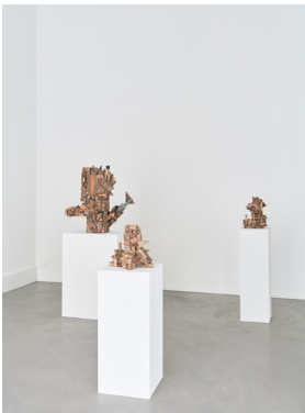
Kemang Wa Lehulere, Library 1, 2021 Wood from salvaged school desks, 70 x 64 x 48 cm Library 10, 2021 Wood from salvaged school desks, 30 x 32 x 23 cm Library 12, 2021 Wood from salvaged school desks, 32 x 35 x 26 cm