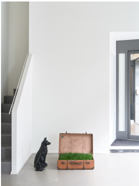
Kemang Wa Lehulere, Return to Sender, 2023 suitcase, earth, grass, porcelain dogs, 52 x 110 x 70 cm