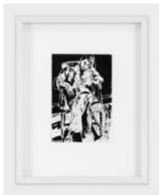
Tobias Kaspar Shirts and pants by Marni, 2020 Ink and acrylic on paper 32 × 17.6 cm (12 5/8 × 6 7/8 inches) 33 × 26 × 3 cm (13 × 10 1/4 × 1 1/8 inches) (framed)