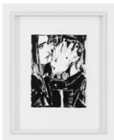
Tobias Kaspar The Kiss (Tom Ford), 2020 Ink and acrylic on paper 21 × 29.7 cm (8 1/4 × 11 3/4 inches) 45.5 × 35.5 × 3 cm (17 7/8 × 14 × 1 1/8 inches) (framed)