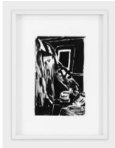
Tobias Kaspar Hopkins' serving tea, 2020 Ink and acrylic on paper 15.2 × 24 cm (6 × 9 1/2 inches) 38.5 × 28.5 × 3 cm (15 1/8 × 11 1/4 × 1 1/8 inches) (framed)