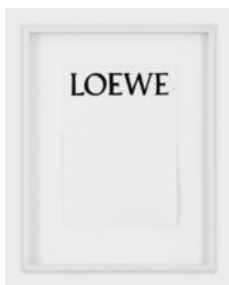
Tobias Kaspar Loewe (Logotype), 2020 Ink and acrylic on paper 21.2 × 29.8 cm (8 3/8 × 11 3/4 inches) 45.5 × 35.5 × 3 cm (17 7/8 × 14 × 1 1/8 inches) (framed)