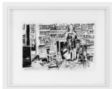
Tobias Kaspar Gucci and the Nabokov Butterfly Collection, 2020 Ink and acrylic on paper 42.6 × 29.9 cm (16 3/4 × 11 3/4 inches) 59.5 × 46.5 × 3 cm (23 3/8 × 18 1/4 × 1 1/8 inches) (framed)