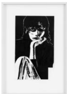
Tobias Kaspar Finn Wolfhard photographed by Cruz Valdez, 2020 Ink and acrylic on paper 24 × 39.5 cm (9 1/2 × 15 1/2 inches)