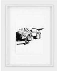
Tobias Kaspar Still life with a fan, lipstick and perfume, 2020 Ink and acrylic on paper 21 × 29.7 cm (8 1/4 × 11 3/4 inches) 35.5 × 45.5 cm (14 × 17 7/8 inches) (framed)