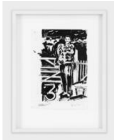
Tobias Kaspar Laundry, 2020 Ink and acrylic on paper 18.6 × 26.7 cm (7 3/8 × 10 1/2 inches) 40.5 × 31 × 3 cm (16 × 12 1/4 × 1 1/8 inches) (framed)