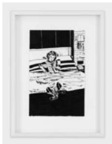
Tobias Kaspar Don't Call Me Baby, 2020 Ink and acrylic on paper 17.7 × 27.3 cm (7 × 10 3/4 inches) 39.5 × 29.5 × 3 cm (15 1/2 × 11 5/8 × 1 1/8 inches) (framed)