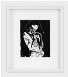
Tobias Kaspar Sofia Steinberg, 2020 Ink and acrylic on paper 14.3 × 18 cm (5 5/8 × 7 1/8 inches) 31 × 26.5 × 3 cm (12 1/4 × 10 3/8 × 1 1/8 inches) (framed)