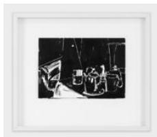
Tobias Kaspar Anthony Hopkins' tea set, 2020 Ink and acrylic on paper 23.9 × 16.8 cm (9 3/8 × 6 5/8 inches) 32 × 37.5 × 3 cm (12 5/8 × 14 3/4 × 1 1/8 inches) (framed)