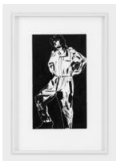
Tobias Kaspar Finn Wolfhard in a Ferragamo jumpsuit, 2020 Ink and acrylic on paper 24 × 42 cm (9 1/2 × 16 1/2 inches) 61.5 × 42 × 3 cm (24 1/4 × 16 1/2 × 1 1/8 inches) (framed)