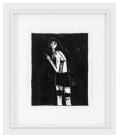
Tobias Kaspar Sofia Steinberg in Mugler, 2020 Ink and acrylic on paper 27.3 × 34 cm (10 3/4 × 13 3/8 inches) 50.5 × 43 × 3 cm (19 7/8 × 16 7/8 × 1 1/8 inches) (framed)