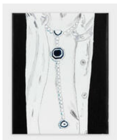
Tobias Kaspar Kristen Stewart Chanel Jewelry, 2023 Acrylic paint on canvas 24 × 20 × 2.5 cm (9 1/2 × 7 7/8 × 1 inches)