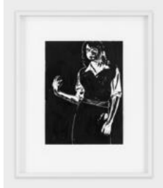
Tobias Kaspar Finn Wolfhard in Michael Kors, 2020 Ink and acrylic on paper 24 × 32 cm (9 1/2 × 12 5/8 inches) 50.5 × 41.5 × 3 cm (19 7/8 × 16 3/8 × 1 1/8 inches) (framed)