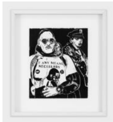
Tobias Kaspar Larry Kramer (Act Up), 2020 Ink and acrylic on paper 19 × 21.7 cm (7 1/2 × 8 1/2 inches) 34 × 30.5 cm (13 3/8 × 12 inches) (framed)