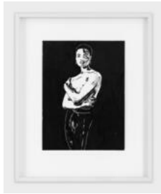
Tobias Kaspar New York City Ballet (Tights by Capezio), 2020 Ink and acrylic on paper 24 × 32 cm (9 1/2 × 12 5/8 inches) 48.5 × 39.5 × 3 cm (19 1/8 × 15 1/2 × 1 1/8 inches) (framed)