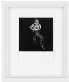
Tobias Kaspar Celine by Hedi, 2020 Ink and acrylic on paper 24 × 32 cm (9 1/2 × 12 5/8 inches) 50.5 × 41.5 × 3 cm (19 7/8 × 16 3/8 × 1 1/8 inches) (framed)