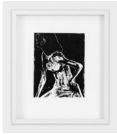
Tobias Kaspar Sofia Steinberg in Dior, 2020 Ink and acrylic on paper 14 × 18 cm (5 1/2 × 7 1/8 inches) 31 × 26.5 × 3 cm (12 1/4 × 10 3/8 × 1 1/8 inches) (framed)