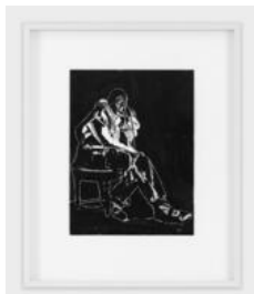
Tobias Kaspar Telfar, 2020 Ink and acrylic on paper 24 × 31.8 cm (9 1/2 × 12 1/2 inches) 50.5 × 41.5 × 3 cm (19 7/8 × 16 3/8 × 1 1/8 inches) (framed)