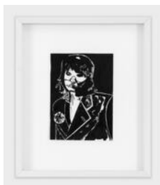
Tobias Kaspar Finn with mask, 2020 Ink and acrylic on paper 32 × 16.4 cm (12 5/8 × 6 1/2 inches) 30 × 25.5 × 3 cm (11 3/4 × 10 × 1 1/8 inches) (framed)