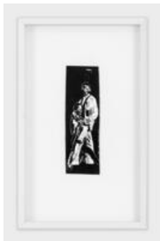
Tobias Kaspar Pose, 2020 Ink and acrylic on paper 11.5 × 24 cm (4 1/2 × 9 1/2 inches) 39.5 × 24 × 3 cm (15 1/2 × 9 1/2 × 1 1/8 inches) (framed)