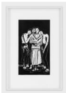
Tobias Kaspar New York City Ballet (tights, socks and slippers), 2020 Ink and acrylic on paper 24 × 41.5 cm (9 1/2 × 16 3/8 inches) 62.5 × 42 × 3 cm (24 5/8 × 16 1/2 × 1 1/8 inches) (framed)