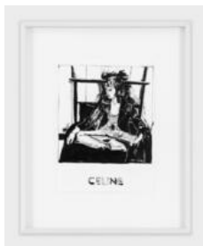
Tobias Kaspar Celine by Hedi Slimane, 2020 Ink and acrylic on paper 24 × 32 cm (9 1/2 × 12 5/8 inches) 50.5 × 41.5 cm (19 7/8 × 16 3/8 inches) (framed)