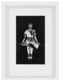
Tobias Kaspar Eliza in Gucci, 2020 Ink and acrylic on paper 25.1 × 42 cm (9 7/8 × 16 1/2 inches) 61.5 × 43 × 3 cm (24 1/4 × 16 7/8 × 1 1/8 inches) (framed)