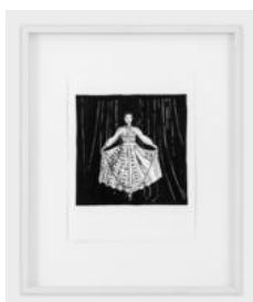
Tobias Kaspar New York City Ballet (Miriam in a Dior dress), 2020 Ink and acrylic on paper 24 × 32 cm (9 1/2 × 12 5/8 inches) 41.5 × 50.5 × 3 cm (16 3/8 × 19 7/8 × 1 1/8 inches) (framed)