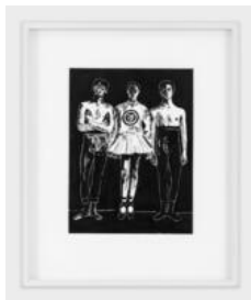
Tobias Kaspar New York City Ballet (sweatshirt and shirt by Hedi Slimane for Celine), 2020 Ink and acrylic on paper 24 × 32 cm (9 1/2 × 12 5/8 inches) 50.5 × 41.5 × 3 cm (19 7/8 × 16 3/8 × 1 1/8 inches) (framed)