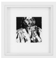
Tobias Kaspar Julia Fox in Miu Miu (Coke), 2020 Ink and acrylic on paper 15.6 × 15.5 cm (6 1/8 × 6 1/8 inches) 30 × 29 × 3 cm (11 3/4 × 11 3/8 × 1 1/8 inches) (framed)