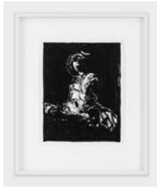
Tobias Kaspar Sofia Steinberg in Moschino Couture, 2020 Ink and acrylic on paper 26 × 32.7 cm (10 1/4 × 12 7/8 inches) 50.5 × 41.5 × 3 cm (19 7/8 × 16 3/8 × 1 1/8 inches) (framed)