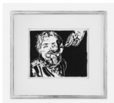
Tobias Kaspar The Lighthouse (Robert Pattinson giving a light to William Dafoe), 2023 Ink and acrylic on paper 54.5 × 59.8 cm (21 1/2 × 23 1/2 inches) (framed)