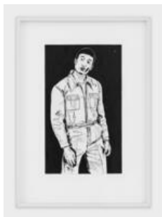
Tobias Kaspar Joel Kim Booster in a Gucci jumpsuit, 2020 Ink and acrylic on paper 25.1 × 42 cm (9 7/8 × 16 1/2 inches) 61.5 × 43.5 cm (24 1/4 × 17 1/8 inches) (framed)