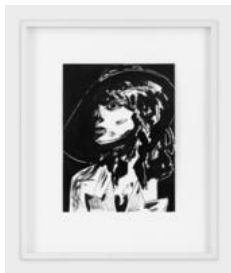
Tobias Kaspar Finn Wolfhard in a Dior jacket and Sacai hat, 2020 Ink and acrylic on paper 24 × 32 cm (9 1/2 × 12 5/8 inches) 50.5 × 41.5 × 3 cm (19 7/8 × 16 3/8 × 1 1/8 inches) (framed)