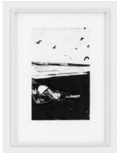
Tobias Kaspar Gabbriette in a Hedi Slimane Celine jacket and Kiki de Montparnasse bra, 2020 Ink and acrylic on paper 26.5 × 42 cm (10 3/8 × 16 1/2 inches) 61.5 × 44.5 × 3 cm (24 1/4 × 17 1/2 × 1 1/8 inches) (framed)