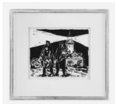
Tobias Kaspar The Lighthouse (Robert Pattinson and William Dafoe in front of the lighthouse), 2022 Ink and acrylic on paper 54.5 × 59.8 cm (21 1/2 × 23 1/2 inches) (framed)