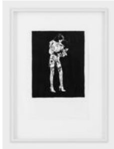
Tobias Kaspar A Woman Under the Influence, 2020 Ink and acrylic on paper 26.5 × 42 cm (10 3/8 × 16 1/2 inches) 61.5 × 44.5 cm (24 1/4 × 17 1/2 inches) (framed)