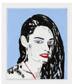
Tobias Kaspar Kristen Stewart (Classic), 2023 Acrylic paint on canvas 24 × 20 × 2.5 cm (9 1/2 × 7 7/8 × 1 inches)