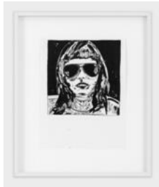
Tobias Kaspar Saint Laurent, 2020 Ink and acrylic on paper 26.8 × 34.4 cm (10 1/2 × 13 1/2 inches) 51 × 42.5 × 3 cm (20 1/8 × 16 3/4 × 1 1/8 inches) (framed)