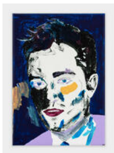
Tobias Kaspar Robert Pattinson (Twilight Era), 2023 Acrylic paint on canvas 27 × 19 × 2 cm (10 5/8 × 7 1/2 × 3/4 inches)