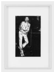
Tobias Kaspar David Zilber of Noma in Lanvin, 2020 Ink and acrylic on paper 24.7 × 40 cm (9 3/4 × 15 3/4 inches) 61.5 × 44.5 × 3 cm (24 1/4 × 17 1/2 × 1 1/8 inches) (framed)