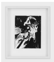
Tobias Kaspar Two Women, Two Hands, 2020 Ink and acrylic on paper 21 × 17 cm (8 1/4 × 6 3/4 inches) 33 × 28.5 × 3 cm (13 × 11 1/4 × 1 1/8 inches) (framed)