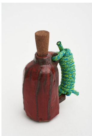
Karl Monies CXCV, 2020 Glazed ceramic, cork, rope 31 x 22 x 11 cm 12 1/4 x 8 5/8 x 4 3/8 in