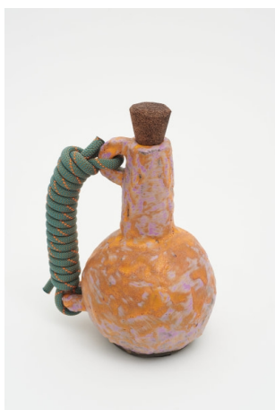
Karl Monies CCXCVIII, 2022 Glazed ceramic, cork, rope 28 x 25 x 18 cm 11 x 9 7/8 x 7 1/8 in