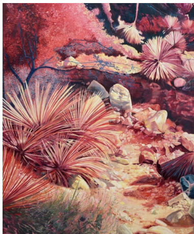
Melinda Braathen Light Builds, 2023 Oil on canvas 182.9 x 152.4 cm 72 x 60 in