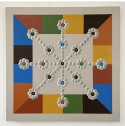
Fernanda Mello Congregação Do Interior / Inner Cluster, 2023 Acrylic on linen 30 (H) x 30 (W) in. 76.20 (H) x 76.20 (W) cm. FM0002