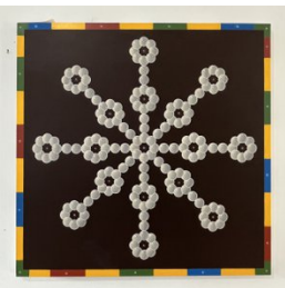
Fernanda Mello Sempre Voltando Ao Vazio / Always Returning to the Void, 2023 Acrylic on linen 30 (H) x 30 (W) in. 76.20 (H) x 76.20 (W) cm. FM0007