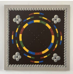
Fernanda Mello Pequenas Luzes / Little Lights, 2023 Acrylic on linen 30 (H) x 30 (W) in. 76.20 (H) x 76.20 (W) cm. FM0001