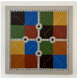
Fernanda Mello Sem Limites / The On and On-ness, 2023 Acrylic on linen 30 (H) x 30 (W) in. 76.20 (H) x 76.20 (W) cm. FM0004