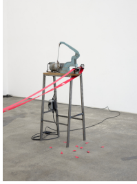
Runo Lagomarsino The Persistent Action of a Falling Tear , 2023 Mechanical puncher, motors, metal structure, vinyl and paper (Inv# RLa 23 004)