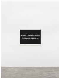
Runo Lagomarsino We didn't cross the border, the border crossed us , 2023 Silkscreen print on handpainted background, cuts Paper Dimensions: 70 x 100 cm (27,56 x 39,37 in) Framed Dimensions: 75 x 105 cm (29,53 x 41,34 in) Edition #1/3, 1AP (Inv# RLa 23 001.1)