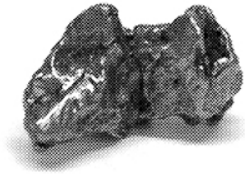
Tektite (from Greek τηκτός "tēktos", molten), natural glass formed from terrestrial debris ejected during extraterrestrial impacts.