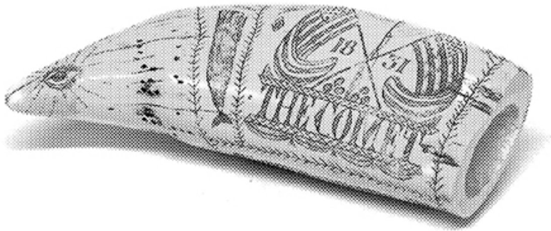
"The Comet" scrimshaw whale tooth resin replica, by Juratone Ltd, England. Patriotic device: USA flags, harpoon, 6 cannonballs, labeled "THE COMET," dated 1831; a spouting sperm whale, harpoons; mystic eye at point; signed "D. Hart."