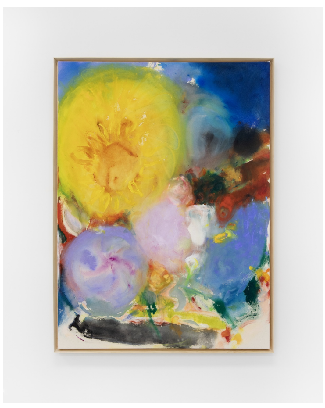
Scott Treleaven Pan's People, 2022 Acrylic, gouache, water soluble pastel 48 x 36 in (121.9 x 91.4 cm) S.T0088