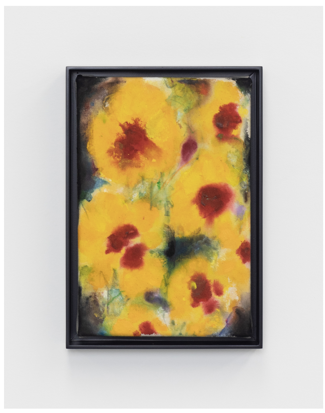
Scott Treleaven Untitled (coreopses 2), 2023 Gouache, acrylic, water-soluble pastel on canvas 9 x 6 in (22.9 x 15.2 cm) S.T0096