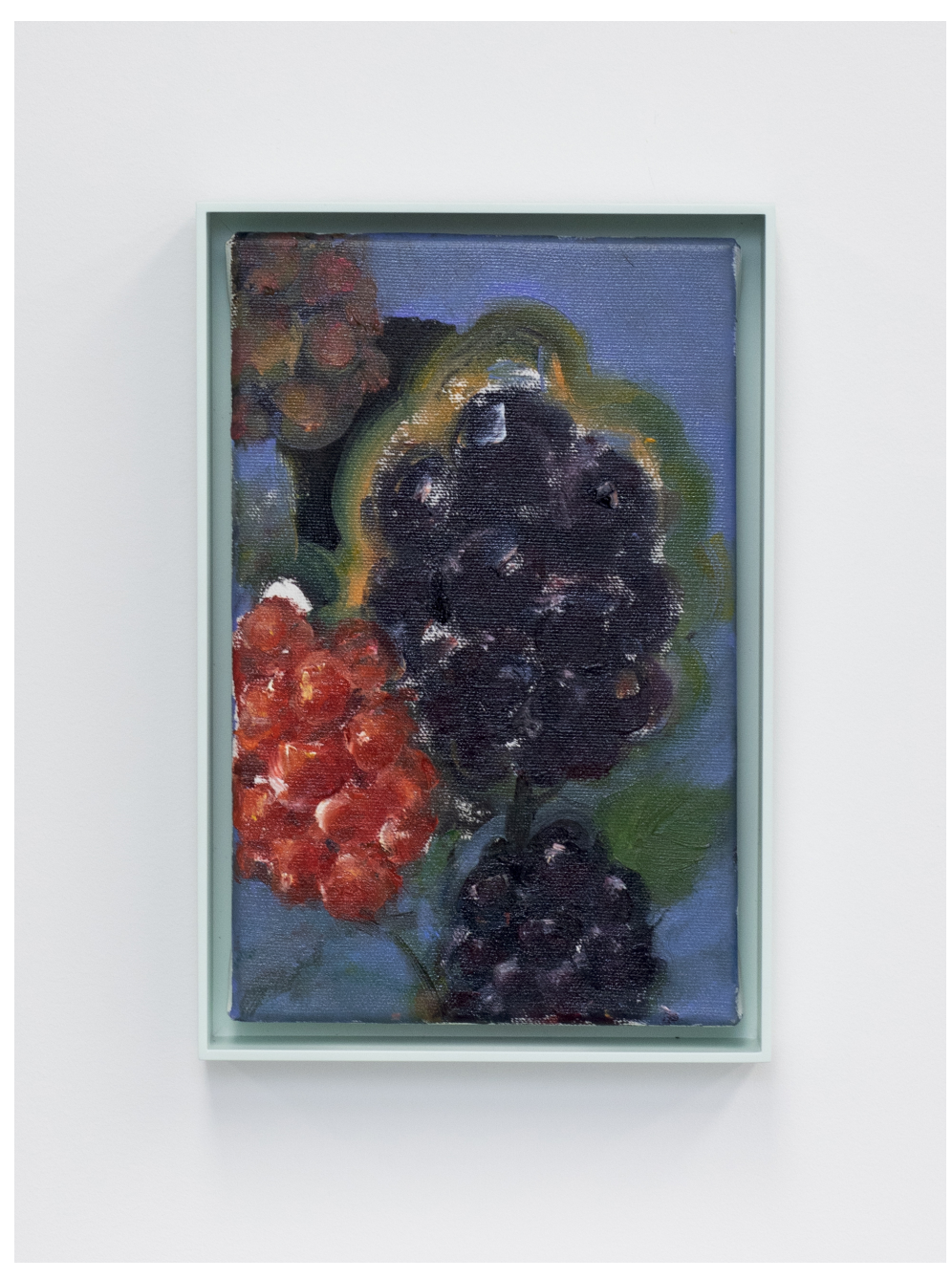
Scott Treleaven Little Gods Again, 2023 Oil on canvas 9 x 6 in (22.9 x 15.2 cm) S.T0091