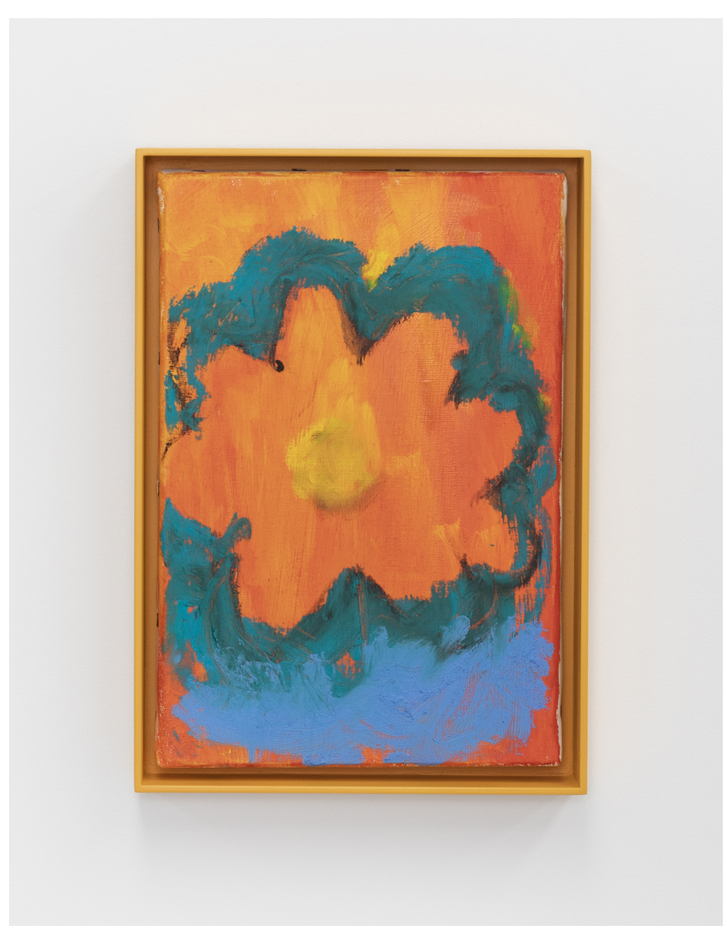
Scott Treleaven Untitled (sky), 2022 Oil on canvas 9.25 x 6.25 in (23.5 x 15.9 cm) S.T0093