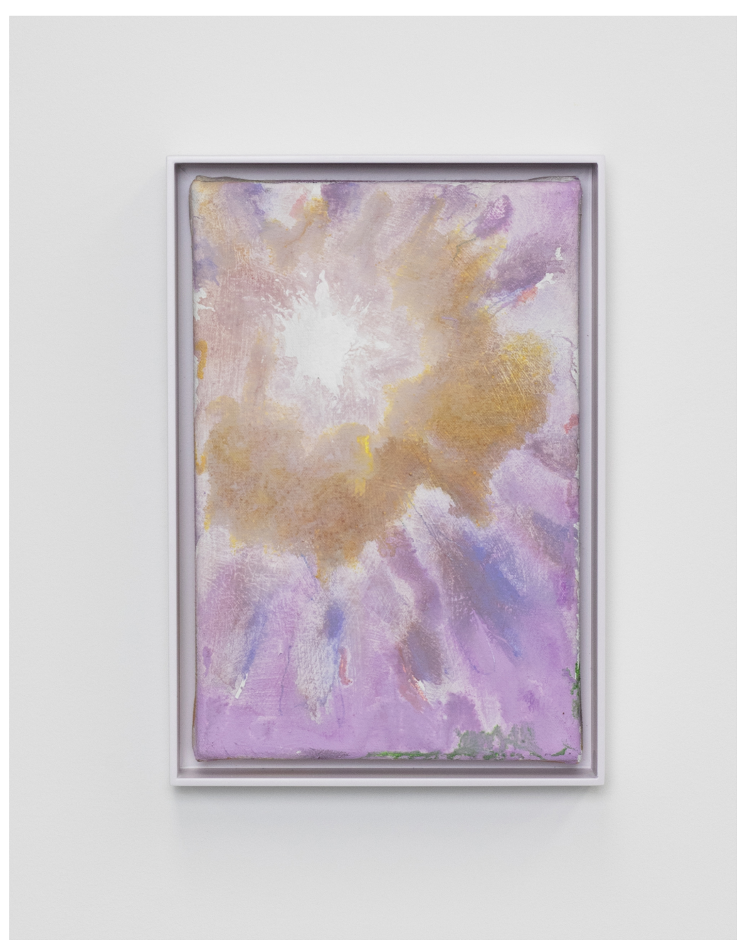
Scott Treleaven Untitled (ipomoea), 2022 Gouache, acrylic, water-soluble pastel on canvas 9 x 6 in (22.9 x 15.2 cm) S.T0094