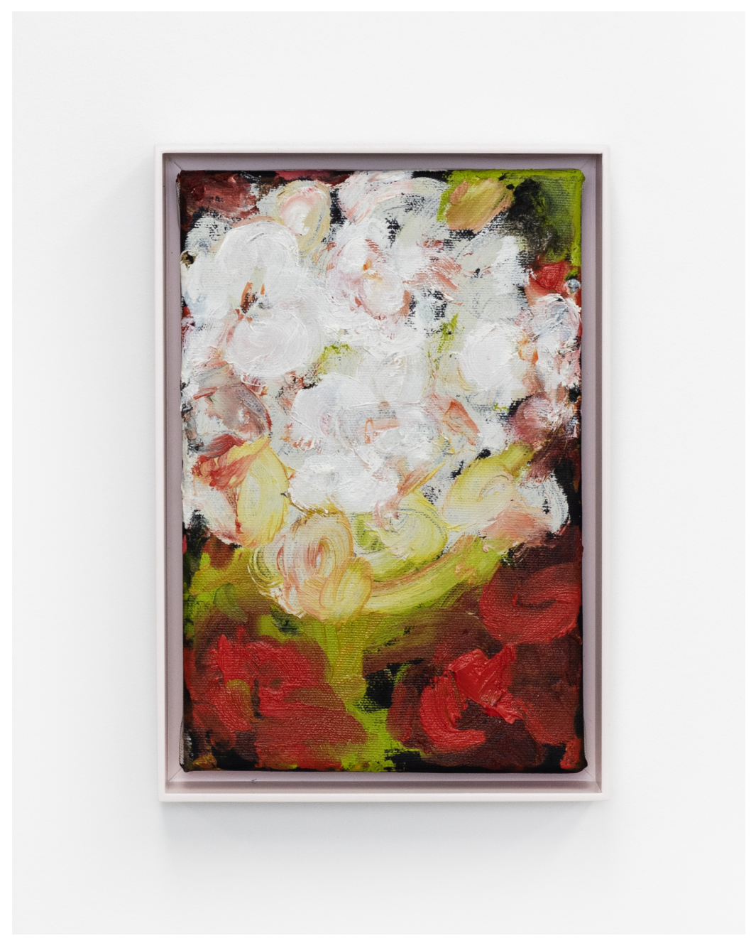
Scott Treleaven Untitled (geranium), 2023 Oil on canvas 9 x 6 in (22.9 x 15.2 cm) S.T0097