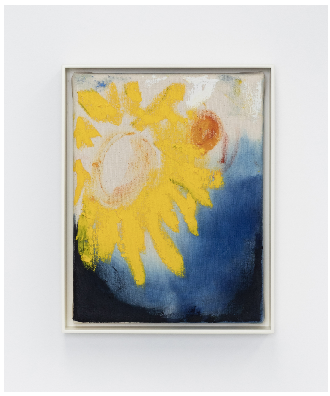
Scott Treleaven Untitled (Anteros), 2022 Oil on canvas 9 x 7 in (22.9 x 17.8 cm) S.T0095