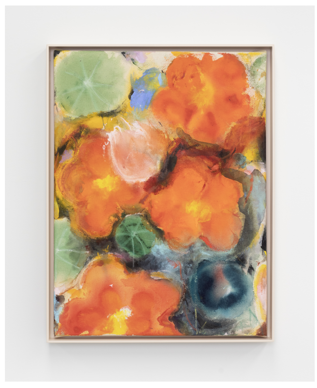
Scott Treleaven Starry Mire, 2022 Acrylic, gouache, oil, water-soluble pastel, fluorescent pigment, on canvas 16 x 12 in (40.6 x 30.5 cm) S.T0090