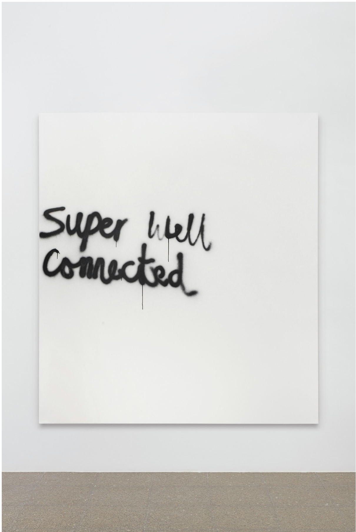
Super well connected, 2023

Lacquer on canvas. Laca sobre lienzo 200 x 180 cm RC.27