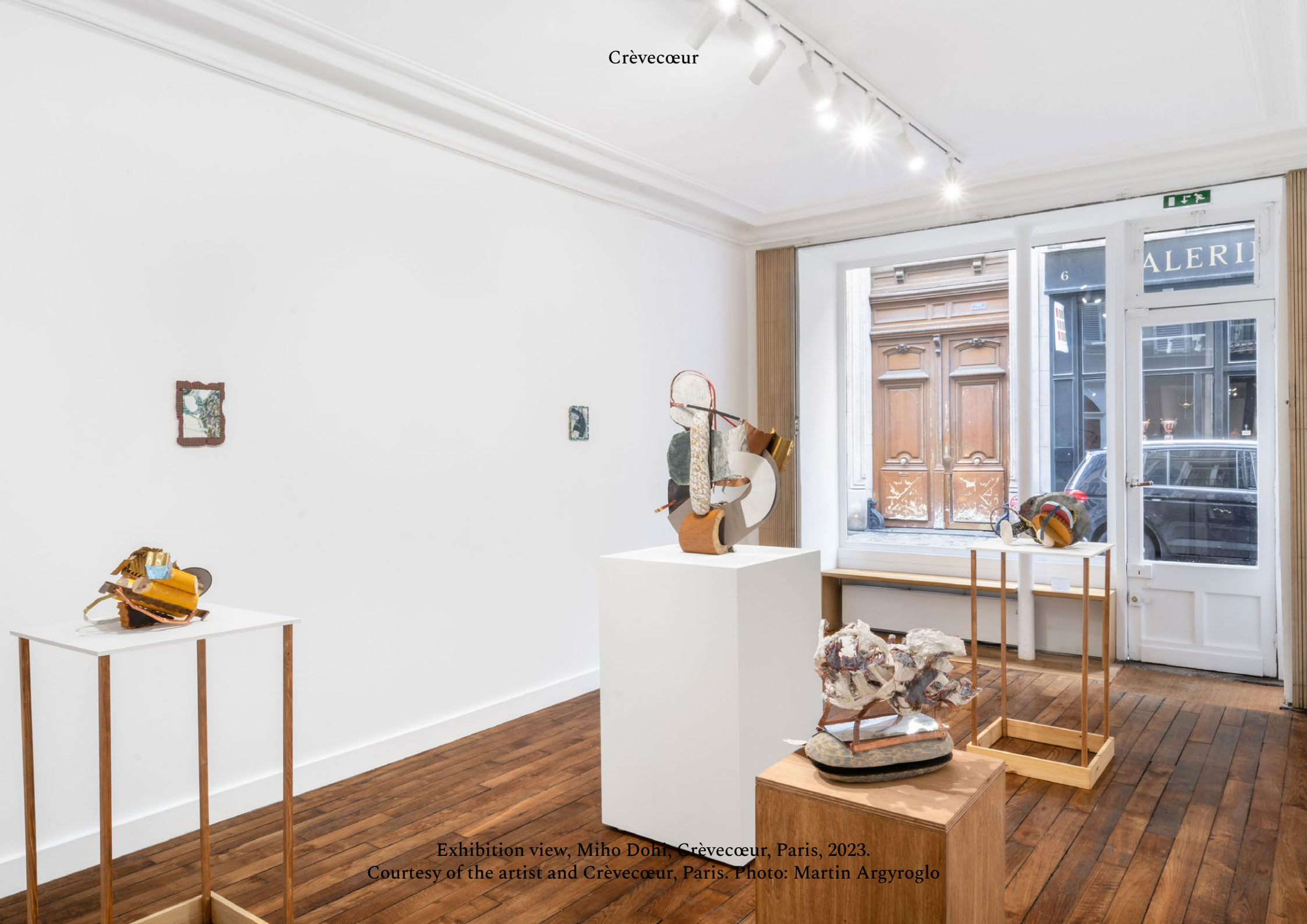
Exhibition view, Miho Dohi, Crèveœur, Paris, 2023.