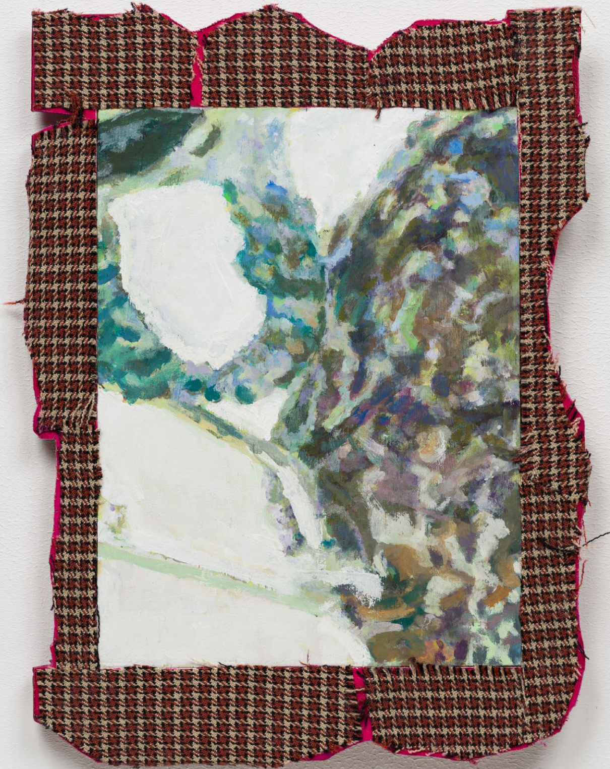
untitled 2, 2023 wood, acrylics and cloth, 21.5 × 17 cm