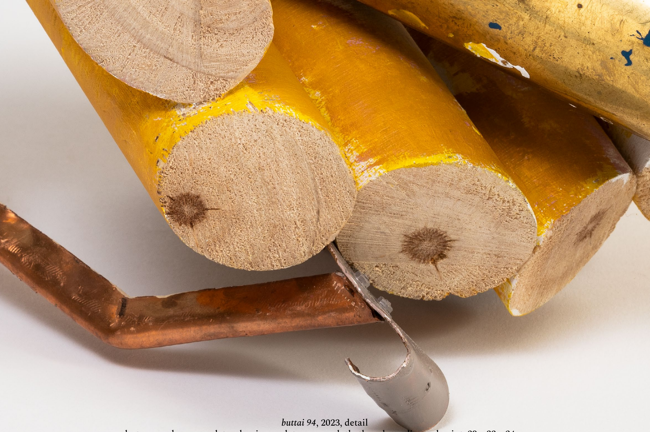
buttai 94, 2023, detail plaster, wood, copper plate, aluminum plate, paper, cloth, thread, acrylics and paint, 29 × 33 × 24 cm