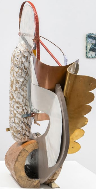
Exhibition view, Miho Dohi, Crèveœur, Paris, 2023.