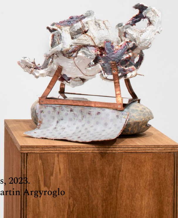
Exhibition view, Miho Dohi, Crèveœur, Paris, 2023.