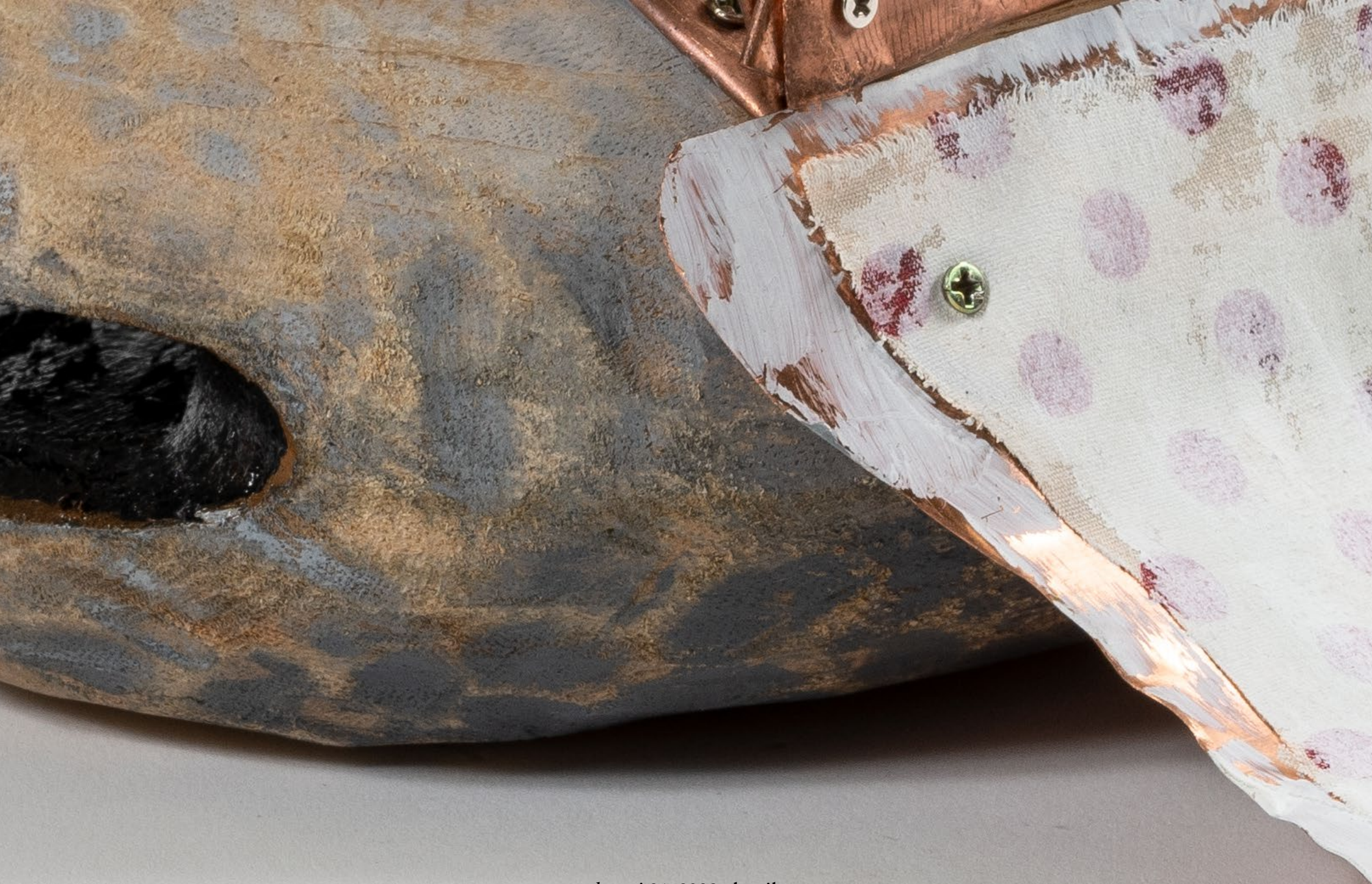
buttai 91 , 2022, detail plaster, wood, copper plate, aluminum plate, paper, cloth, thread, acrylics and paint, 29 × 33 × 24 cm