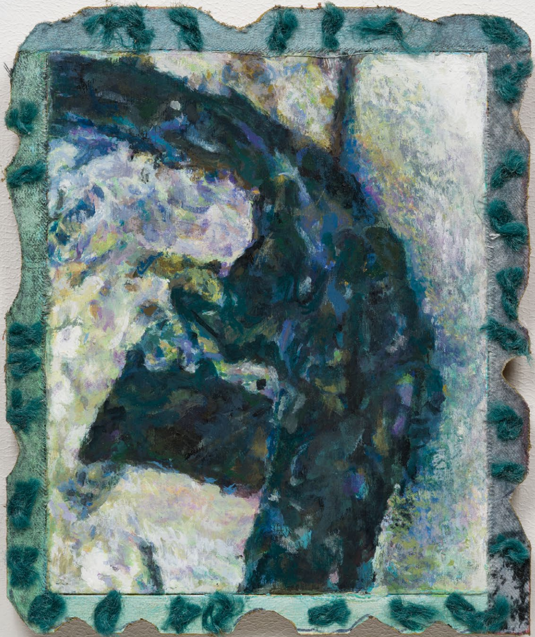
untitled 3, 2023 wood, acrylics and yarn, 19.2 × 16 cm