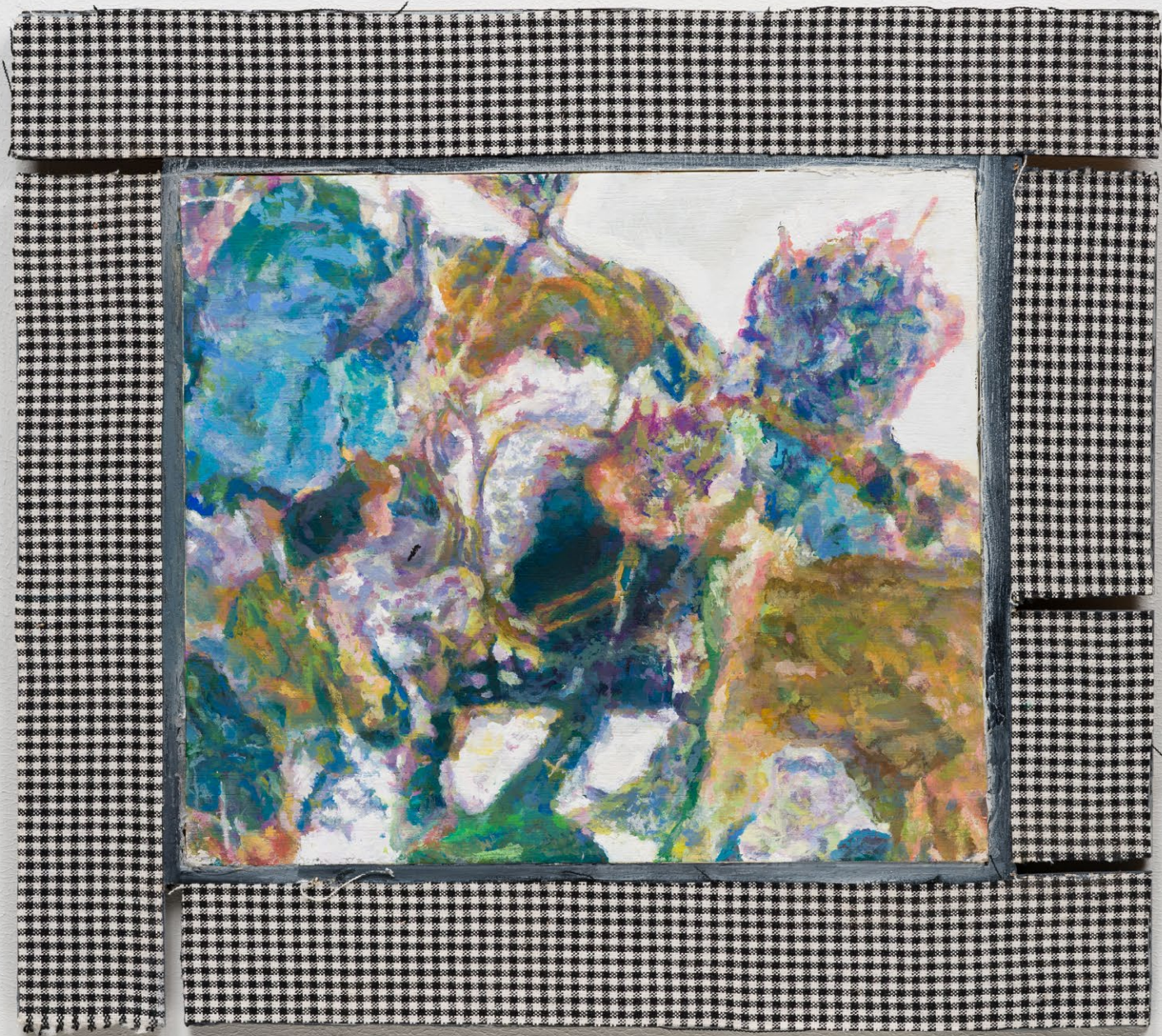
untitled 1, 2023 wood, acrylics and cloth, 29 × 32 cm Courtesy of the artist and Crèveœur, Paris.