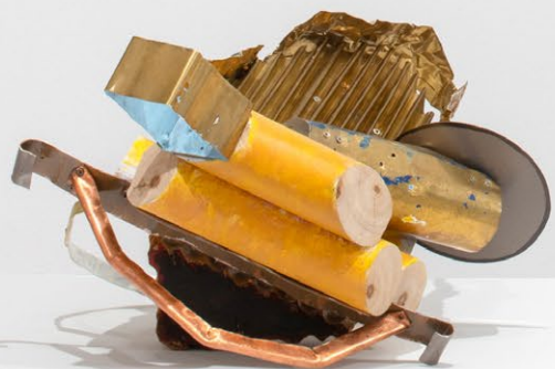
Exhibition view, Miho Dohi, Crèveœur, Paris, 2023. Courtesy of the artist and Crèveœur, Paris. Photo: Martin Argyroglo