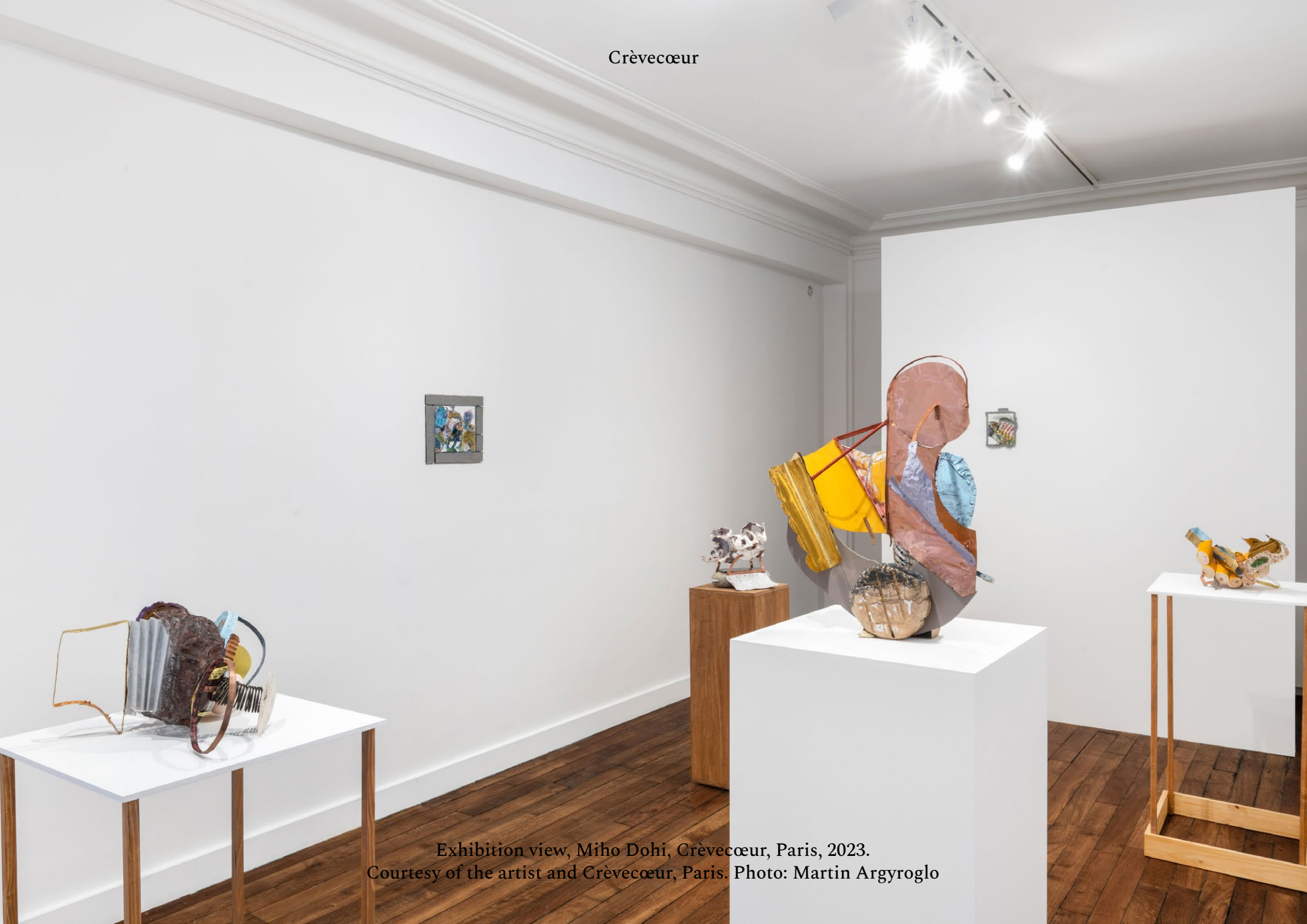
Exhibition view, Miho Dohi, Crèveœur, Paris, 2023.