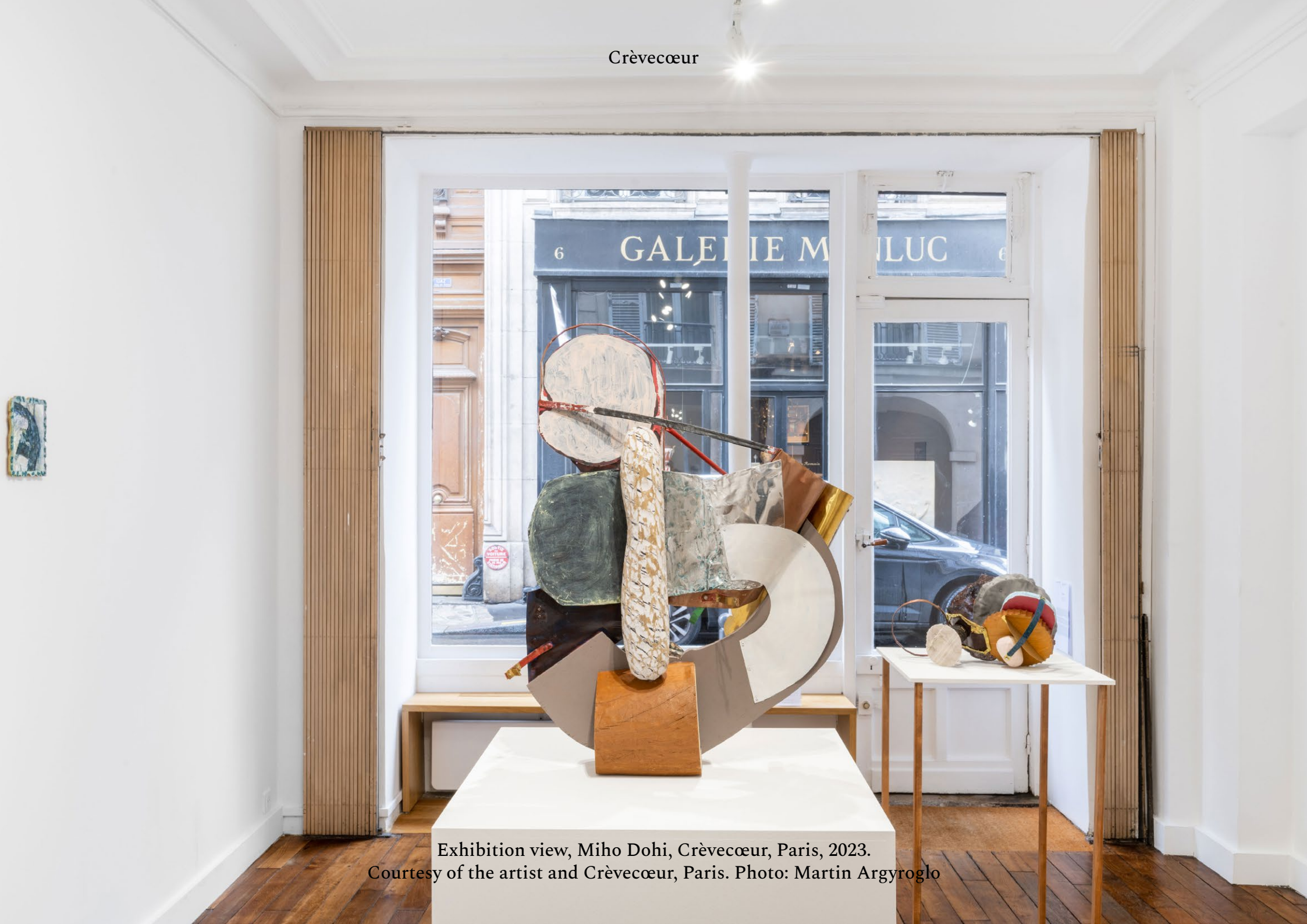
Exhibition view, Miho Dohi, Crèveœur, Paris, 2023.