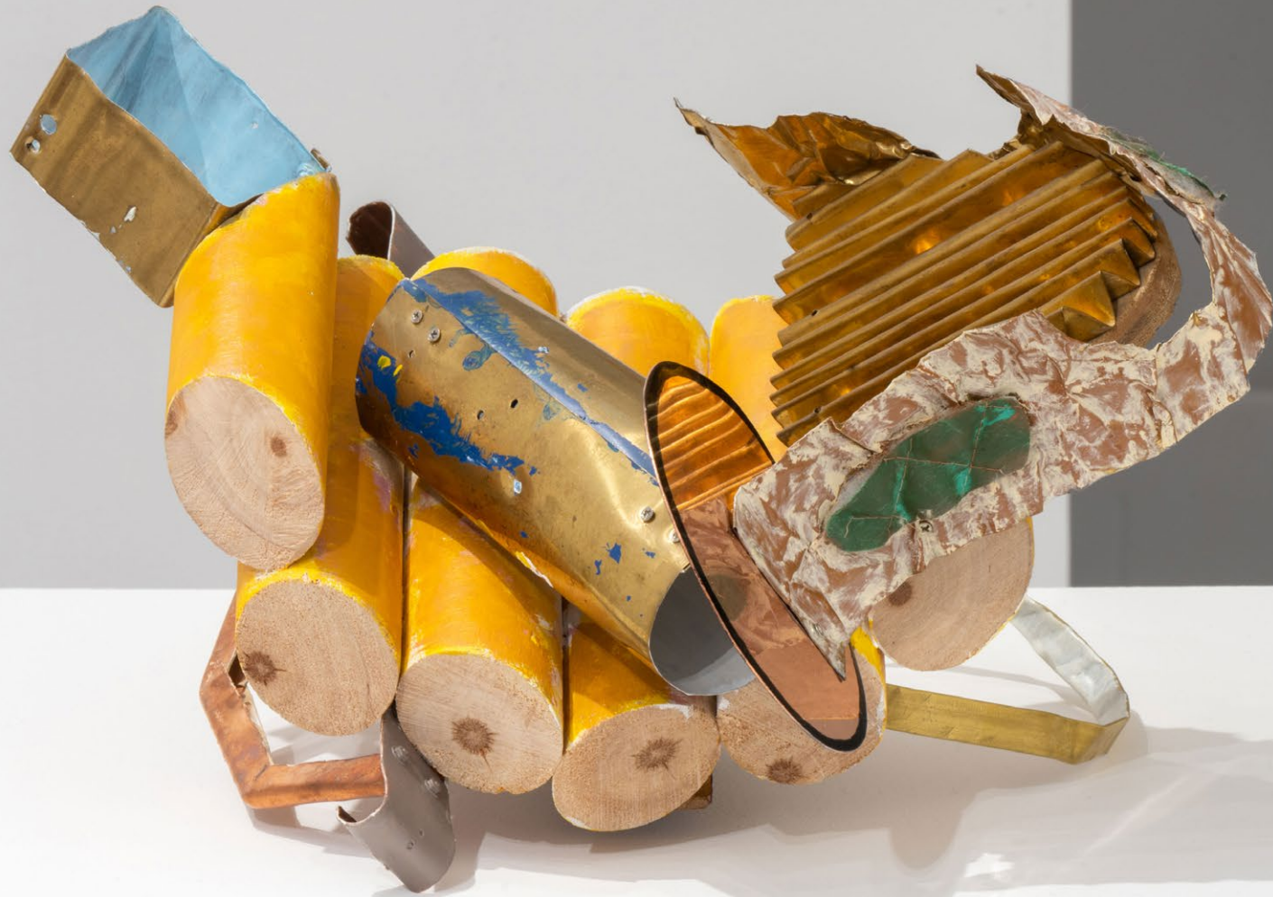
Exhibition view, Miho Dohi, Crèveœur, Paris, 2023.