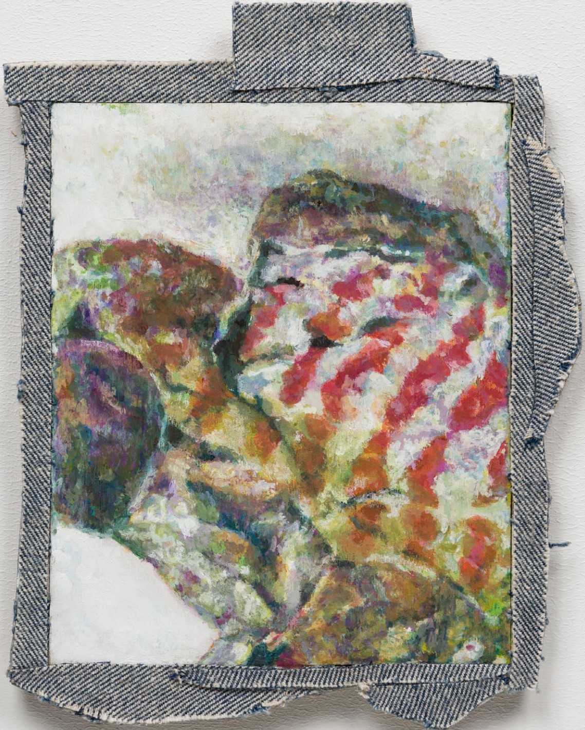
untitled 4, 2023 wood, acrylics and cloth, 21.5 × 17 cm