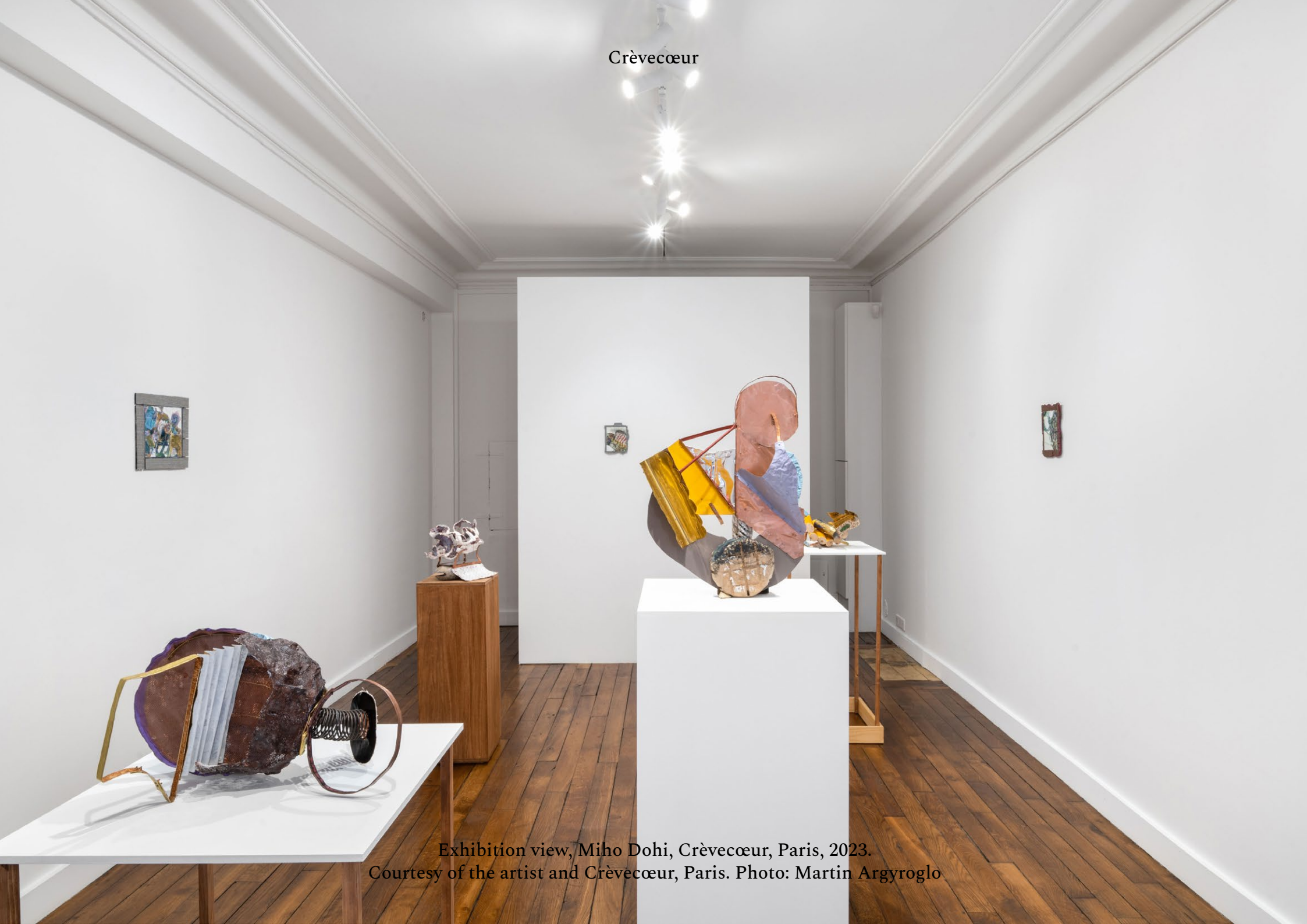
Exhibition view, Miho Dohi, Crèveœur, Paris, 2023.