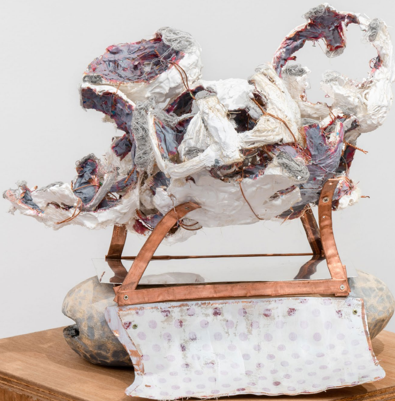
Exhibition view, Miho Dohi, Crèveœur, Paris, 2023.