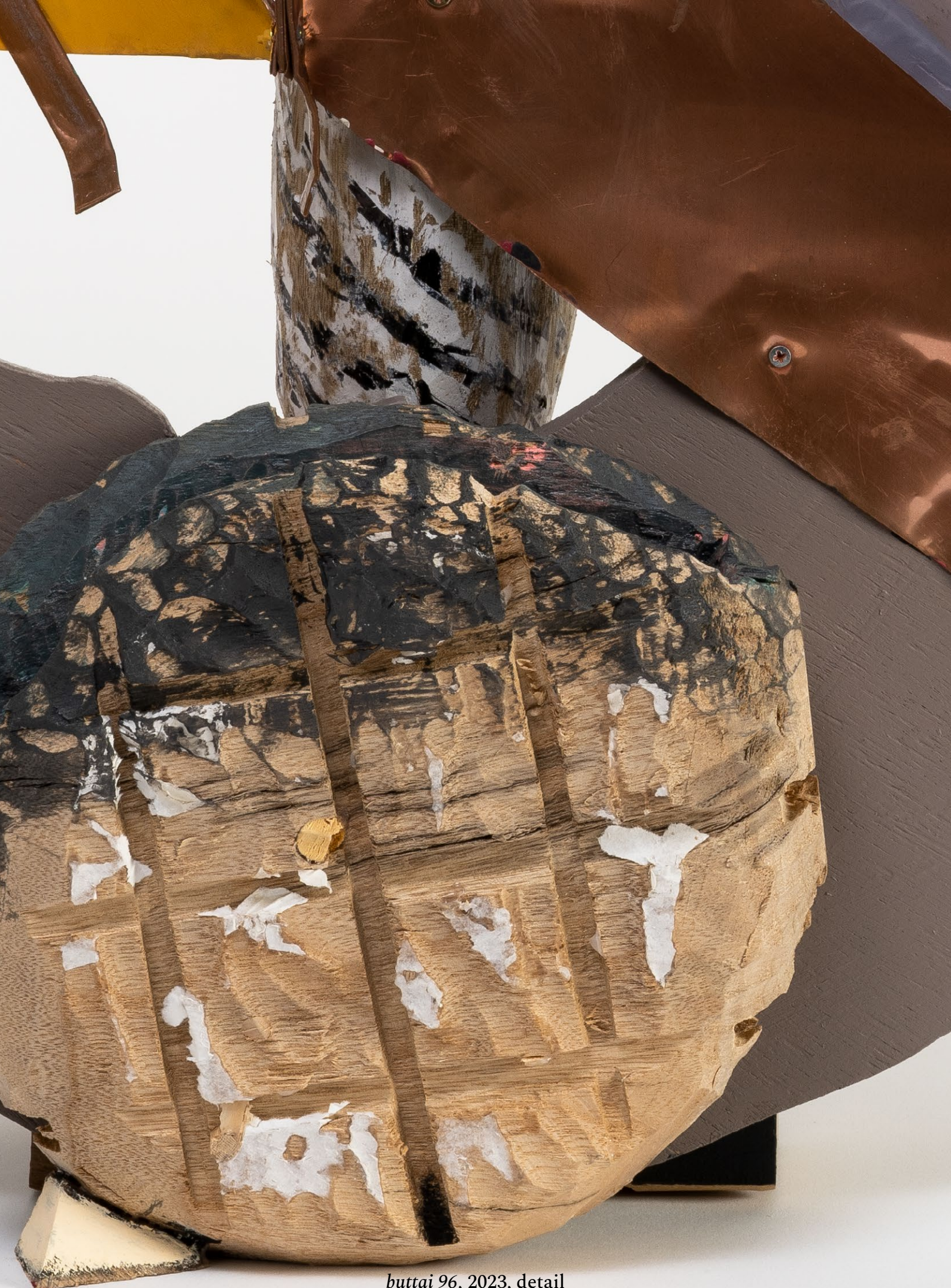
buttai 96, 2023, detail

plaster, wood, copper plate, aluminum plate, paper, cloth, thread, acrylics and paint, 29 × 33 × 24 cm