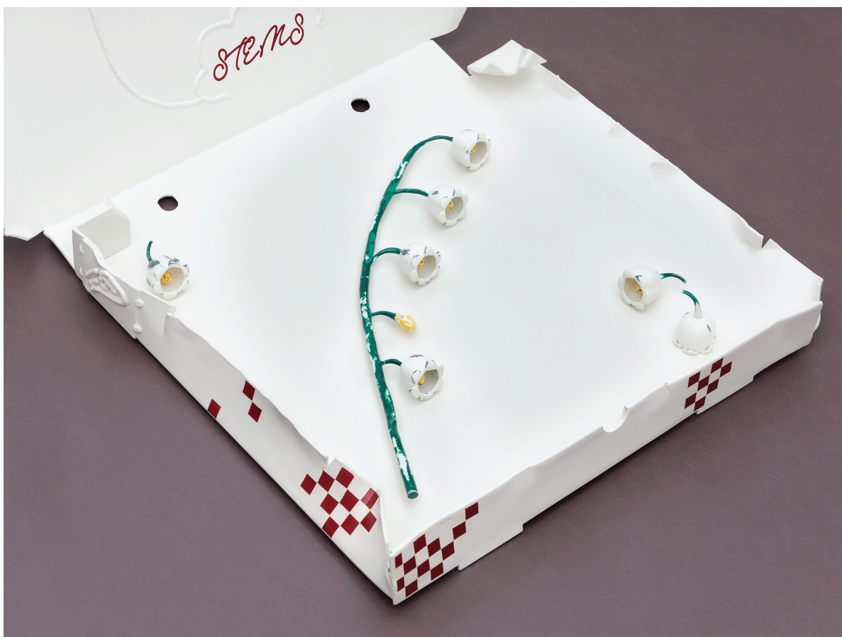
Magali Reus, What Grows (Cut Stems) , details, 2022, welded, forged and laser cut steel powder coated steel, welded, forged and laser cut mirror polished steel, machine and hand folded, welded, hammered, laser cut powder coated aluminium, 3D sculpted sand and binder agent, acrylic, 3D printed Nylon SLS, spray paint, wax, 47,5 x 57 x 75 cm (metal pizza box). Courtesy of the artist; The Approach, London; Fons Welters, Amsterdam and Galerie Greta Meert, Bruxelles. Photo: Eva Herzog.