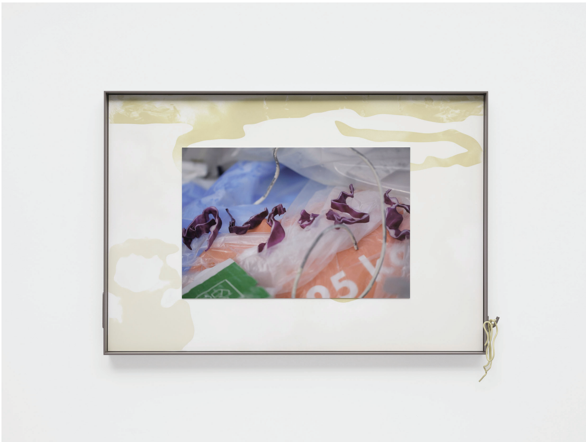
Magali Reus, Landings (August, Flotsam) , 2022, C-print mounted on aluminium, powder coated, hand waxed steel, welded and powder coated aluminium, powder coated aluminium bent wire, 78.5 x 104 x 6.5 cm.