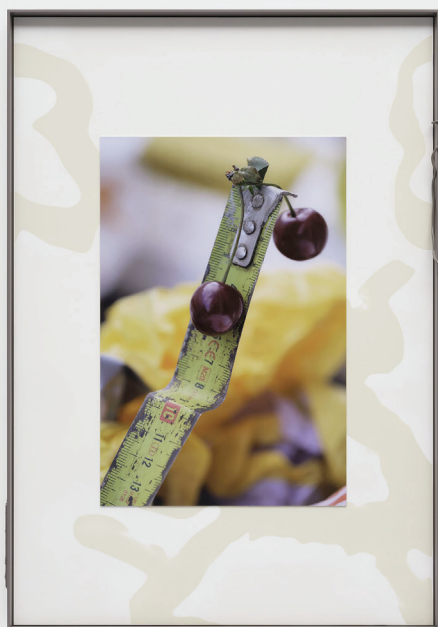
Magali Reus, Landings (68424, Drop) , 2022, C-print mounted on aluminium, powder coated, hand waxed steel, welded and powder coated aluminium, powder coated aluminium bent wire, 100 x 74.5 x 5.5 cm. Courtesy: the artist; The Approach, London; Fons Welters, Amsterdam and Galerie Greta Meert, Bruxelles. Photo: Eva Herzog.