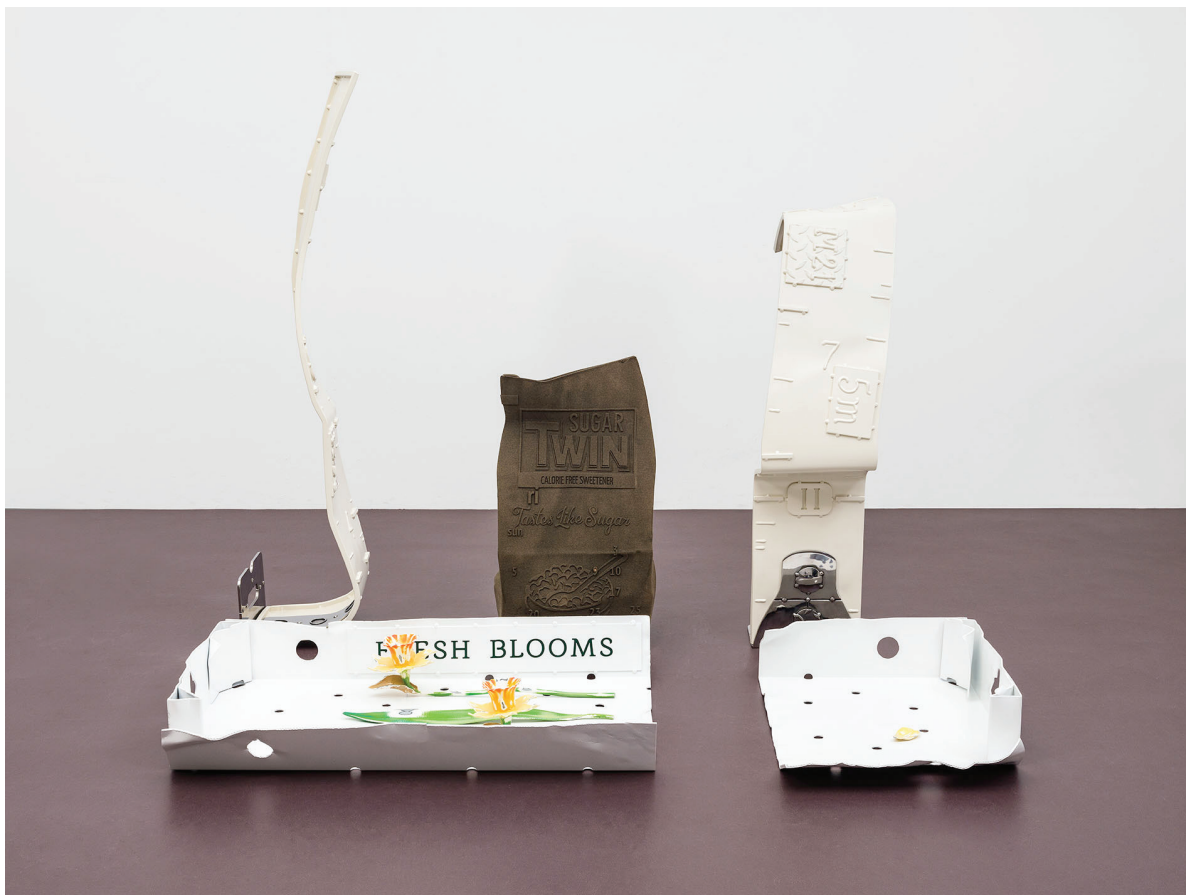
Magali Reus, What Grows (Fresh Blooms) , 2022, welded, forged and laser cut steel powder coated steel, welded, forged and laser cut mirror polished steel, machine and hand folded, welded, hammered, laser cut powder coated aluminium, 3D sculpted sand and binder agent, acrylic, 3D printed Nylon SLS, spray paint, wax, 117 x 150 x 101 cm.