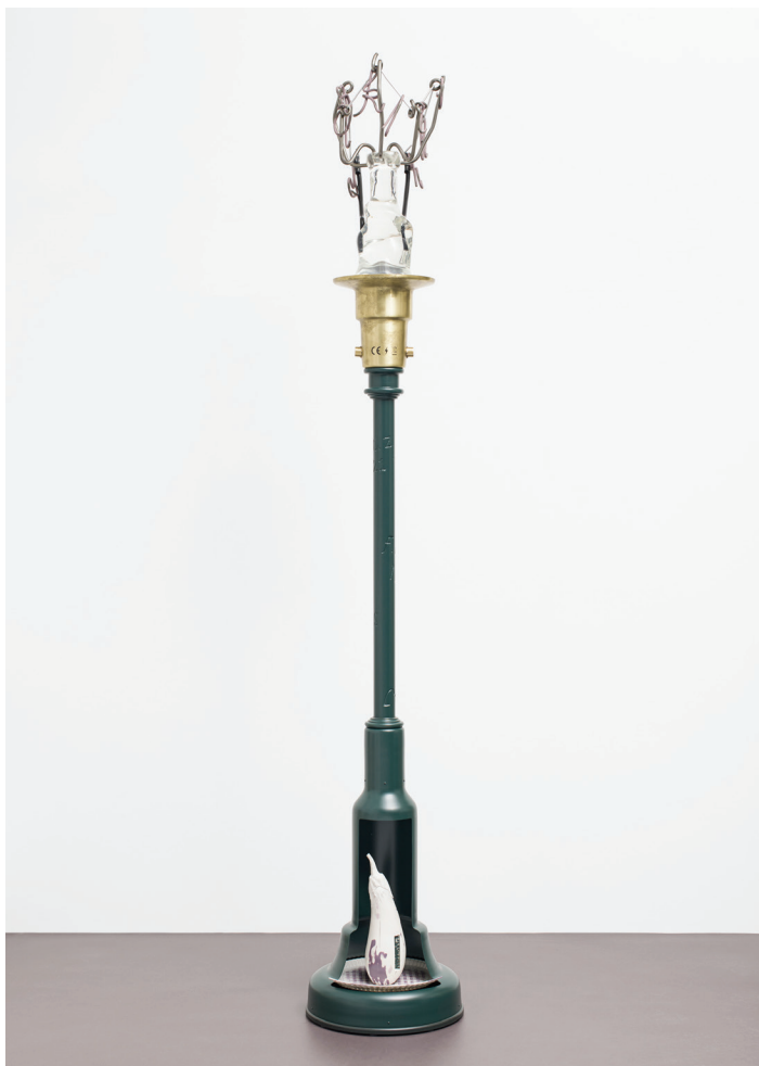
Magali Reus, Candlesticks (Blacklight Tamatar) , 2022, spun, welded and powder coated aluminium, hand-carved and powder coated aluminium extrusion, spun, welded and handpatinated brass, dry transfer, sand cast powder coated aluminium, cast Epoxy resin, polished and powder coated forged steel bar, aluminium wire, 3D printed Nylon SLS, EVA plaster filler mix, pigments, sprayed MDF, screws, 304 x 50 x 50 cm. Courtesy: the artist; The Approach, London; Fons Welters, Amsterdam and Galerie Greta Meert, Bruxelles. Photograph: Michal Brzezinski.