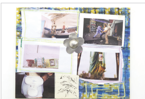
Image: Aurélien Potier, Loose Compass , Performance at CAPC museum of contemporary art, Bordeaux, 2022.