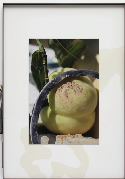
Magali Reus, Landings (2500.1, Blush) , 2022, C-print mounted on aluminium, powder coated, hand waxed steel, welded and powder coated aluminium, powder coated aluminium bent wire, tarpaulin, 100 x 73.5 x 6 cm. Courtesy: the artist; The Approach, London; Fons Welters, Amsterdam and Galerie Greta Meert, Bruxelles. Photograph: Eva Herzog.