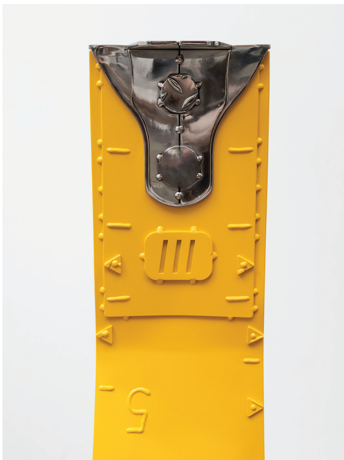
Magali Reus, What Grows (Red Roses) , detail, 2022, welded, forged and laser cut steel powder coated steel, welded, forged and laser cut mirror polished steel, machine and hand folded, welded, hammered, laser cut powder coated aluminium, 3D sculpted sand and binder agent, acrylic, 3D printed Nylon SLS, spray paint, wax, 57 x 120 x 23 cm (curved metal). Courtesy of the artist; The Approach, London; Fons Welters, Amsterdam and Galerie Greta Meert, Bruxelles. Photo: Eva Herzog.