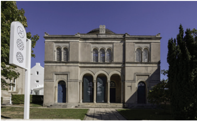
CAC - la synagogue de Delme.