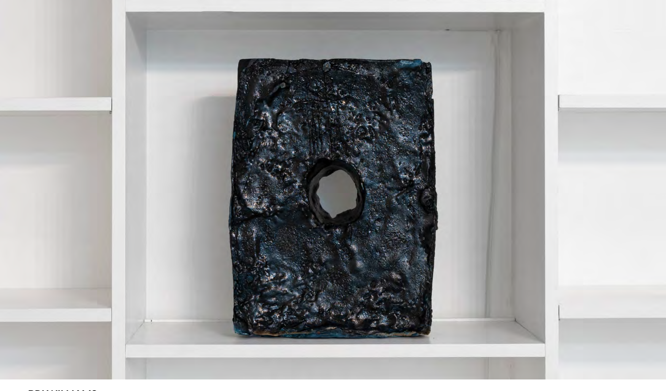
BRI WILLIAMS Solar Plexus, 2023 soap, wax, spray paint 48.5 x 36 x 7.5 cm