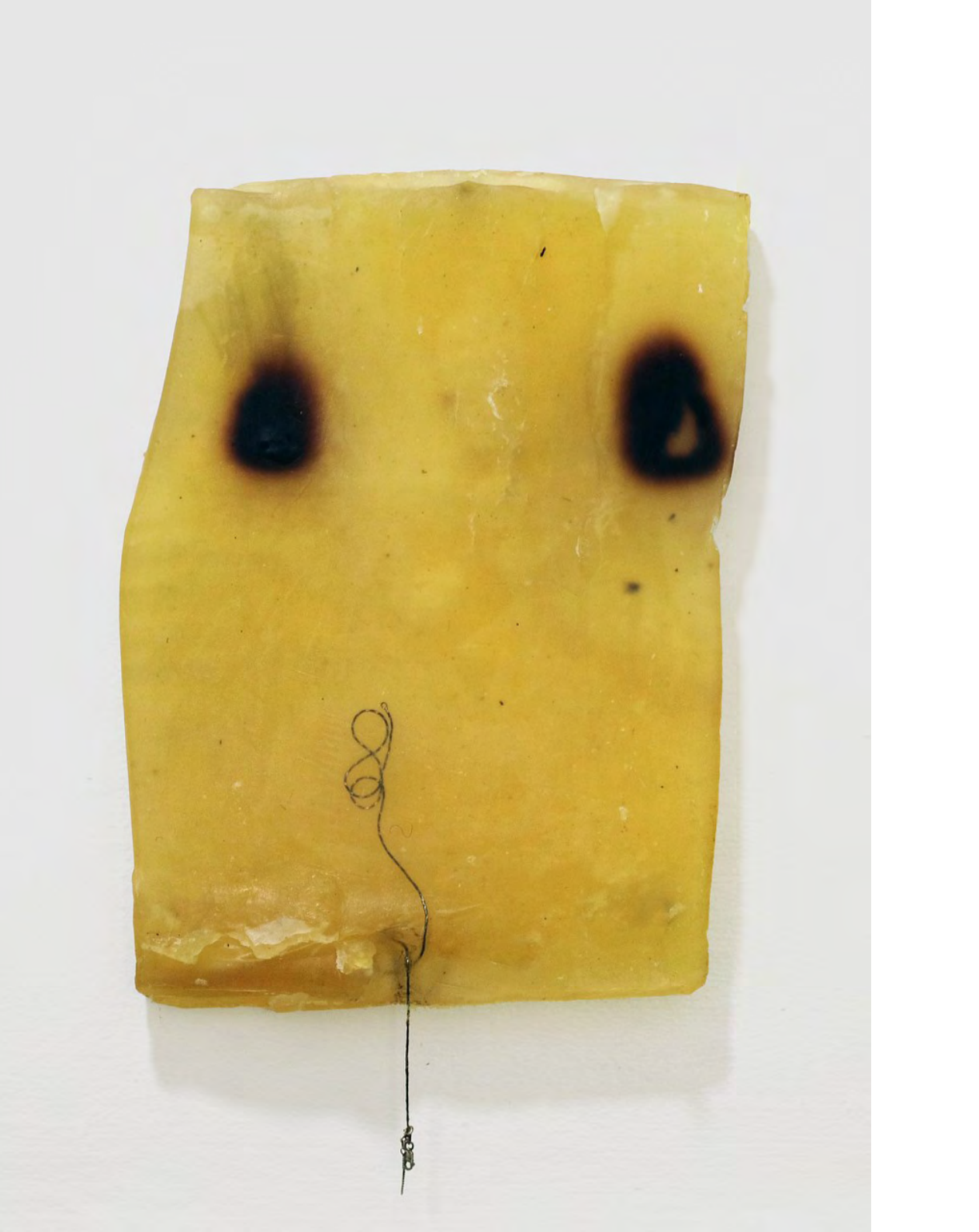
BRI WILLIAMS Torso, 2018 stained soap, necklace, resin 38.1 x 25.4 cm