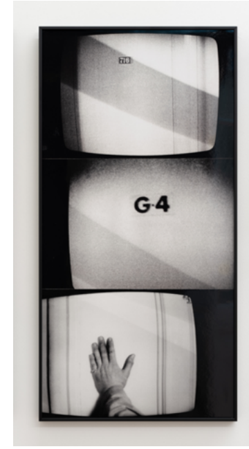
Nicole Gravier Telefilm Policiers, 1974 Gros Plans, U: N°1 - N°2 - N°3 C-print, 60 x 30 cm