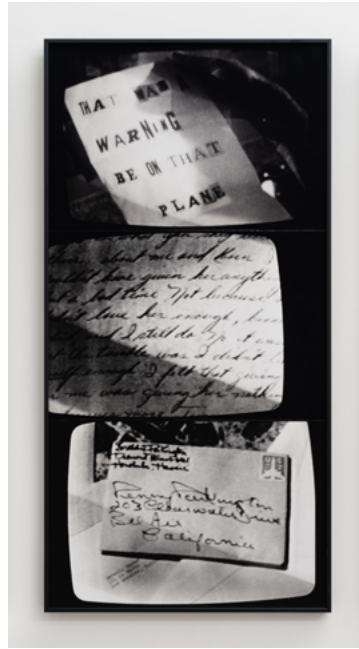
Nicole Gravier Telefilm Policiers, 1974 Gros Plans, J: N°1 - N°2 - N°3 C-print, 60 x 30 cm