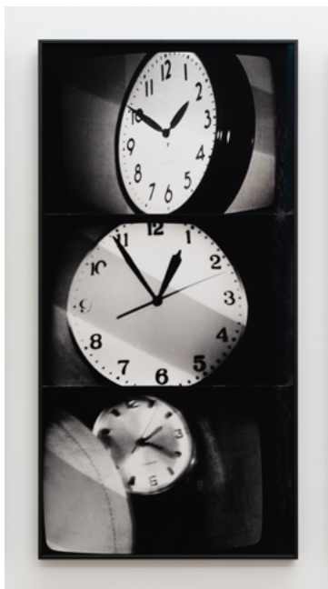
Nicole Gravier Telefilm Policiers, 1974 Gros Plans, A: N°1 - N°2 - N°3 C-print, 60 x 30 cm