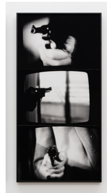
Nicole Gravier Telefilm Policiers, 1974 Gros Plans, S: N°1 - N°2 - N°3 C-print, 60 x 30 cm