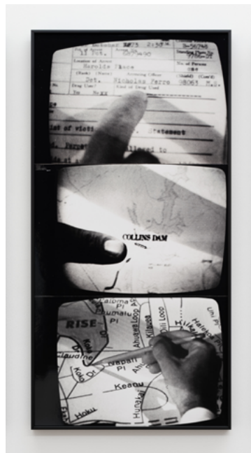
Nicole Gravier Telefilm Policiers, 1974 Gros Plans, T: N°1 - N°2 - N°3 C-print, 60 x 30 cm