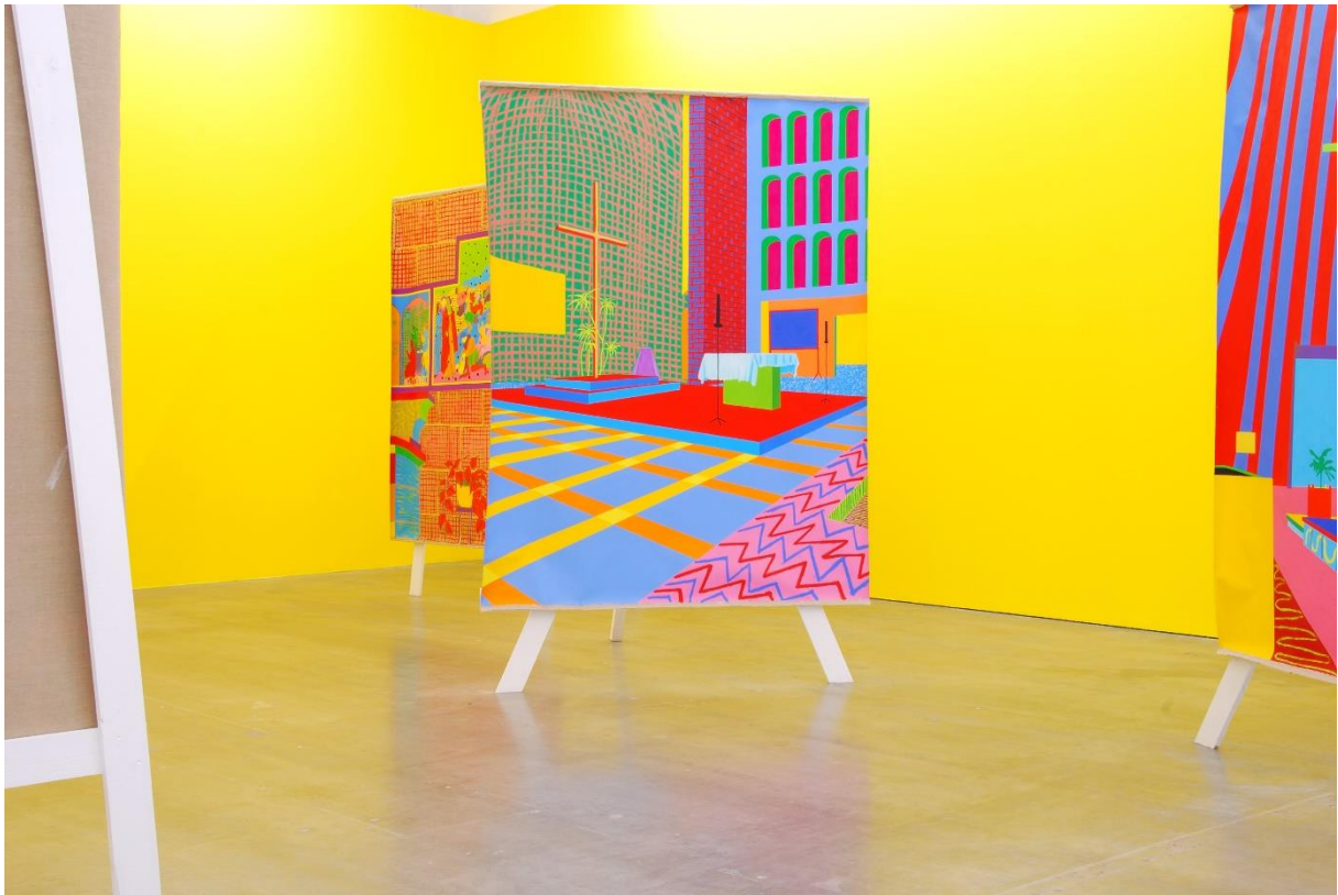
Leen Voet, 'Sint-Rita' in 'Un Scene III', Wiels, Brussels, 2015 © Leen Voet