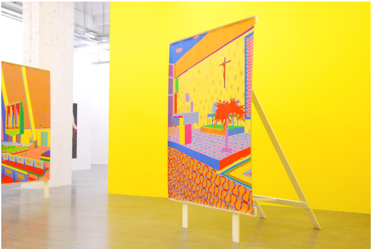
Leen Voet, 'Sint-Rita' in 'Un Scene III', Wiels, Brussels, 2015 © Leen Voet