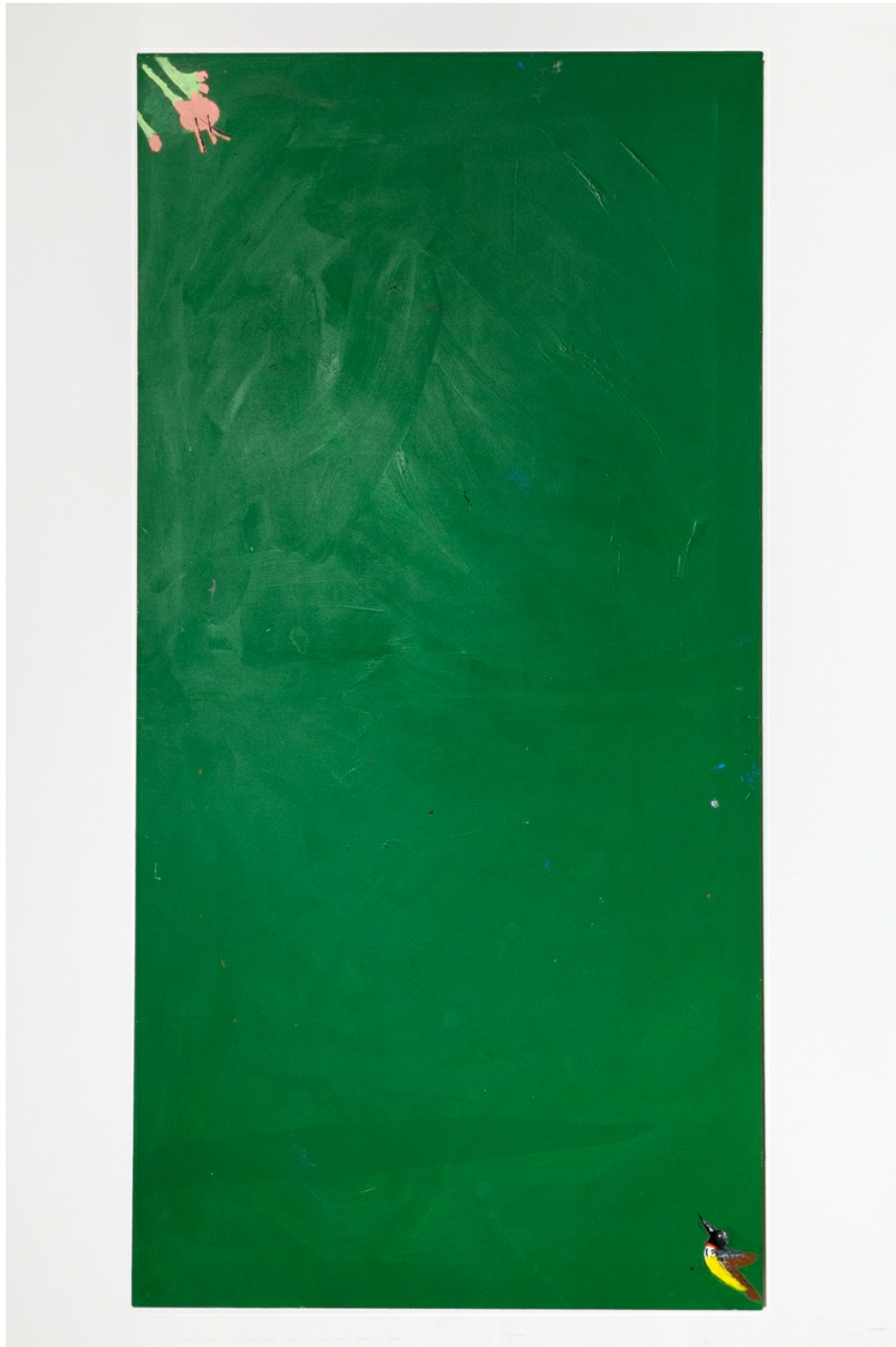
MATTHEW CHAMBERS An Implied Journey, 2023 Oil and acrylic on canvas 96 x 48 "