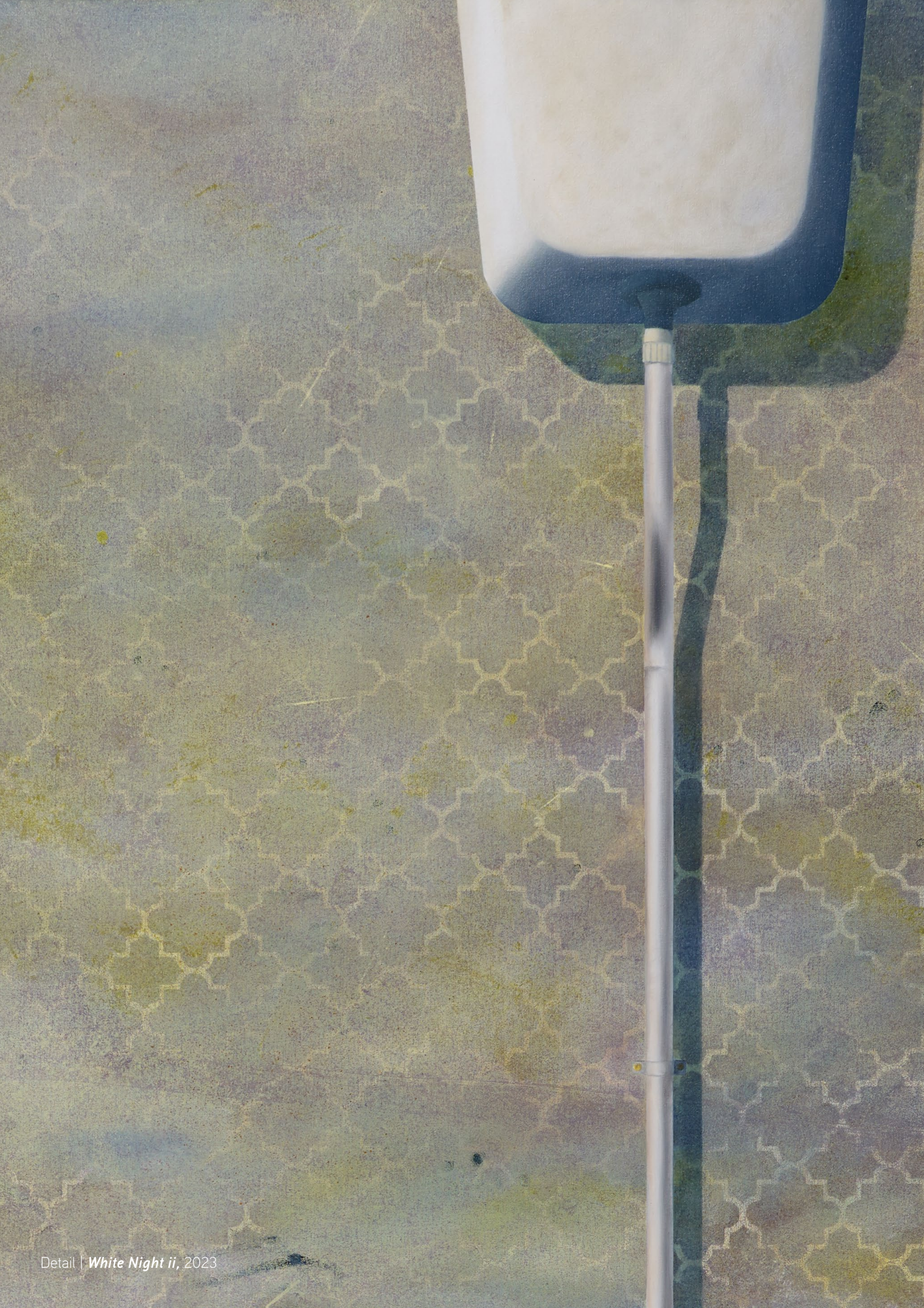
Detail | White Night ii , 2023