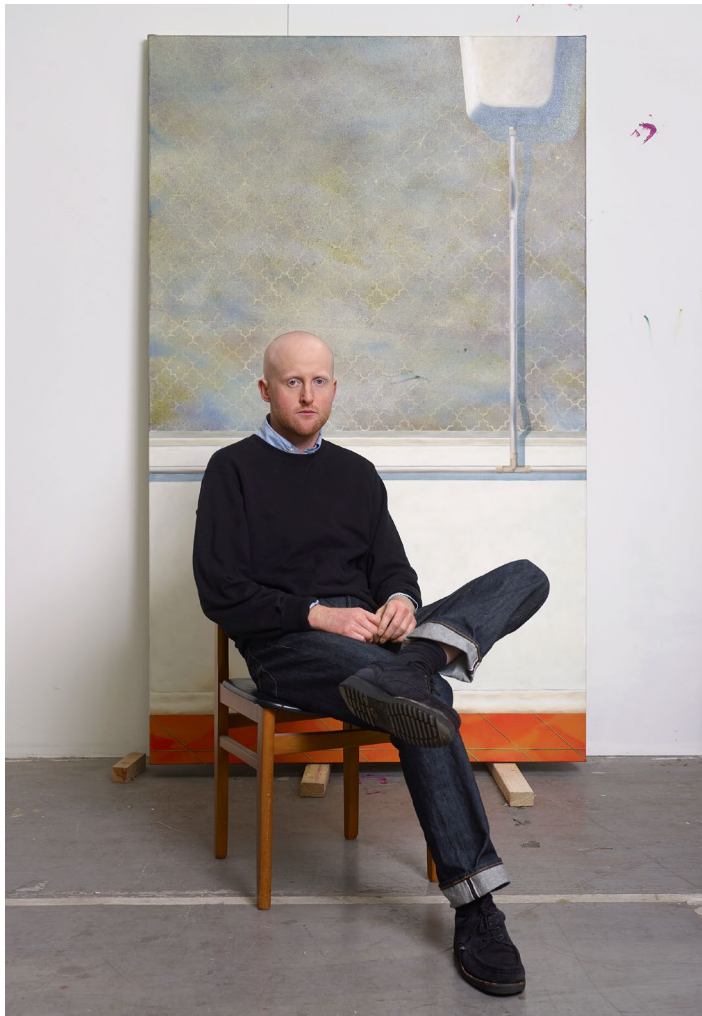
Portrait of the artist in his studio, 2023

Figures evade the viewer's gaze, emerging or fleeing from the picture plane altogether. As linear narrative has been avoided, our focus is drawn back to the handling of paint, which drifts from thick impastos to light taps and thin glazes. The material is often manipulated on the surface after application using a wide range of tools and techniques, building each image through the disparate properties of the medium, which navigate both economy and excess.