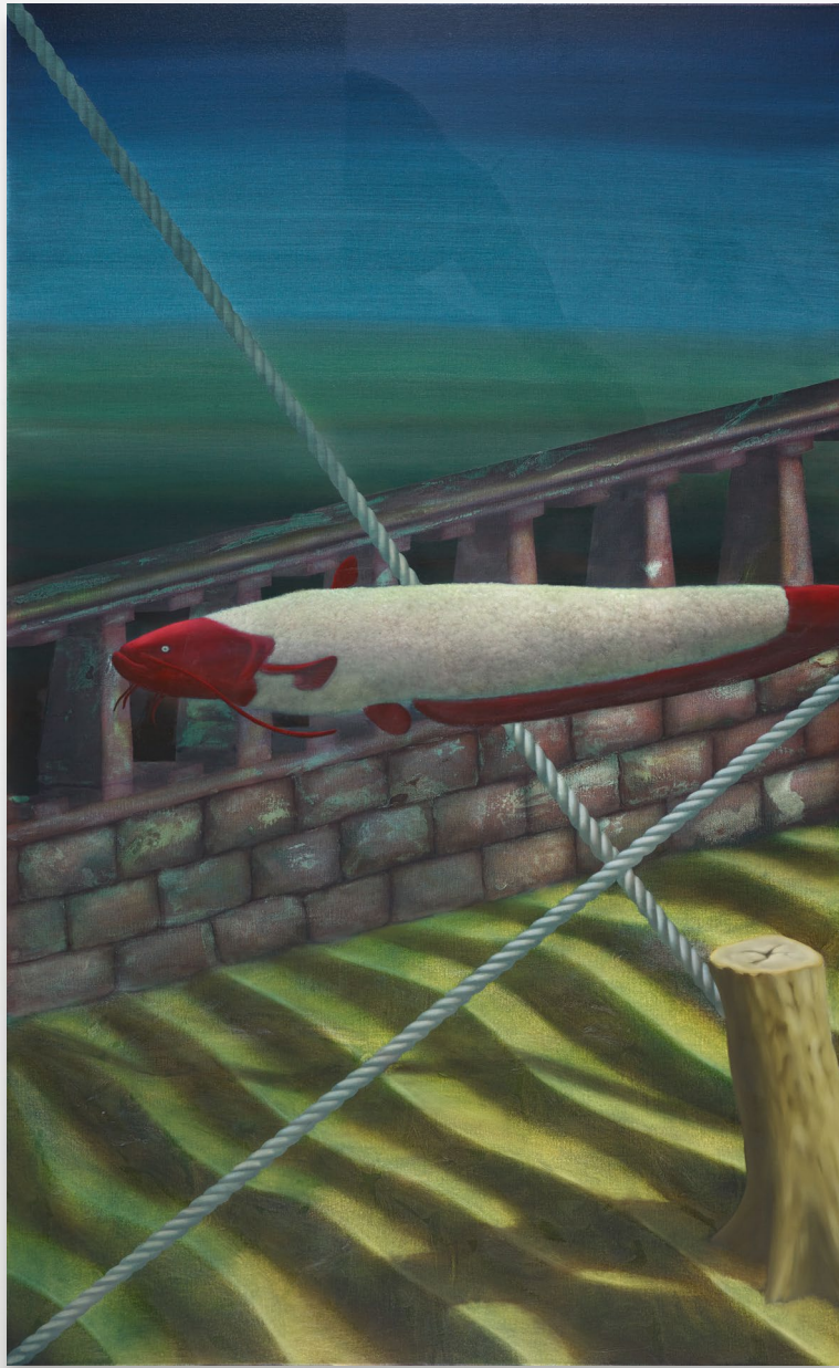
Abyssal Plain 2023

Oil on canvas 200 x 120 cm | 78 3/4 x 47 1/4 in