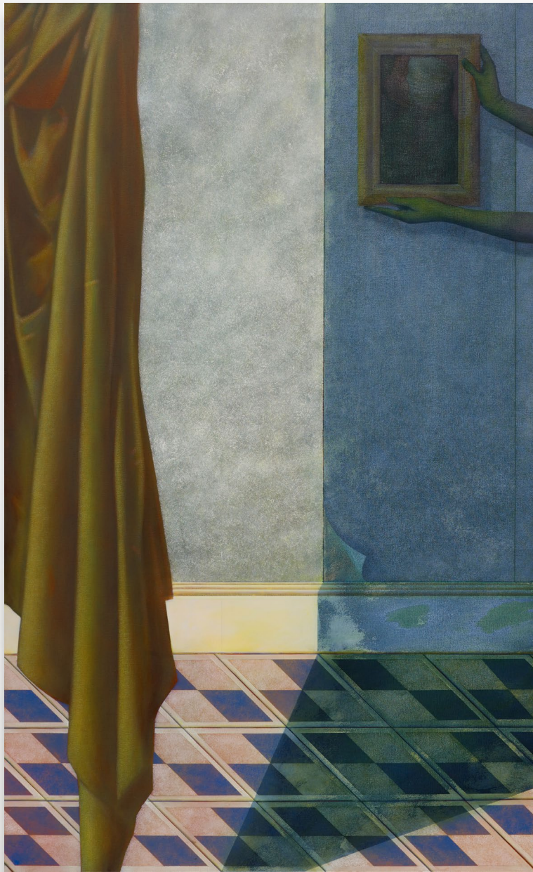
Contraption ii 2023

Oil on canvas 200 x 120 cm | 78 3/4 x 47 1/4 in