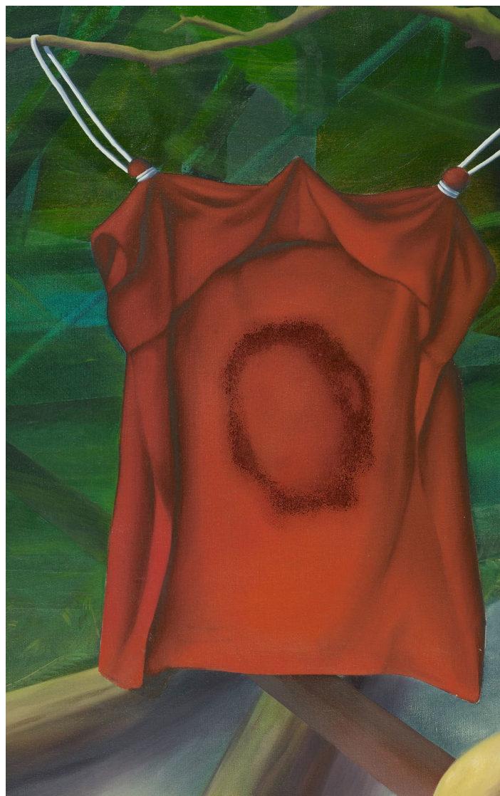
Detail | Prowler , 2023