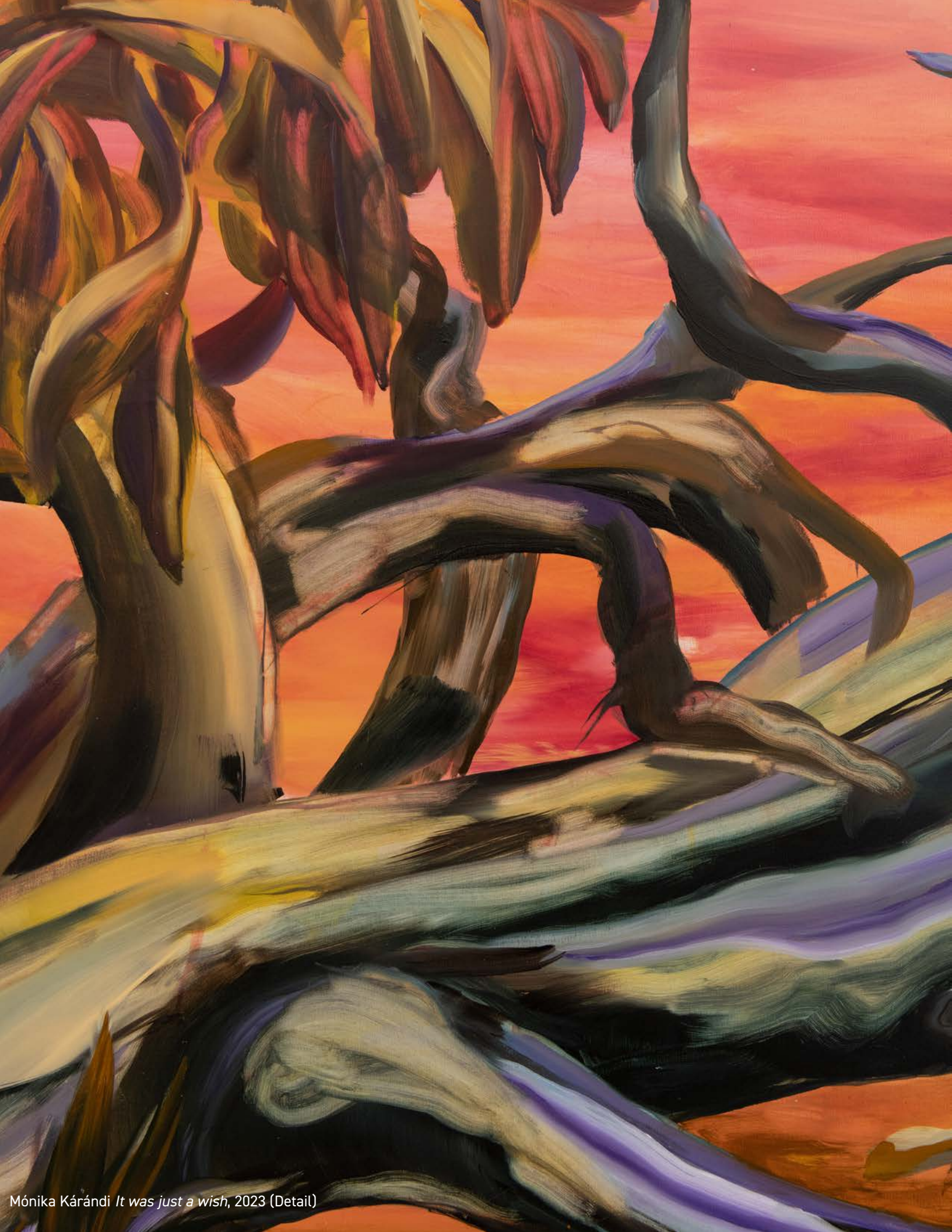
Mónika Kárándi It was just a wish , 2023 (Detail)