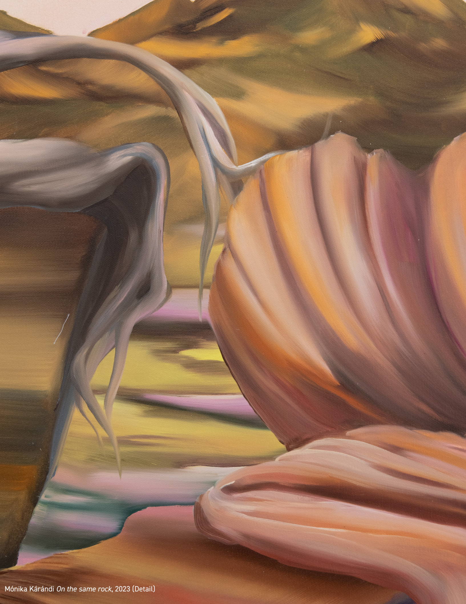
Mónika Kárándi On the same rock , 2023 (Detail)