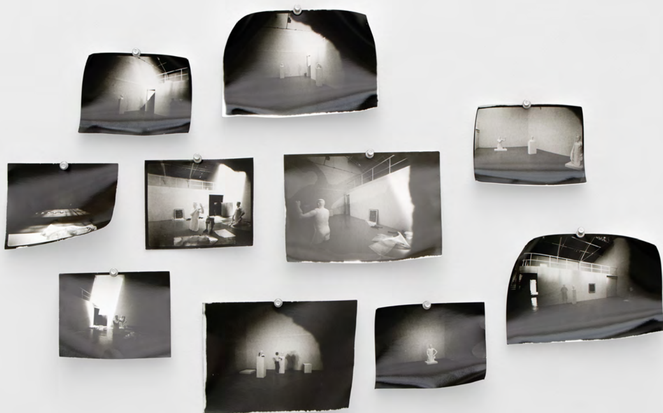
Ciprian Mureșan, Echoes of Sculpture , 2023, Installation view, Paris