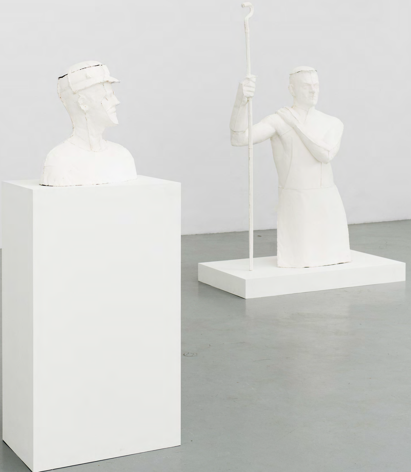
Ciprian Mureșan, Echoes of Sculpture , 2023, Installation view, Paris