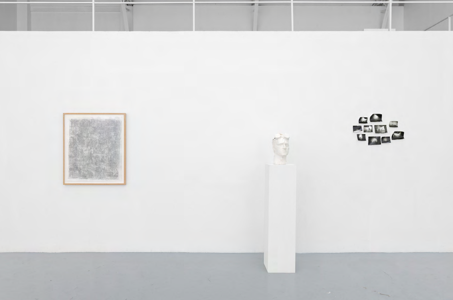
Ciprian Mureșan, Echoes of Sculpture , 2023, Installation view, Paris