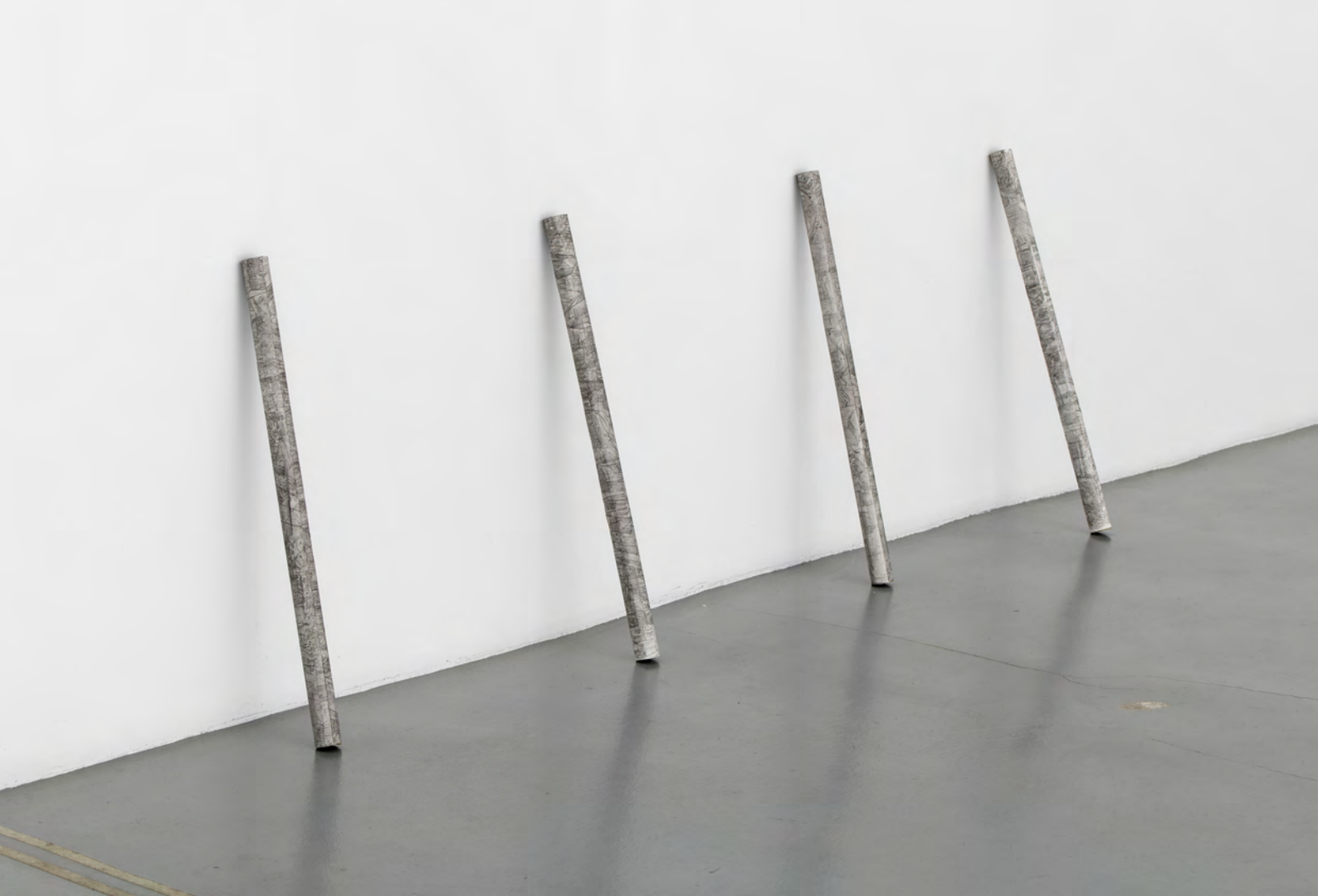
Untitled (for Cadere) 2023 4 cardboard bars with drawings 80 x 4 cm (31 1/2 x 1 1/2 in.) each one