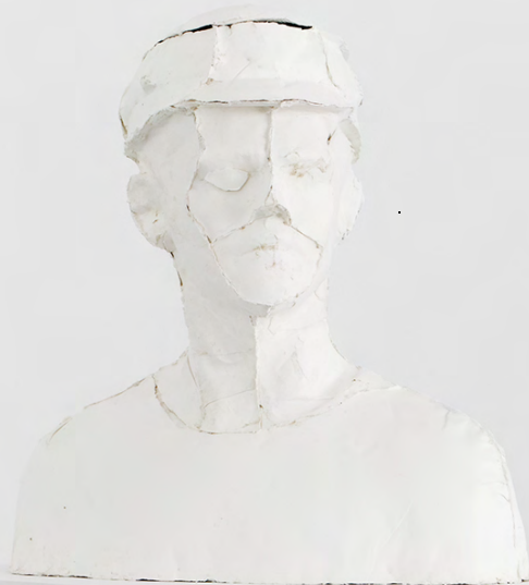
Echoes 5, 2023 Edition 2/3 + 2 AP Cotton paper, resin and pinhole camera Sculpture 65 x 65 x 30 cm (25 1/2 x 25 1/2 x 12 in.)