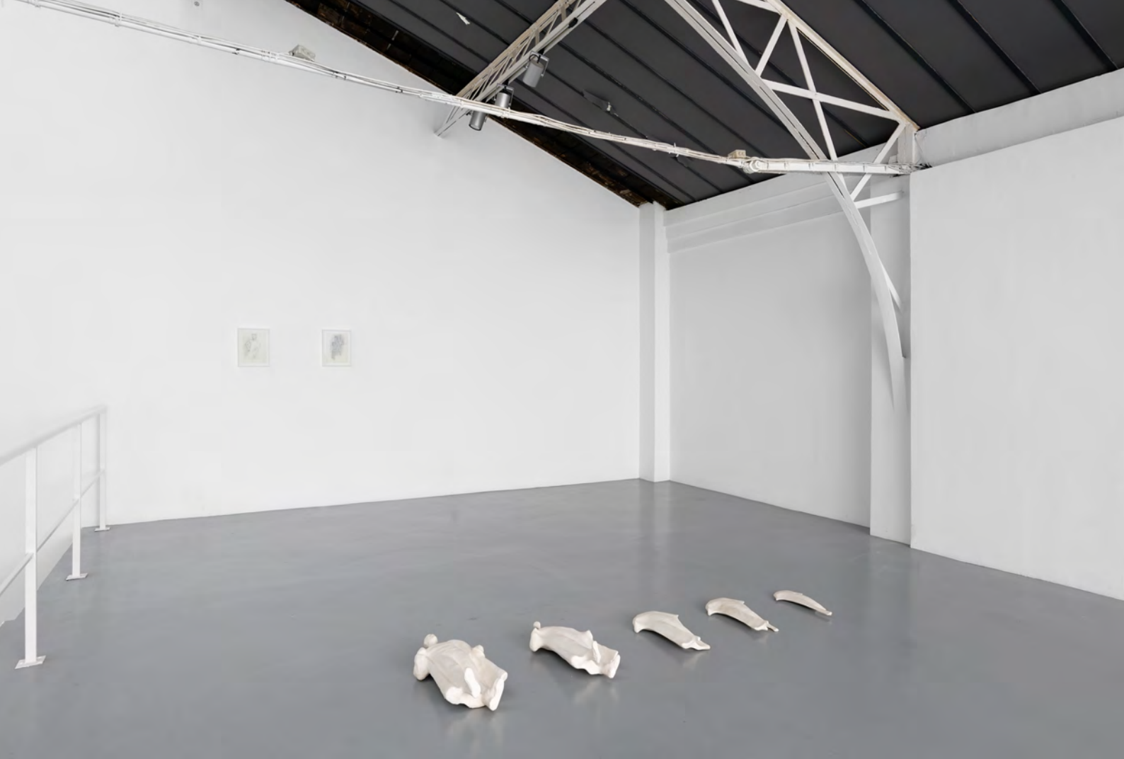
Lenin's Core , 2022 , Edition 2/3, 5 Acrylic resin sculptures, 66 x 23 x 10 cm (26 x 9 x 4 in.) / 64 x 22 x 10 cm (25 x 8 1/2 x 4 in.) / 49 x 22 x 10 cm (19 x 17 2/3 x 4 in.) / 45 x 21 x 7 cm (17 2/3 x 8 x 2 1/2 in.) / 43 x 18 x 6 cm (17 x 7 x 2 in.)