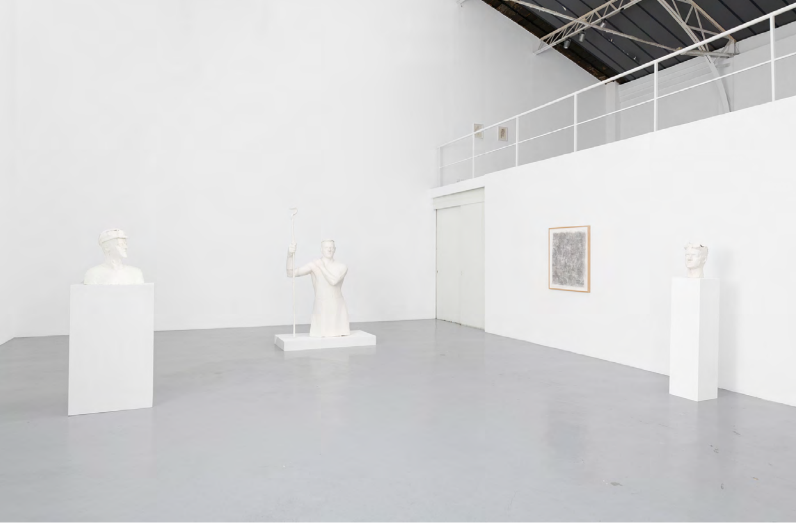
Ciprian Mureșan, Echoes of Sculpture , 2023, Installation view, Paris