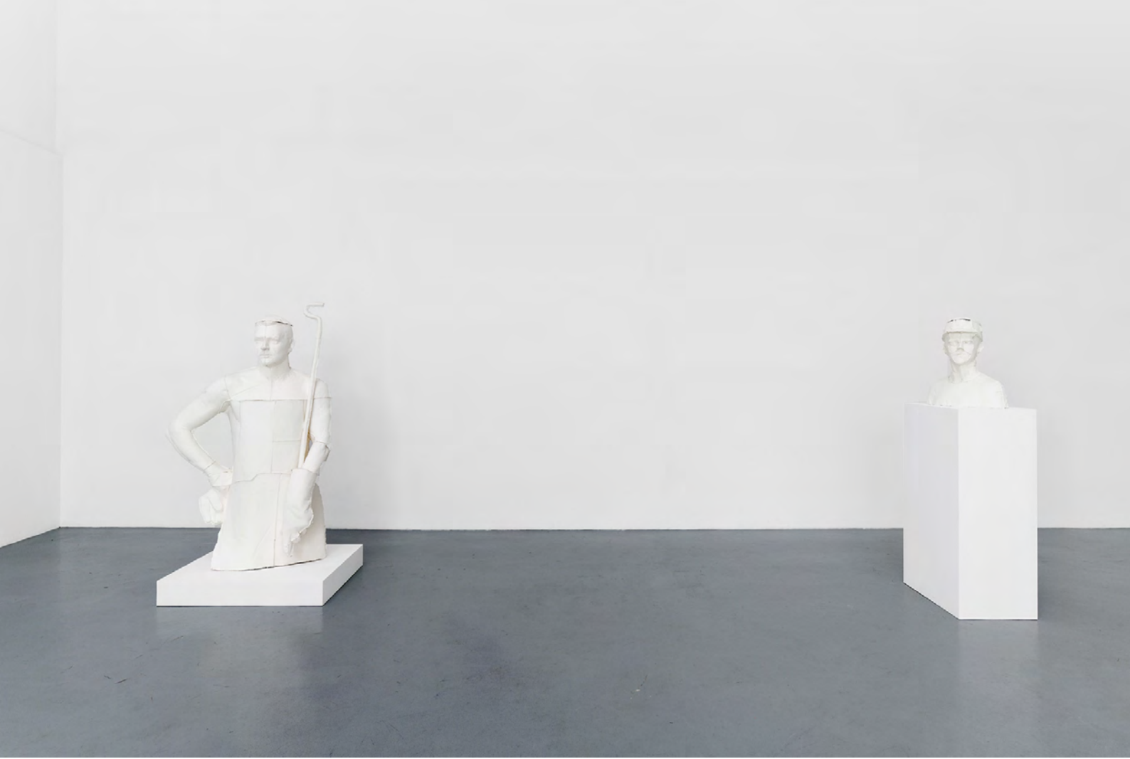
Ciprian Mureșan, Echoes of Sculpture , 2023, Installation view, Paris