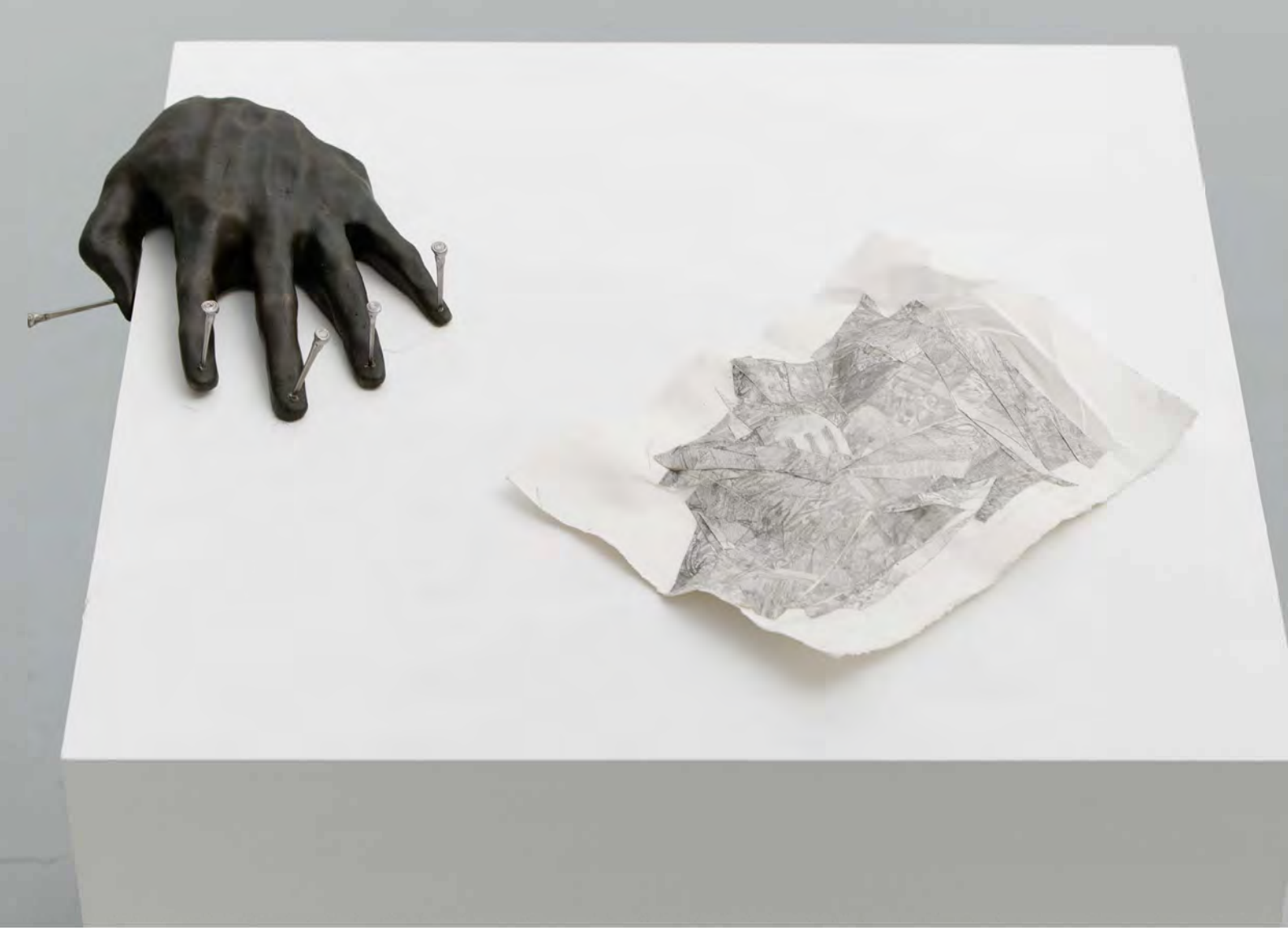
Ciprian Mureșan, Echoes of Sculpture , 2023, Installation view, Paris