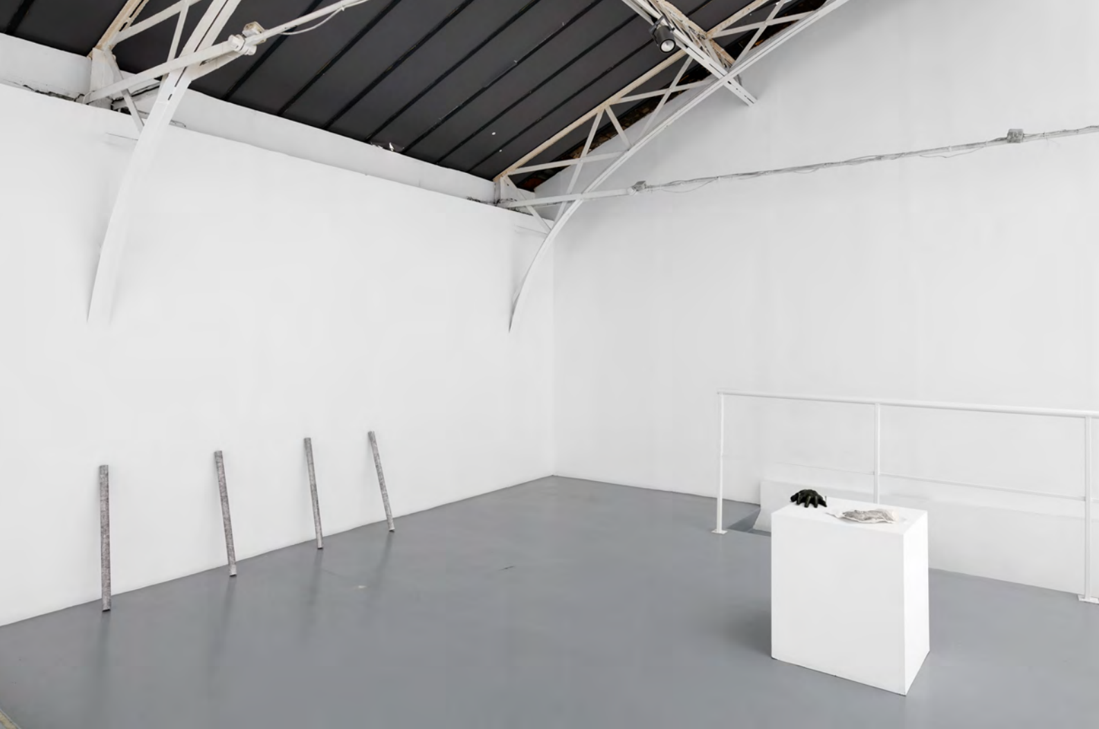
Ciprian Mureșan, Echoes of Sculpture , 2023, Installation view, Paris