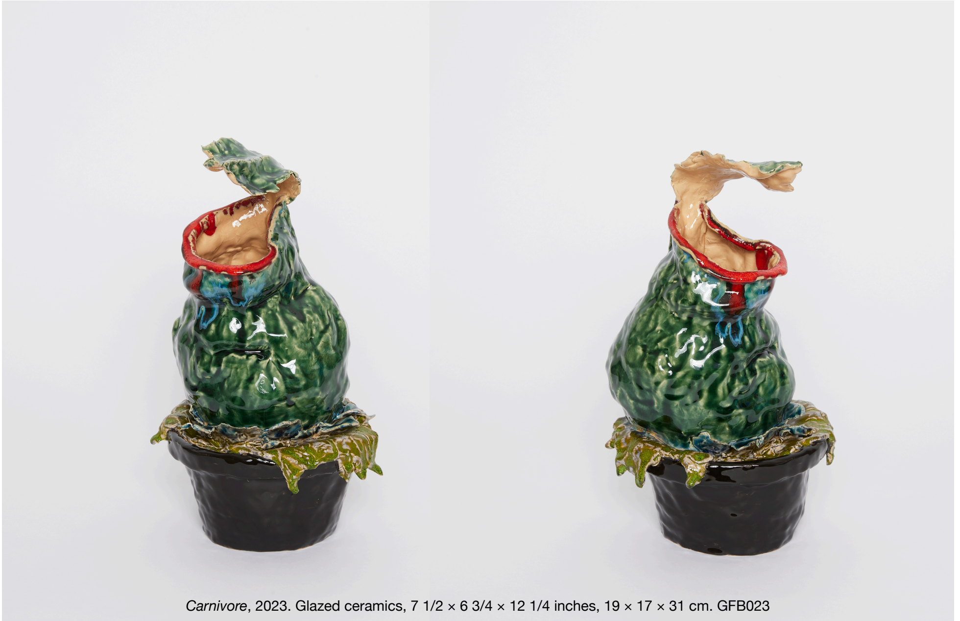
Carnivore , 2023. Glazed ceramics, 7 1/2 × 6 3/4 × 12 1/4 inches, 19 × 17 × 31 cm. GFB023