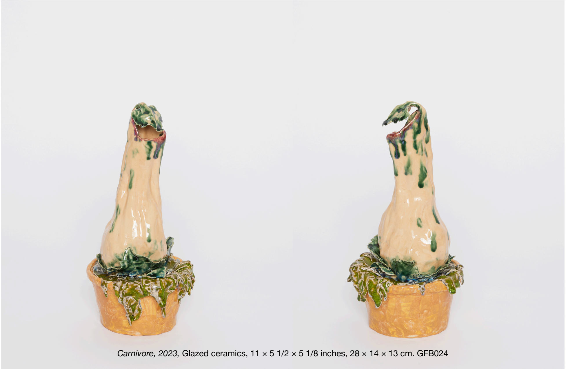
Carnivore , 2023, Glazed ceramics, 11 × 5 1/2 × 5 1/8 inches, 28 × 14 × 13 cm. GFB024