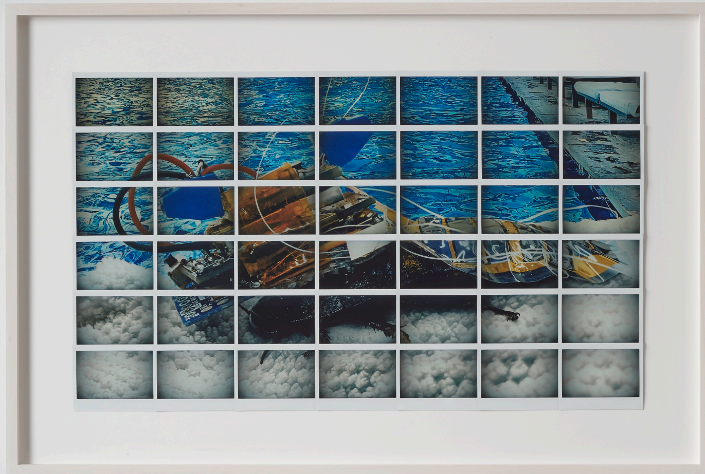
Roach Retreat III , 2023. Fujifilm Instax Wide, framed, 16 7/8 × 28 3/8 inches, 43 × 72 cm. GFB040