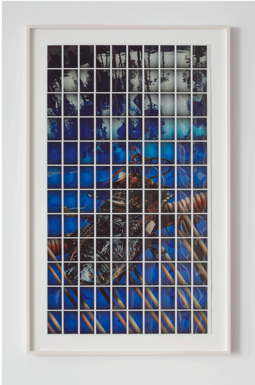
Roach Retreat II, 2023. Fujifilm Instax Wide Framed 48 7/8 × 27 1/2 inches 124 × 70 cm GFB039