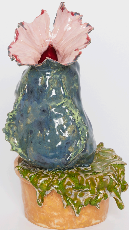
5 1/2 x 5 1/8 x 9 1/2 inches, 14 x 13 x 24 cm