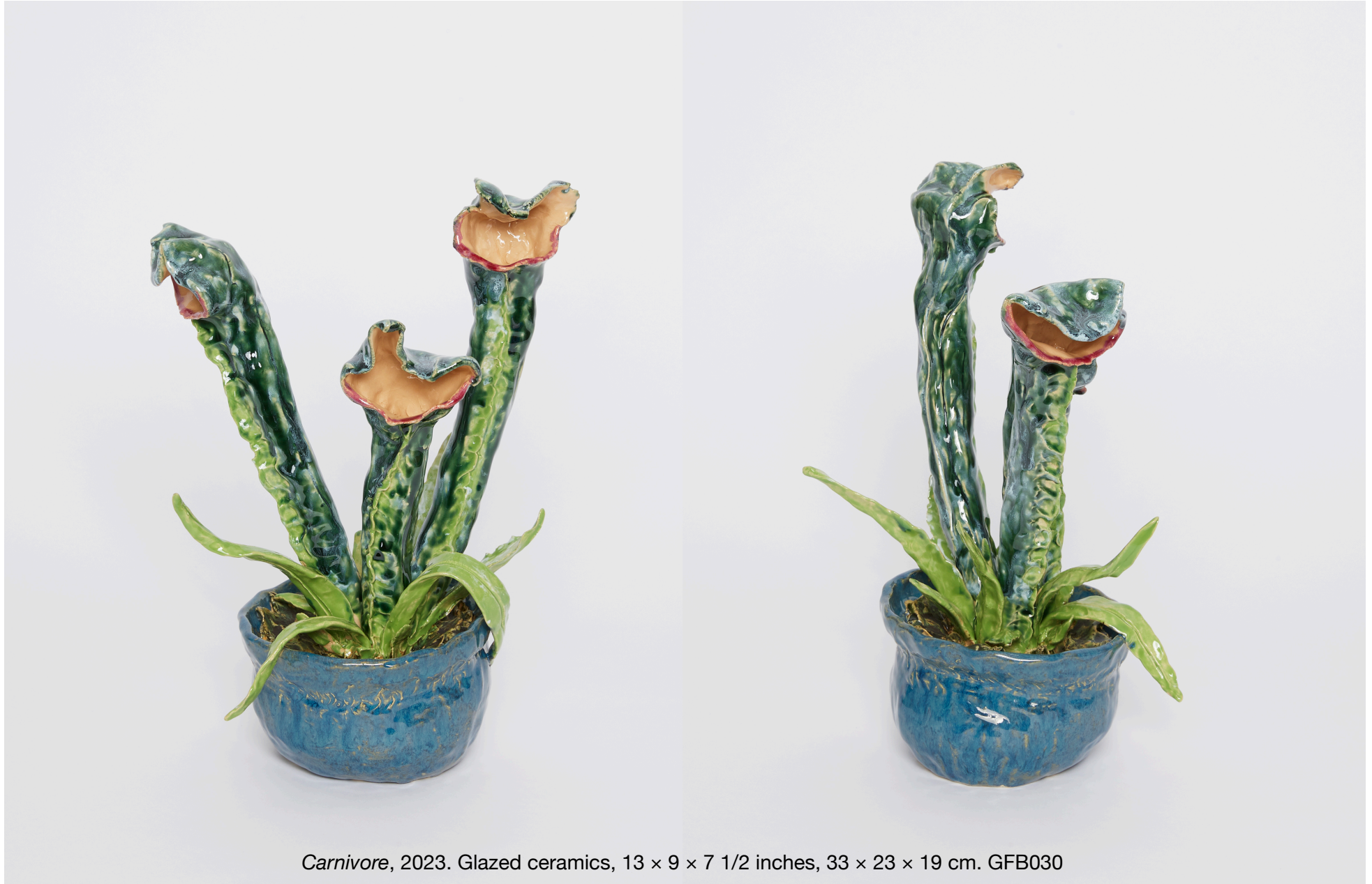
Carnivore , 2023. Glazed ceramics, 13 × 9 × 7 1/2 inches, 33 × 23 × 19 cm. GFB030