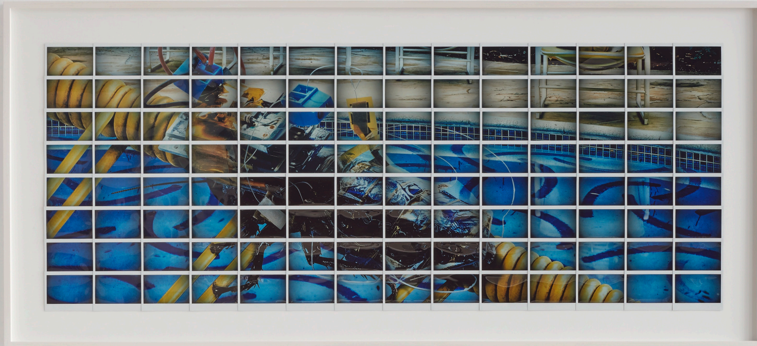
Roach Retreat I , 2023. Fujifilm Instax Wide, framed, 22 × 56 3/4 inches, 56 × 144 cm. GFB038