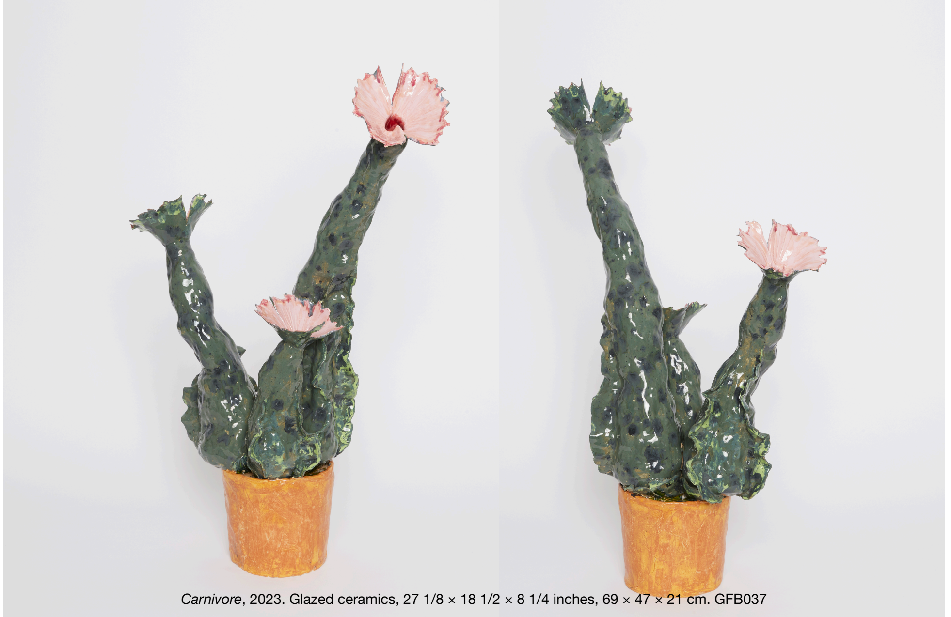
Carnivore , 2023. Glazed ceramics, 27 1/8 × 18 1/2 × 8 1/4 inches, 69 × 47 × 21 cm. GFB037