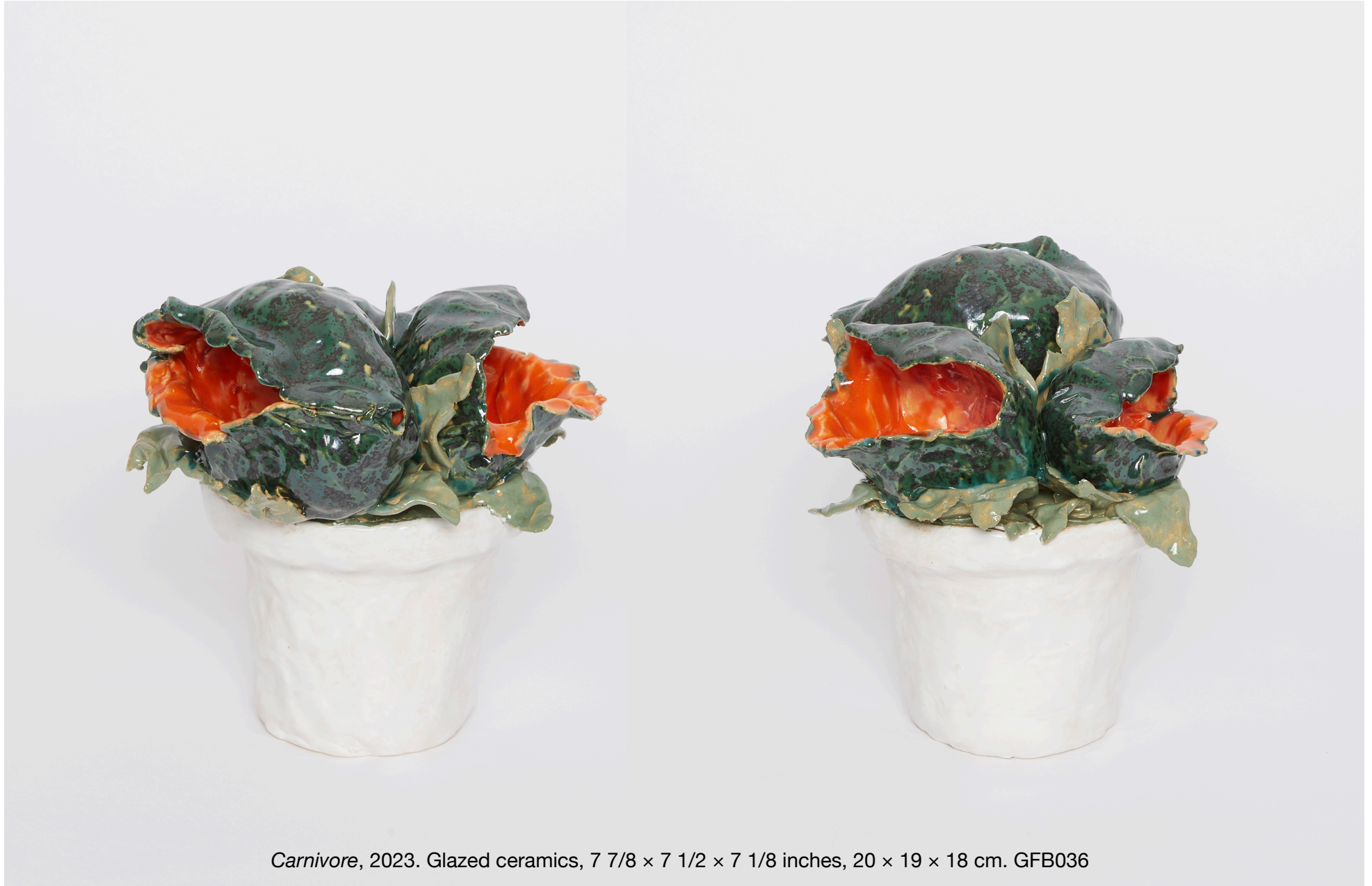
Carnivore , 2023. Glazed ceramics, 7 7/8 × 7 1/2 × 7 1/8 inches, 20 × 19 × 18 cm. GFB036