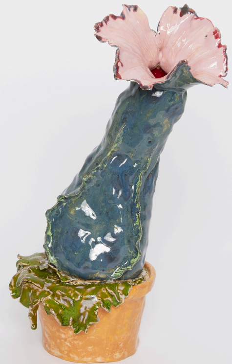
12 1/4 x 7 7/8 x 5 1/2 inches, 31 x 20 x 14 cm