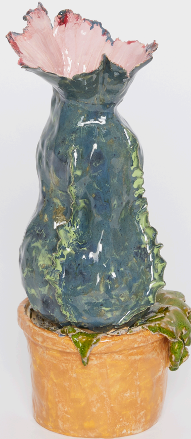
11 x 5 1/8 x 4 3/4 inches, 28 x 13 x 12 cm