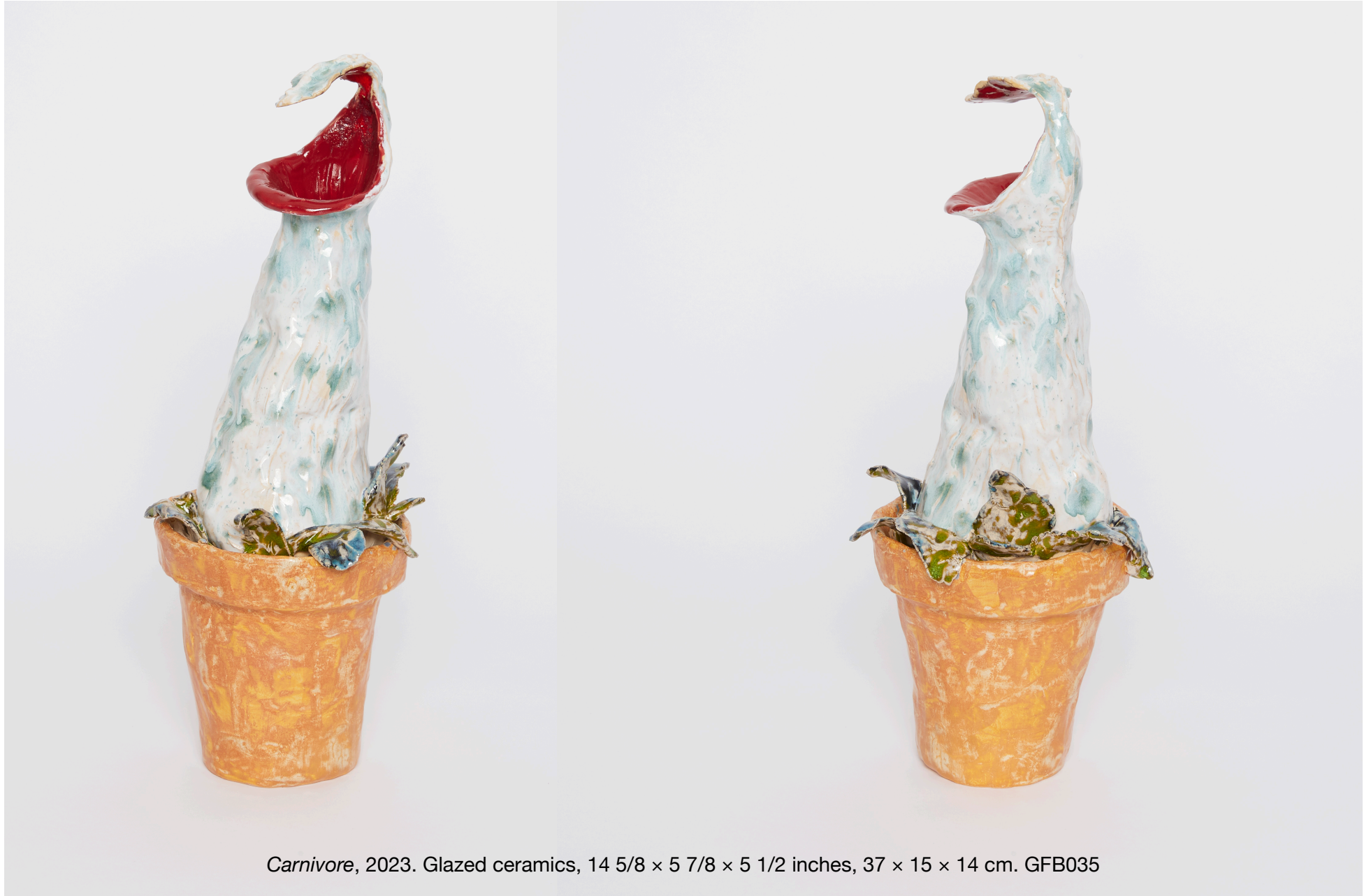
Carnivore , 2023. Glazed ceramics, 14 5/8 × 5 7/8 × 5 1/2 inches, 37 × 15 × 14 cm. GFB035