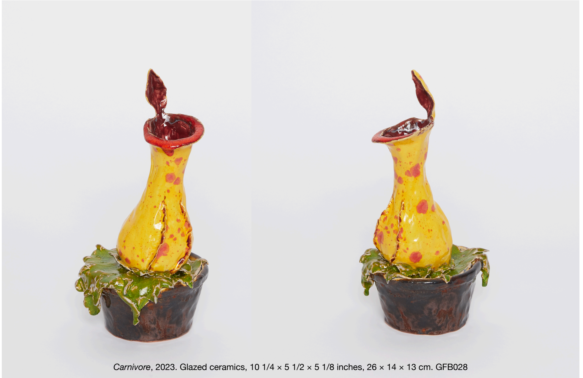
Carnivore , 2023. Glazed ceramics, 10 1/4 × 5 1/2 × 5 1/8 inches, 26 × 14 × 13 cm. GFB028