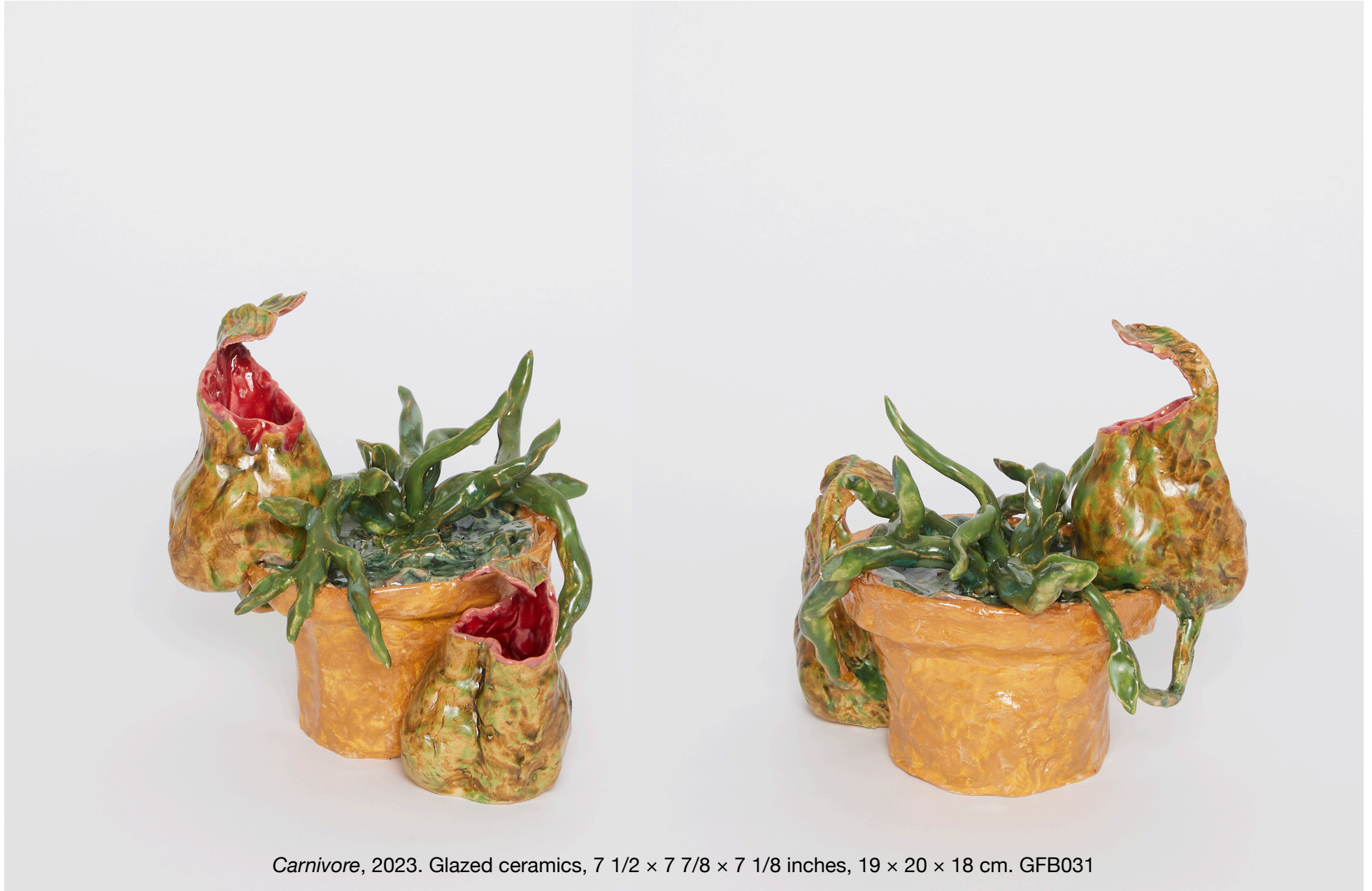
Carnivore , 2023. Glazed ceramics, 7 1/2 × 7 7/8 × 7 1/8 inches, 19 × 20 × 18 cm. GFB031