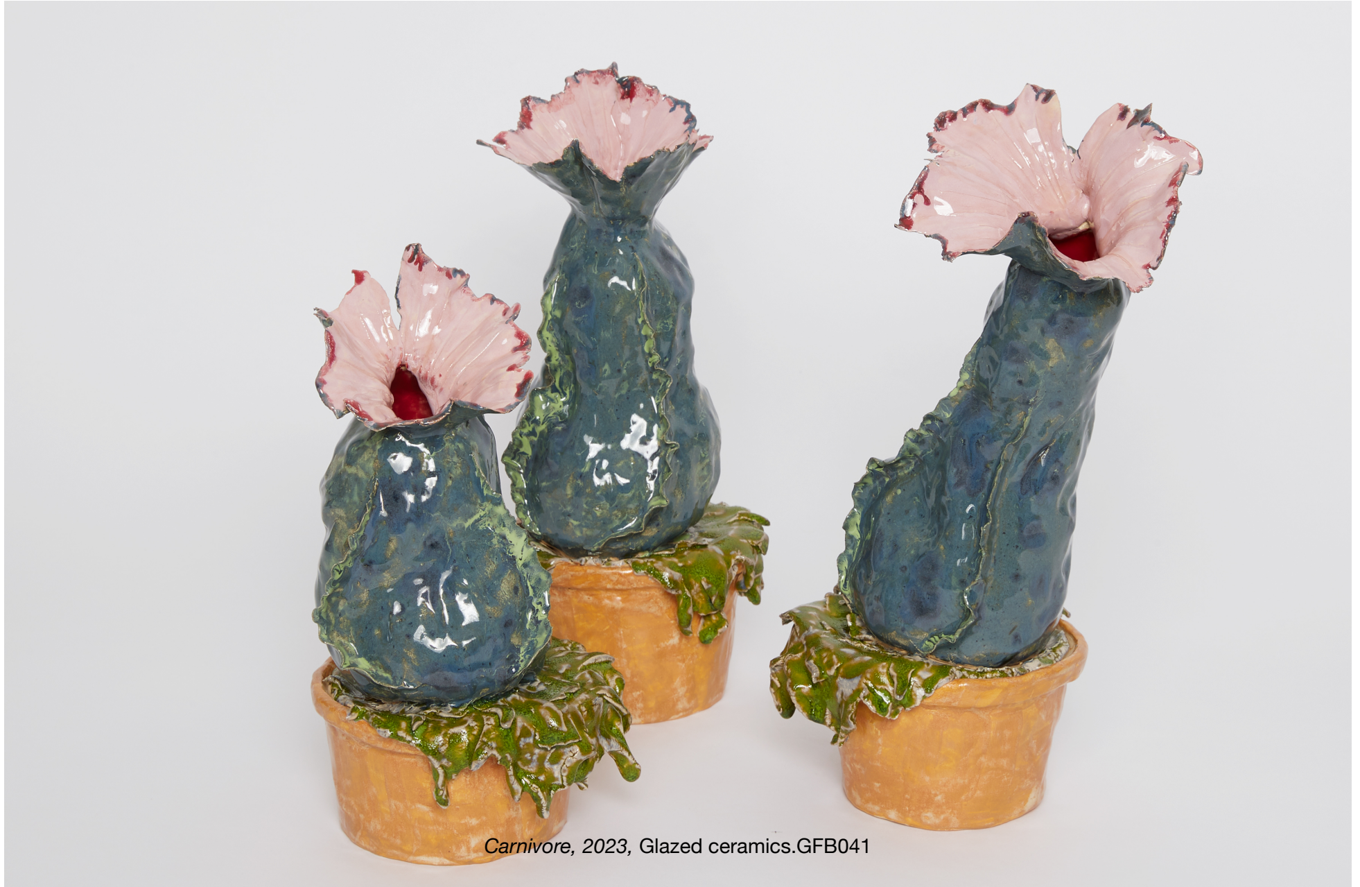
Carnivore , 2023, Glazed ceramics.GFB041