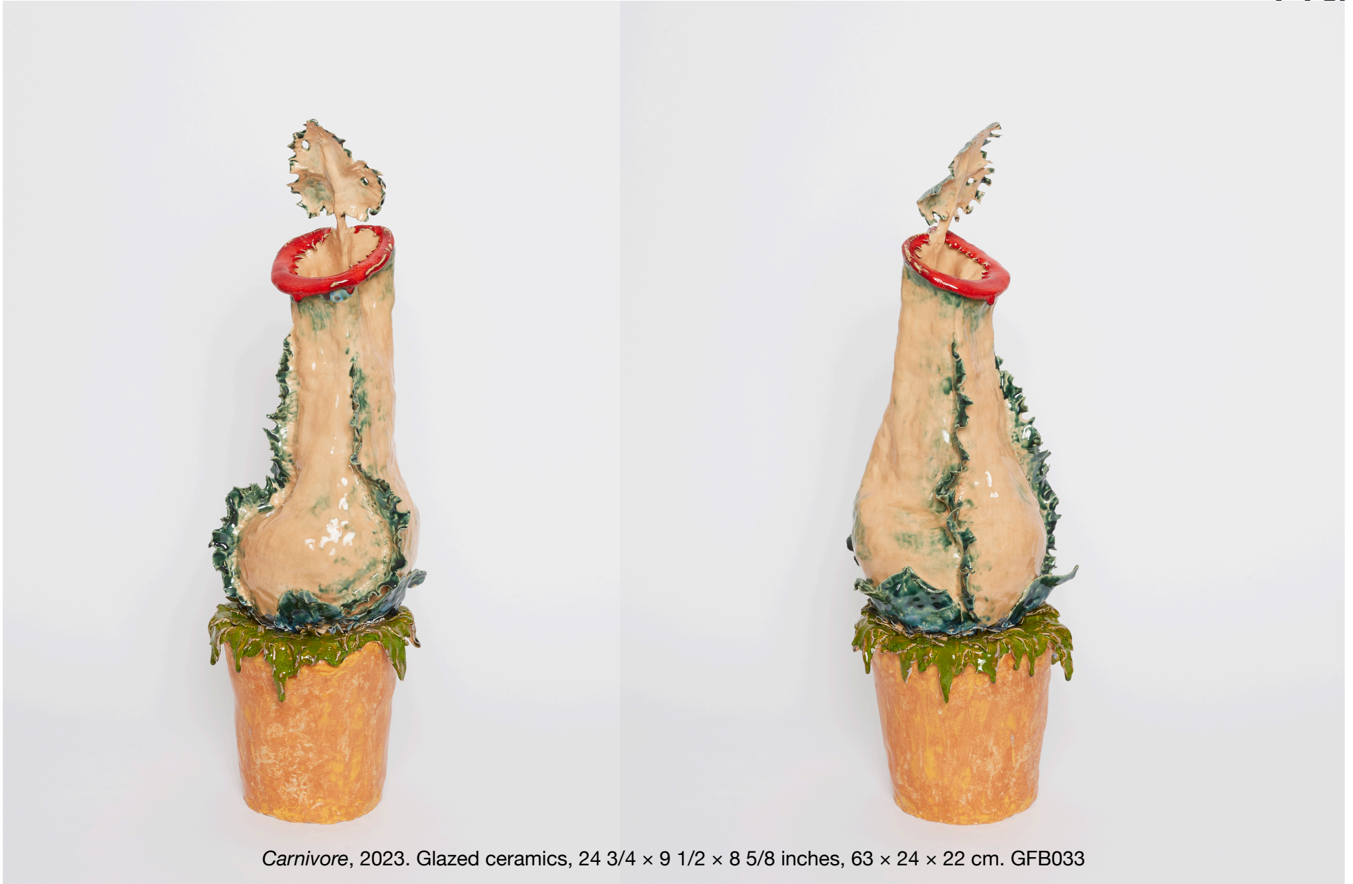
Carnivore , 2023. Glazed ceramics, 24 3/4 × 9 1/2 × 8 5/8 inches, 63 × 24 × 22 cm. GFB033