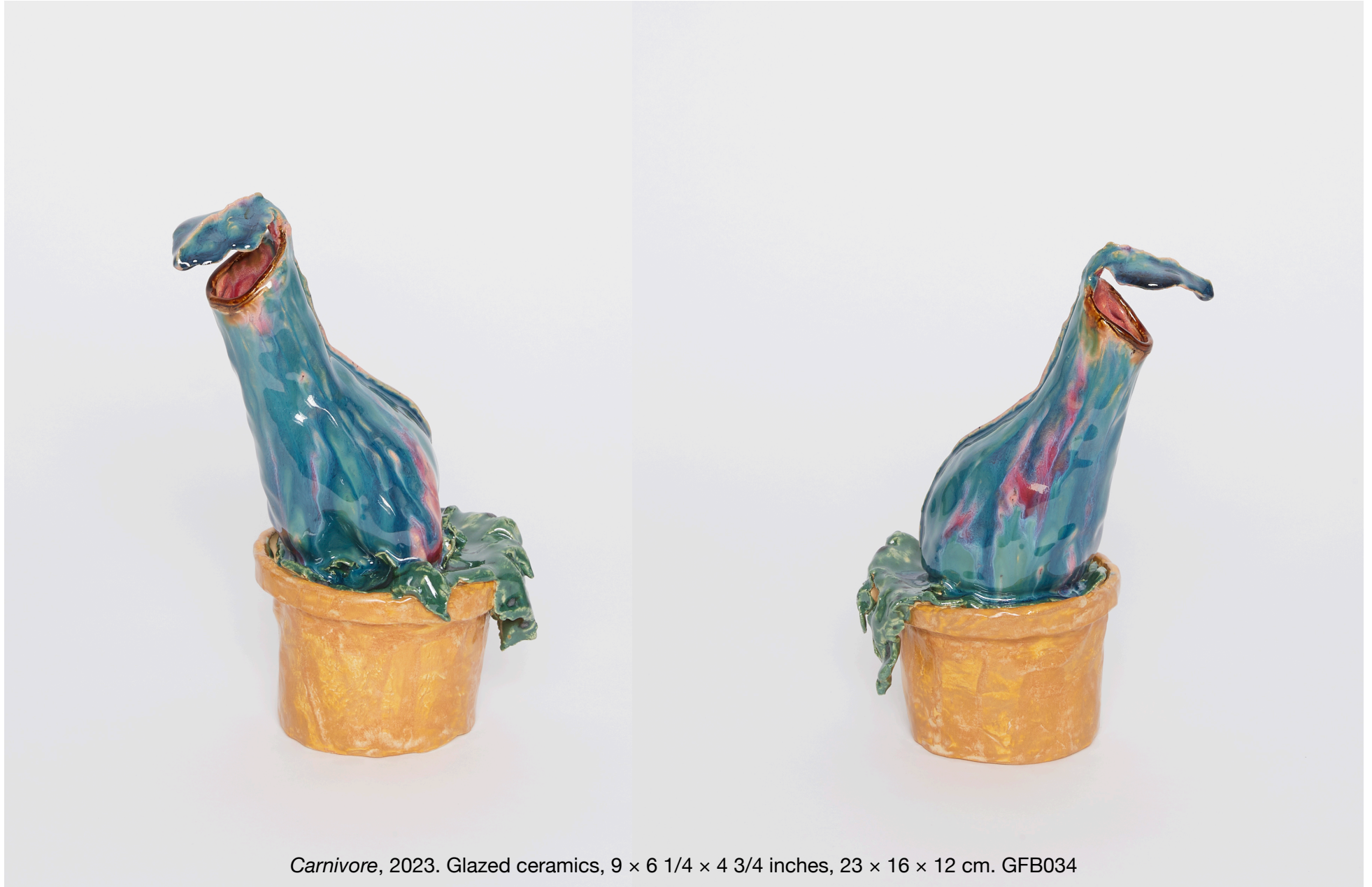
Carnivore , 2023. Glazed ceramics, 9 × 6 1/4 × 4 3/4 inches, 23 × 16 × 12 cm. GFB034