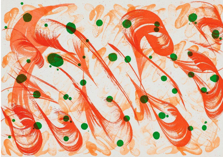
Sonia Kacem - Grand geste I , 2023